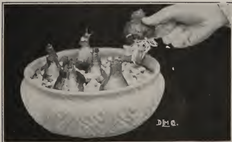
Narcissus Bulbs in Pearl Chips and Water