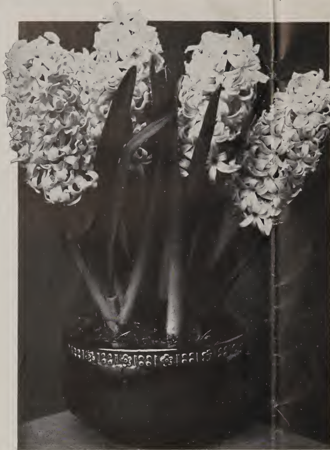
Pan of Hyacinths