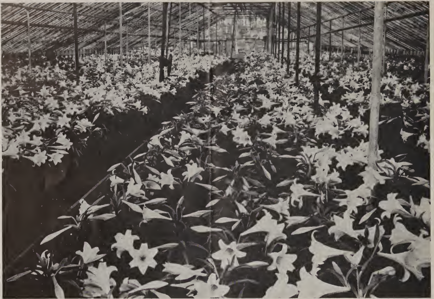
A House of Liliium Giganteum