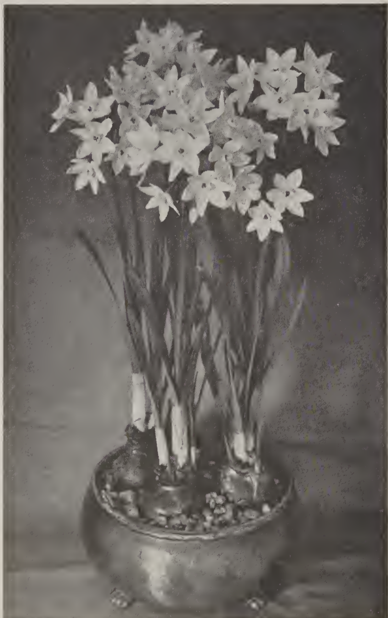
Paperwhite Narcissus Growing in Bowls Filled With Colored Pebbles and Water

Aureum (South African Gold Star). Bright orange color. Finest of all Ornithogalum. Good keeper as a cut flower. Makes a good pot plant. First size. $7.00 $60.00 Top size. 8.00 75.00 Arabicum (Star of Bethlehem). Fragrant white flowers with glistening black central boss and yellow anthers. Many flowers on stems. First size. 5.00 45.00 Top size. 7.00 60.00 Thyrsoides (South African Chincheriee). Satiny white flowers with brown eye. First size. 3.50 30.00 Top size. 4.00 35.00 Thyrsoides Double (South African Chincheriee). New and distinct variety. Resembles a double Tuberose. Keeps blooming for several months. Desirable cut flower. Stems 24 to 36 in. First size. 5.00 45.00 Top size. 7.00 60.00