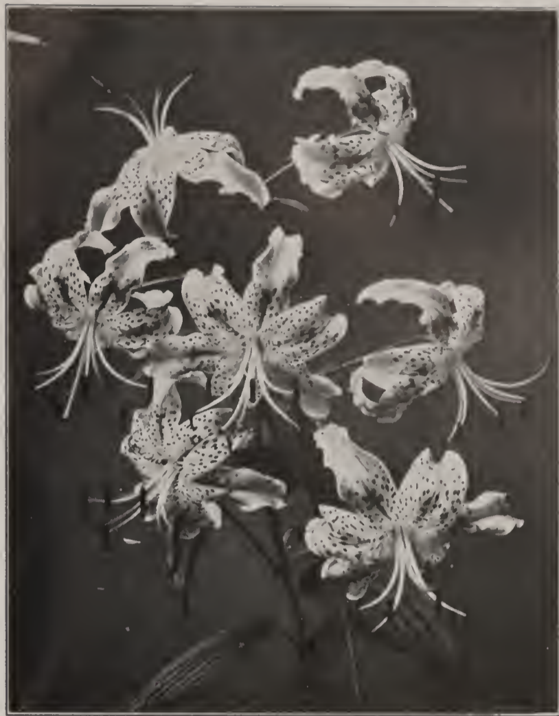
Lilium Speciosum Rubrum, Easily Grown in Greenhouses or Outdoors as a Hardy Lily