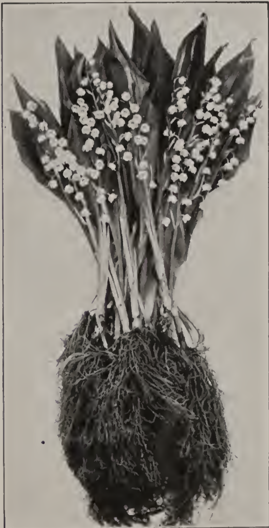
Lily-of-the-valley from Pips

Non-Warranty —We do not warrant in any way, express or implied, the contents or description, purity, productiveness, or any other matter of any seeds, bulbs or plants sold by us, and we will not be in any way responsible for the crop. If the purchaser does not accept these goods on above terms, no sale is made thereof, and he must return them at once and money will be refunded. Subject to above conditions, we make this sale at the moderate prices at which we sell our goods. All claims must be made in writing within five days after receipt of goods.