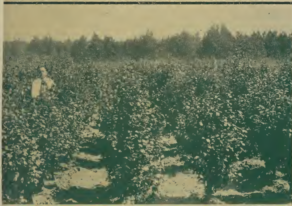
PARTIAL VIEW OF OVER 50,000 OF OUR SPECIMEN CAMELLIAS