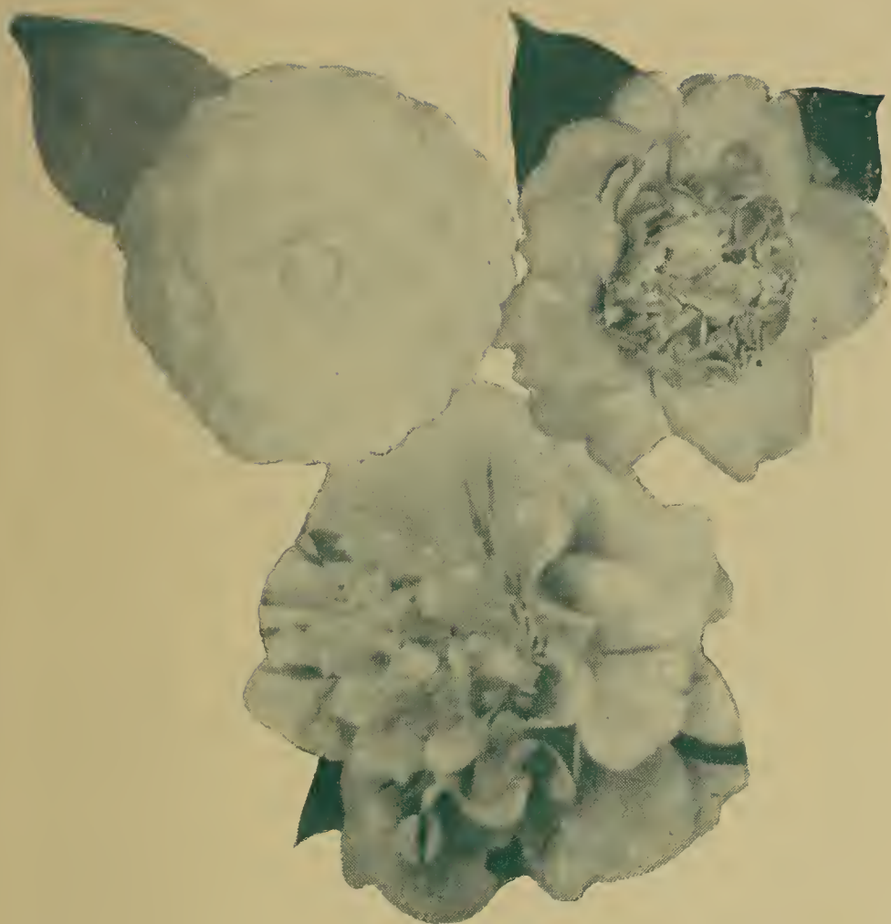
Upper Left—Pink Perfection Upper Right—Kellingtonia Lower—Herme