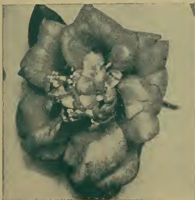
JARVIS RED Semi-Double

JARVIS RED — Deep blood-red, semi-double flowers with golden stamens makes this flower very attractive among dark green foliage. One of the most popular kind. (See illustration).