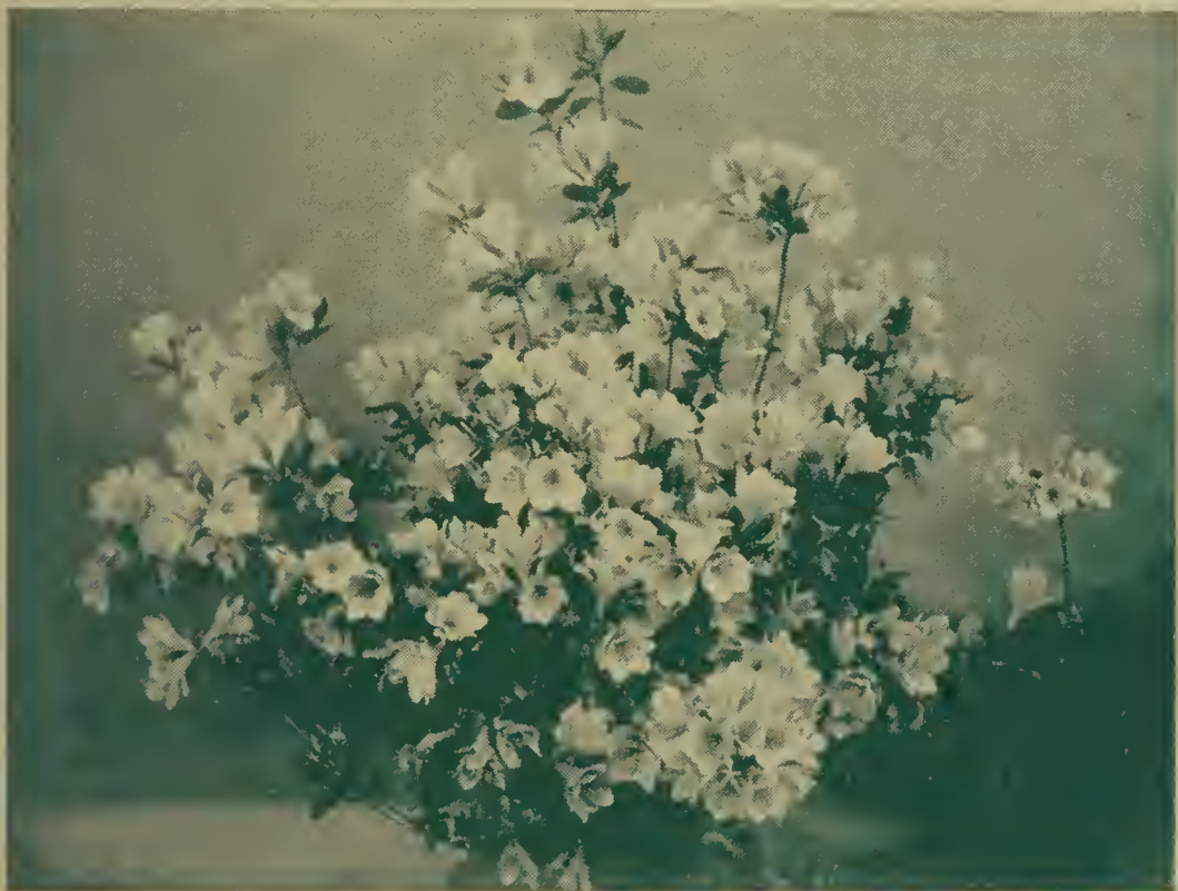
CORAL BELLS—10-12 inch Size

The demand for Kurume Azaleas as pot plants from Eastern and Northern Florists has been growing by leaps and bounds. When plants are received from us, all you have to do is to pot them in light peaty soil, keep in moderately warm houses, and spray with strong force of water daily to keep down red spiders and they will come into full bloom in