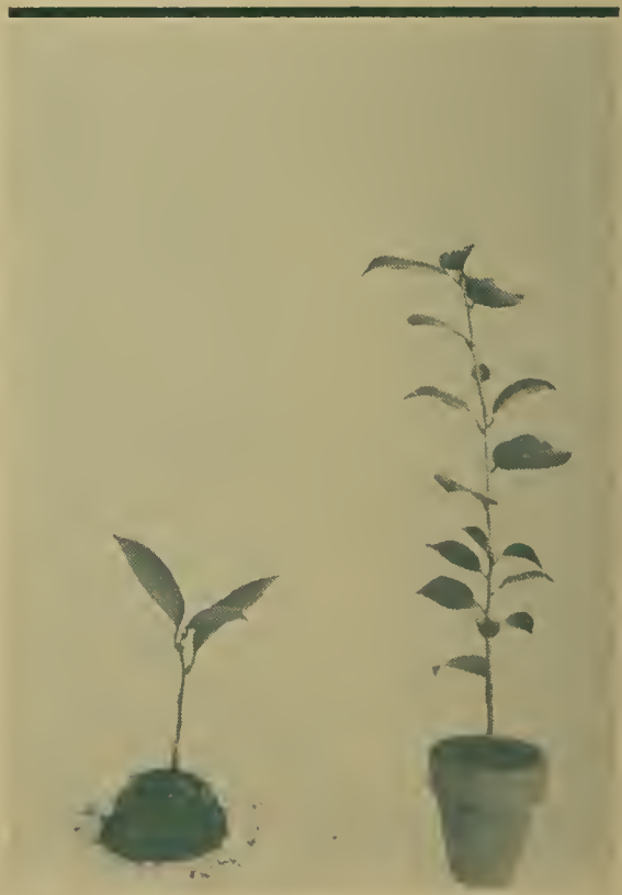
3-5 inch, Bench Grown and 8-12 inch Pot