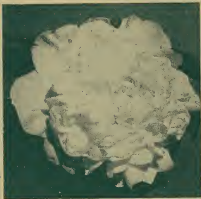
MRS. ABBY WILDER

MRS. ABBY WILDER —Peony shaped white flowers, medium to large, with tiny splashes of pink. Compact and good grower. (See illustration).