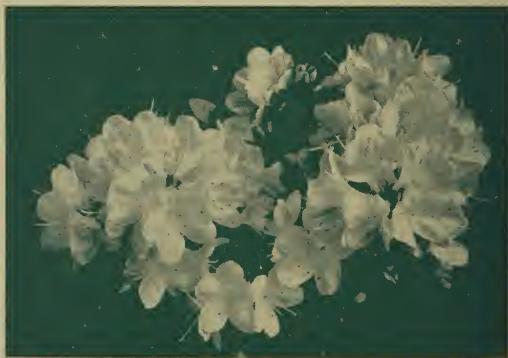
SALMON QUEEN—6-8 inch Size

SALMON QUEEN — Large size, single flowers of salmon-pink are produced in great profusion in mid-season. One of the most attractive.