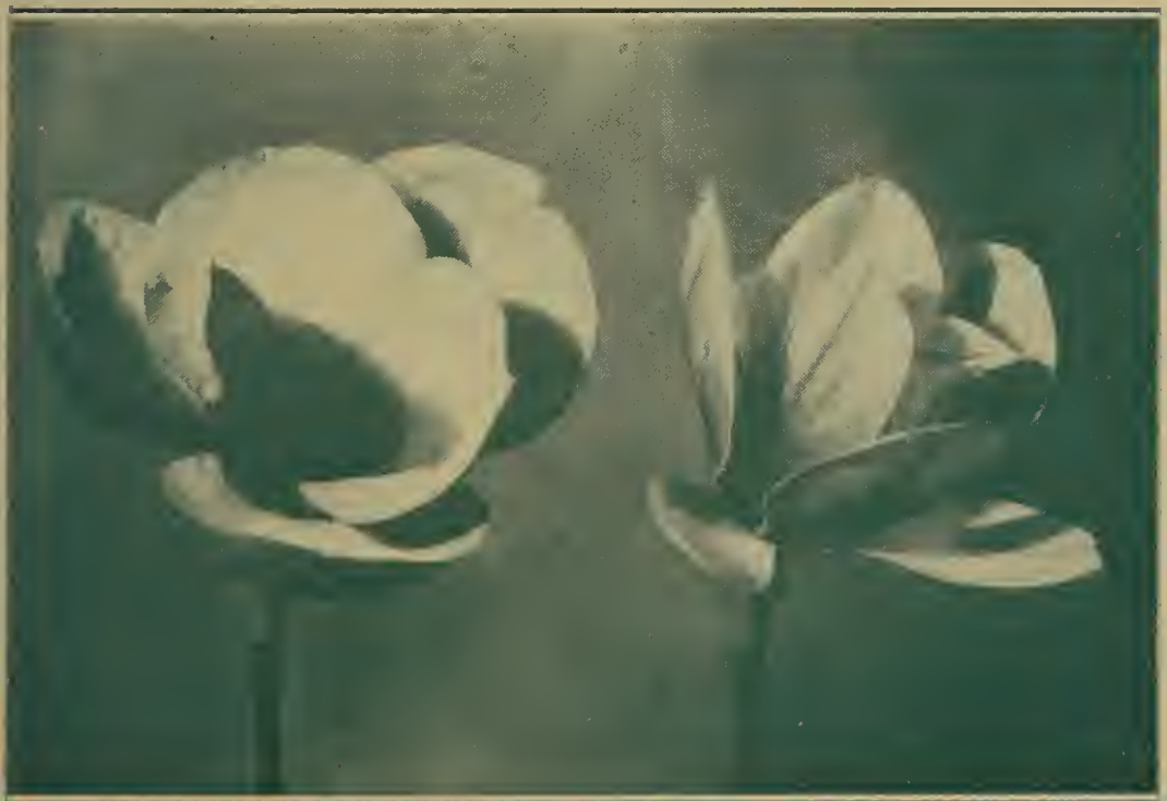
MAGNOLIA RUSTICA RUBRA