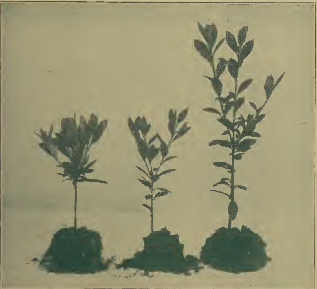
4-6 and 6-8 inch Bed Grown Azaleas Shown with 3-inch pot.

Our 4-6 inch, bed grown Azaleas are recommended and sold to Nurserymen and Florists only for the purpose of lining out and growing on into larger sizes. They do not have flower buds and are of no value for immediate effect.