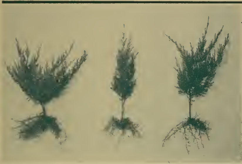
Jun. C. Sargentii Jun. Communis Jun. C. Pfitzeriana