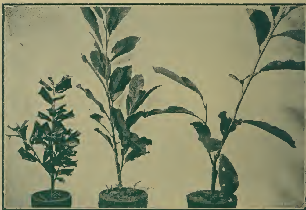
ILEX CORNUTA FEMINA 2½ inch Pot