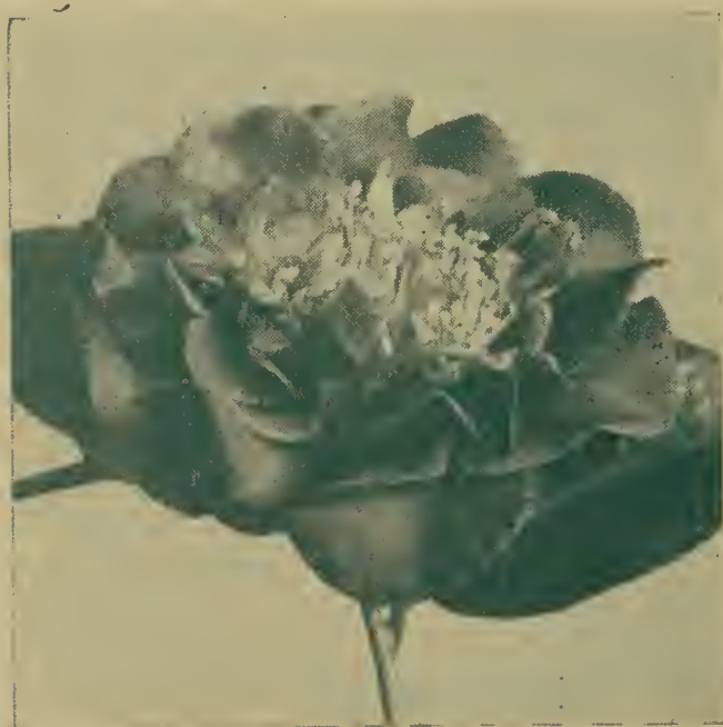
TANNER- WILLIAMS RED

REV. JOHN BENNETT — Orange-red, semi-double flowers of good size, often stamens twisted with petals. Rather small, roundish, dark green foliage and very compact, but a good grower.