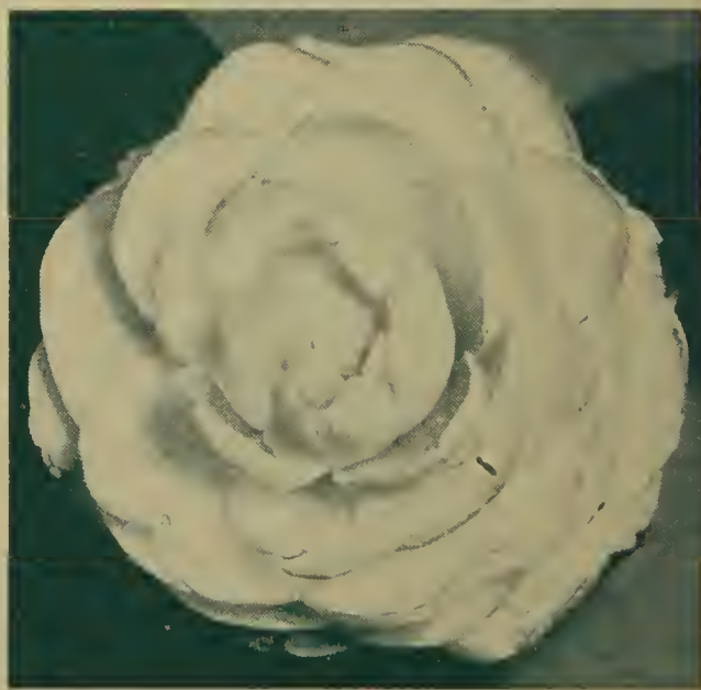
ELIZABETH Very Double

COMTE DE GOMER — Very double creamy petals are dotted with numerous pink spots. Early season, compact, but slow grower.