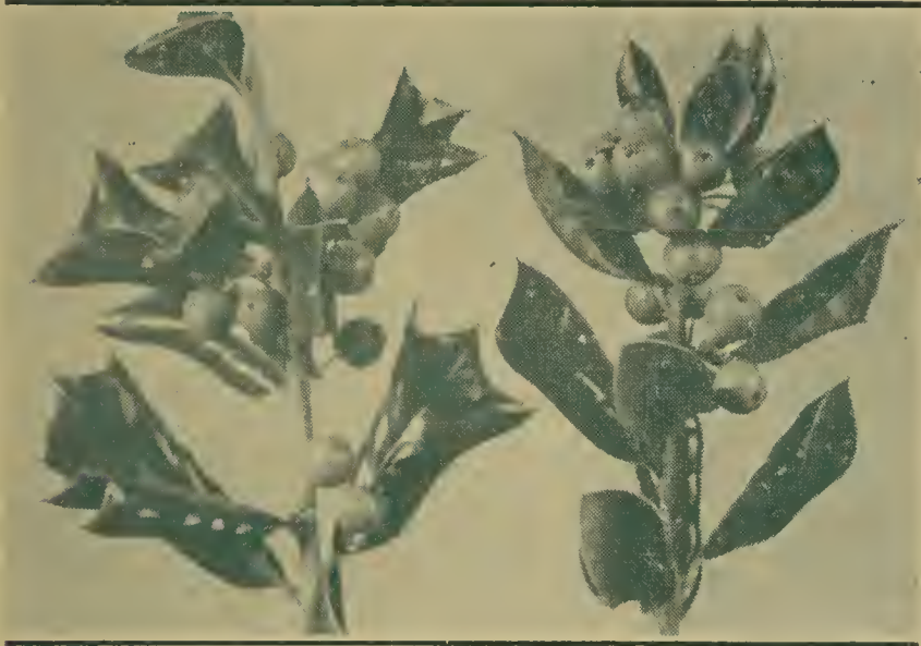
Ilex Cornuta Femina Ilex Cornuta Burfordi