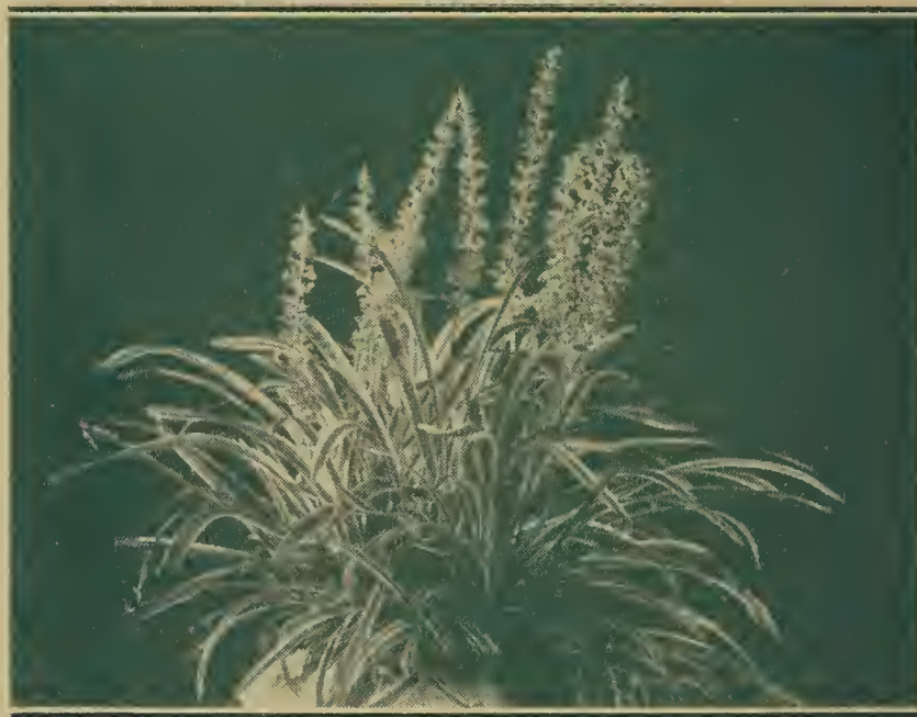
LIRIOPE MUSCARI VARIEGATA