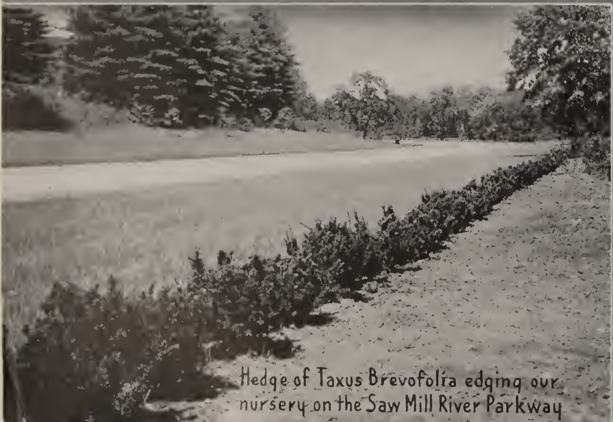
Hedge of Taxus brevifolia edging our nursery on the Saw Mill River Parkway