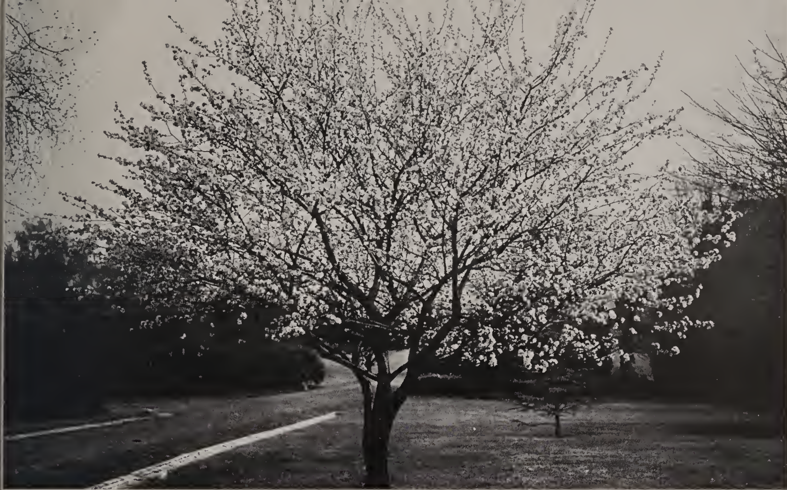
Besides their utility value, fruit trees add color and beauty during flowering season.