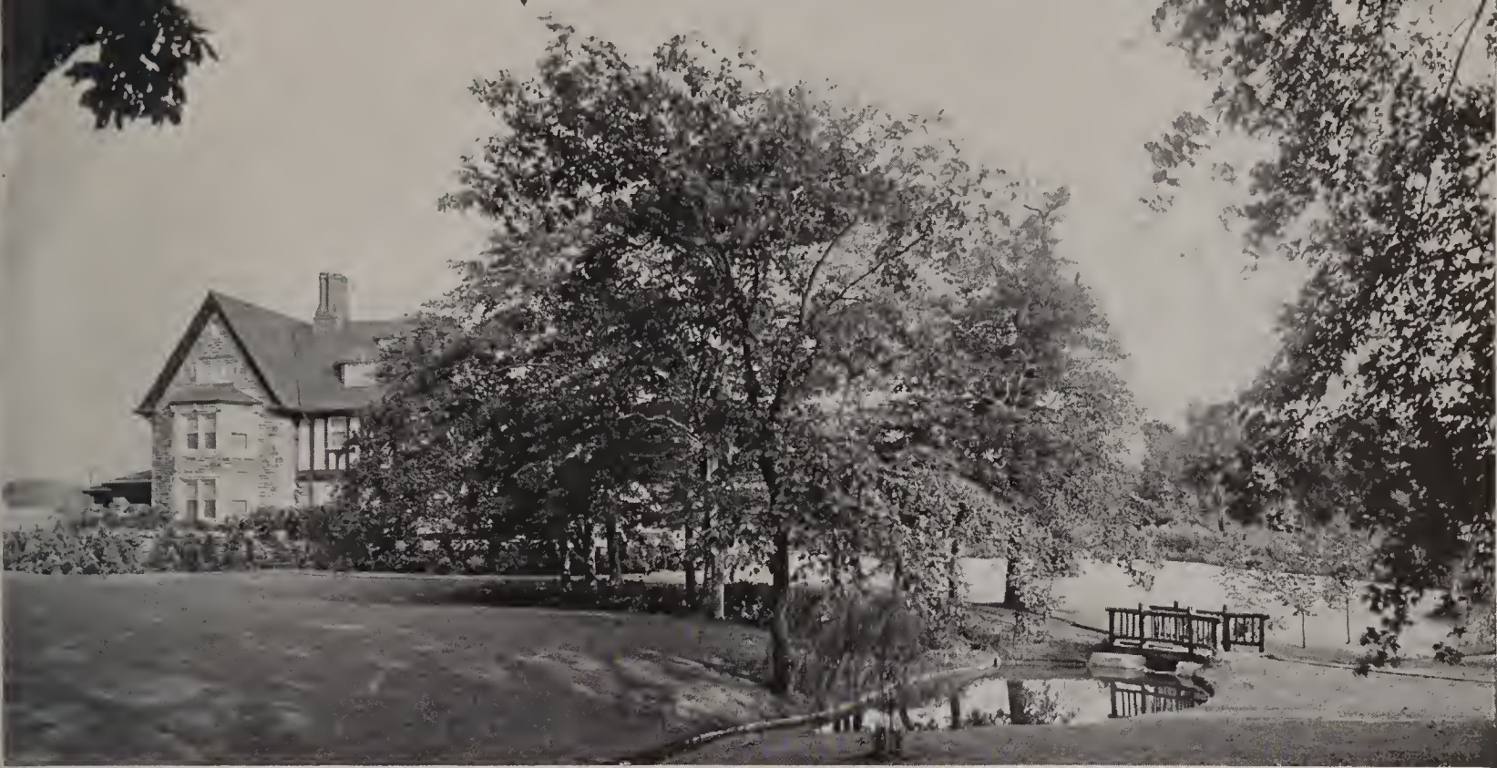
Beautiful lawns are essential in any well planned planting