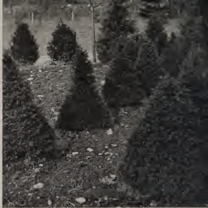
Taxus cuspidata capitata in our nursery