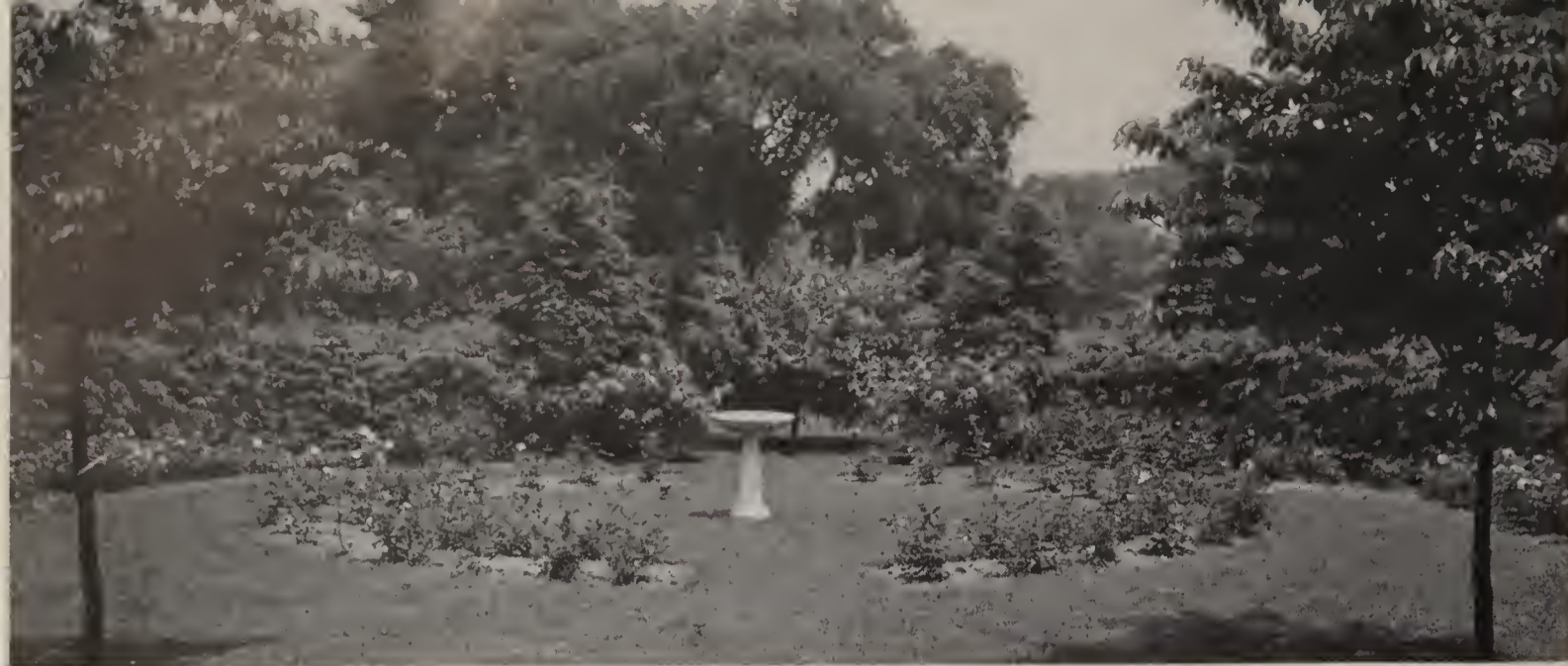
Rose garden designed and planted by us