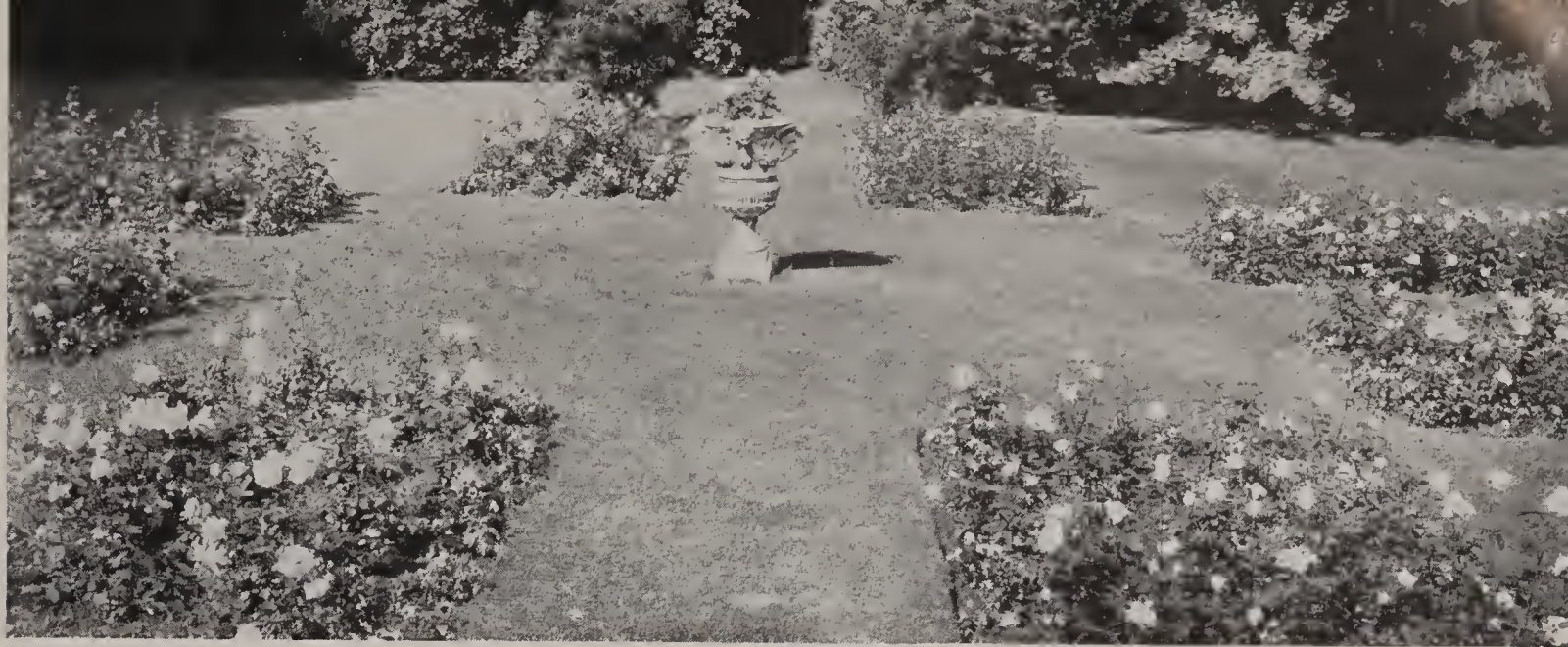
A Rose Garden laid out in beds with grass walks is most pleasing

The Floribunda varieties should be planted in groups of three or more of a kind. Plant them among the shrubs for continuous color. Use them as hedges or borders. When planted 15 to 18 inches apart they will shade the ground and the flowers will blanket the foliage. In the smaller gardens they also are a continuous source of excellent cut flowers for the house.