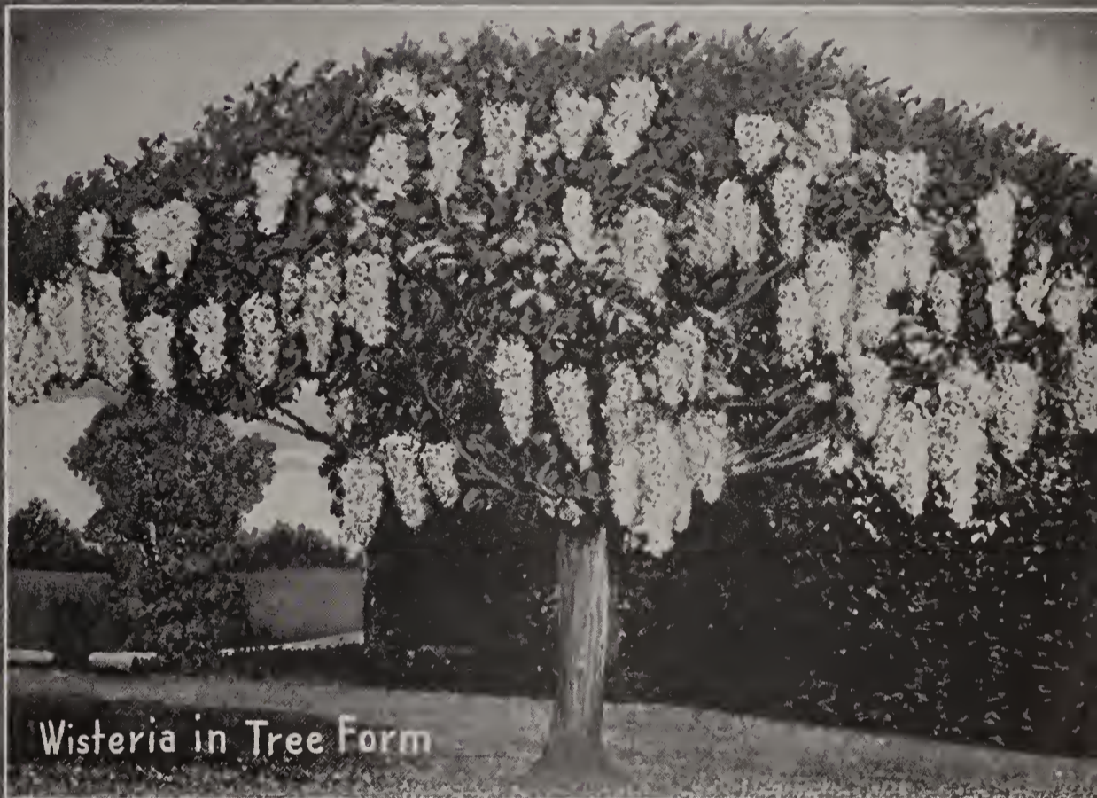
Wisteria in Tree Form

A beautiful and colorful Planting Effective the entire year