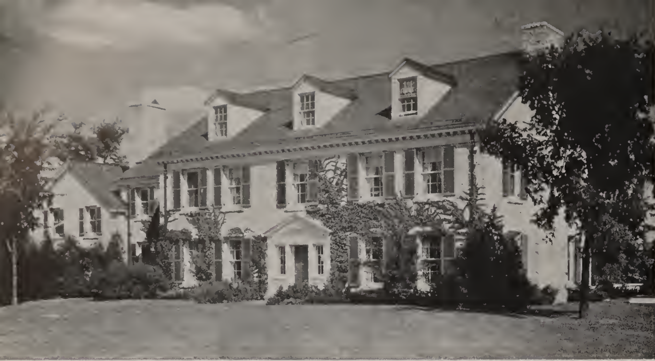
Beside providing the comfort of shade from summer's intense sun, shade trees are invaluable in the framing of the home