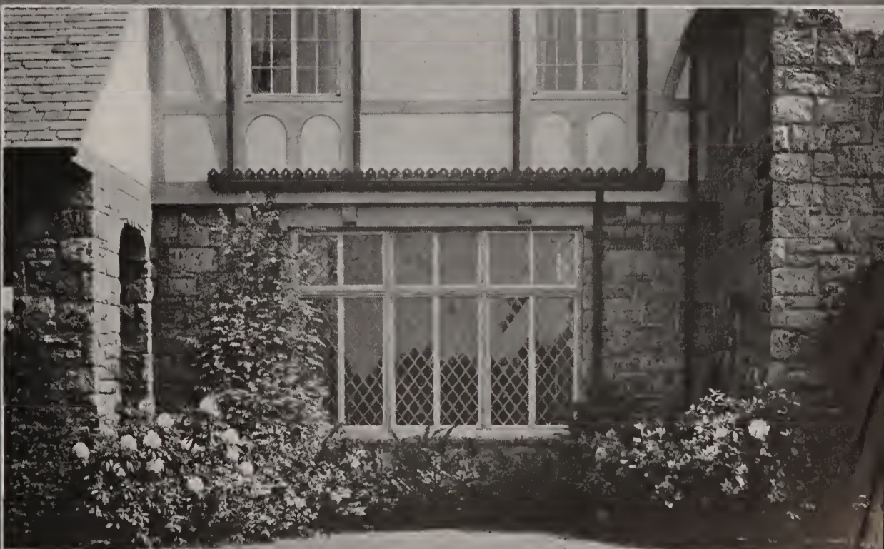
An interesting planting of Rhododendrons and Evergreens