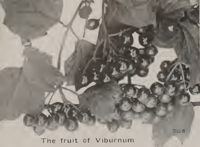
The fruit of Viburnum