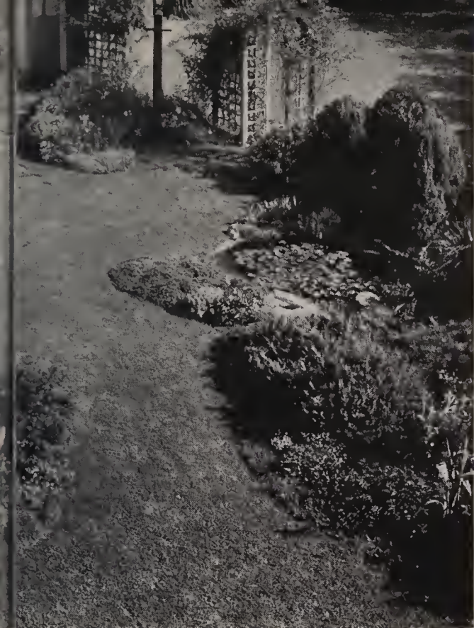
Use of perennials and shrubs add color at lowest cost