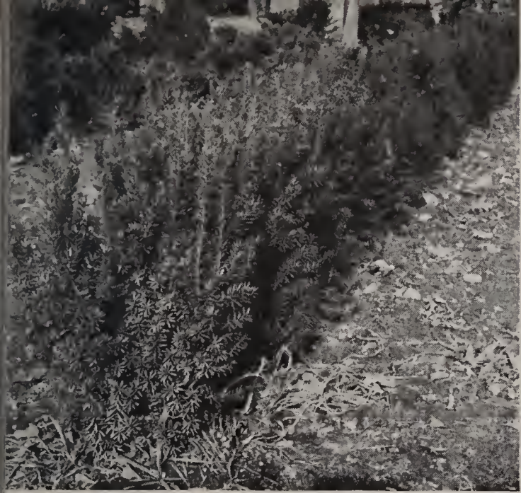
Taxus Hicksi in our nursery