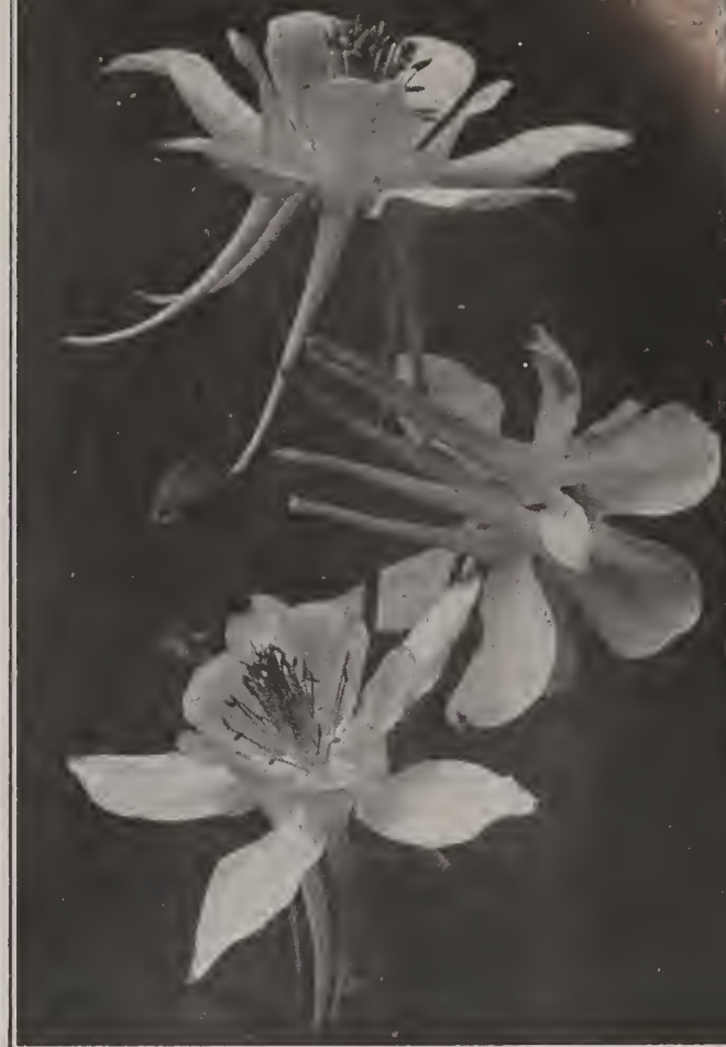
Aquilegia, Mrs. Scott Elliott's Hybrids

We offer for the first time this year a limited number of very double, giant flowered hybrids in segregated colors. Here are fine, strong, spikes and healthy plants. It is possible now to get true color effects in your garden. 2-yr.-old plants in 6-in. pots. 60c. each. Lavender, Light Blue, Dark Blue, White