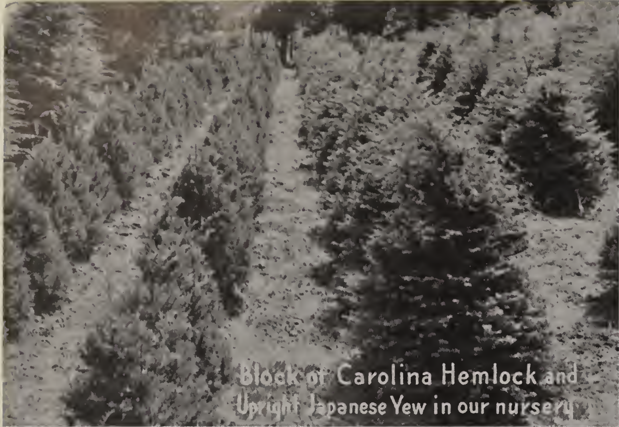
Block of Carolina Hemlock and Upright Japanese Yew in our nursery