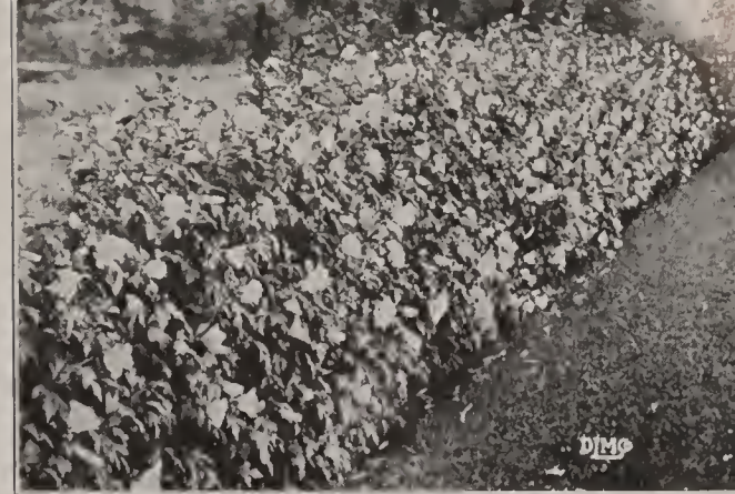
Hedge of Althaea

RHUS cotinus (Smoketree). Much admired for its clouds of purplish, misty flowers in early June. Leaves change to brown, red, and yellow in the Fall. 2 to 3 ft., 75c. each; 3 to 4 ft., $1.00; 4 to 5 ft., $1.25.