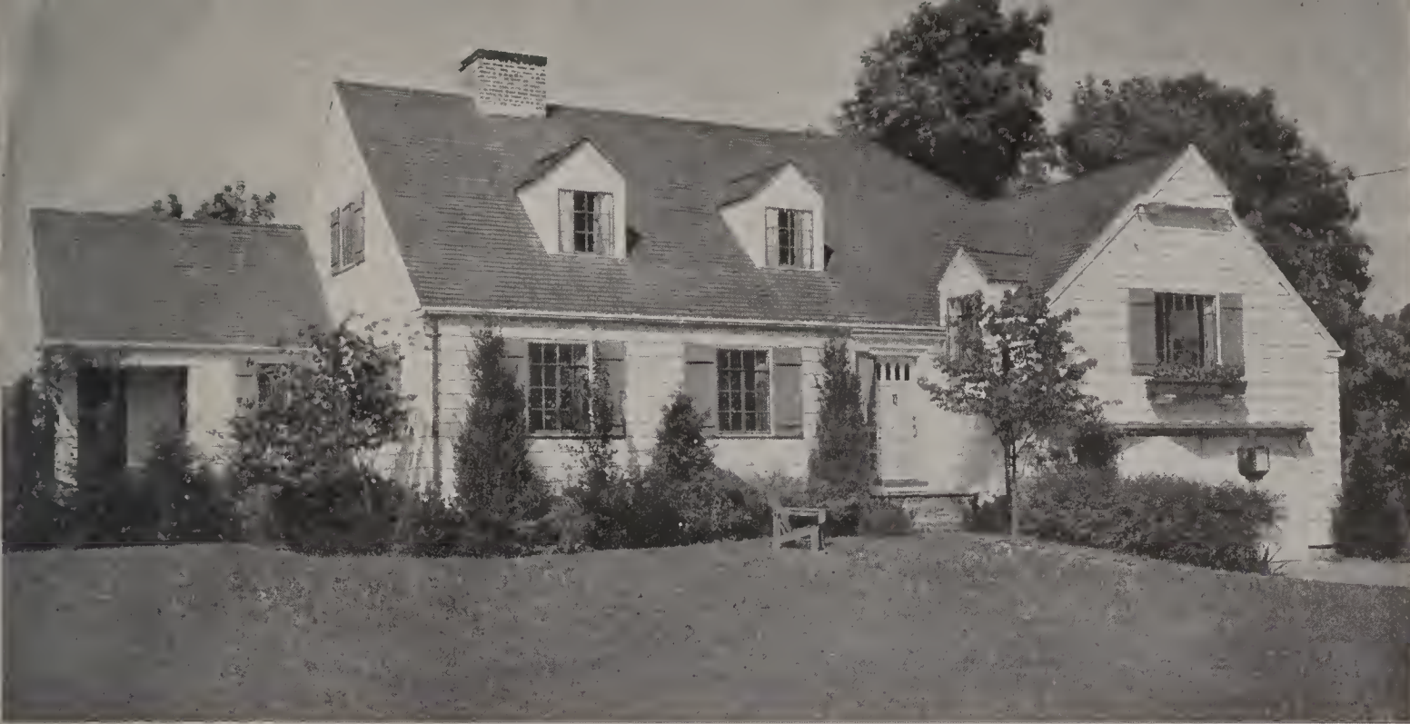
Evergreens combined with flowering trees form a simple but effective foundation planting