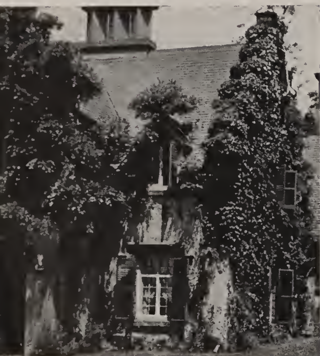
The vine covered home of Washington Irving