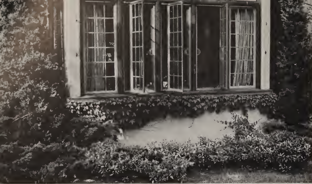
A fine window planting with area-way hidden by planting