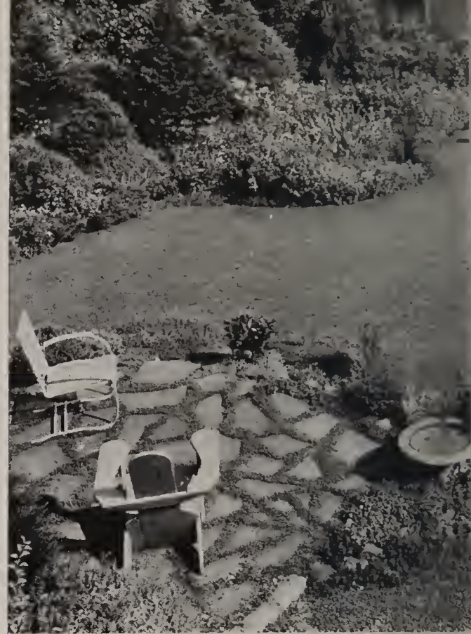
In planning an outdoor living room the lit and beaut

LILY-OF-THE-VALLEY. Tolerance of shade and its fragrant white flowers make this old-timer indispensable in the garden. Large, field-grown clumps.