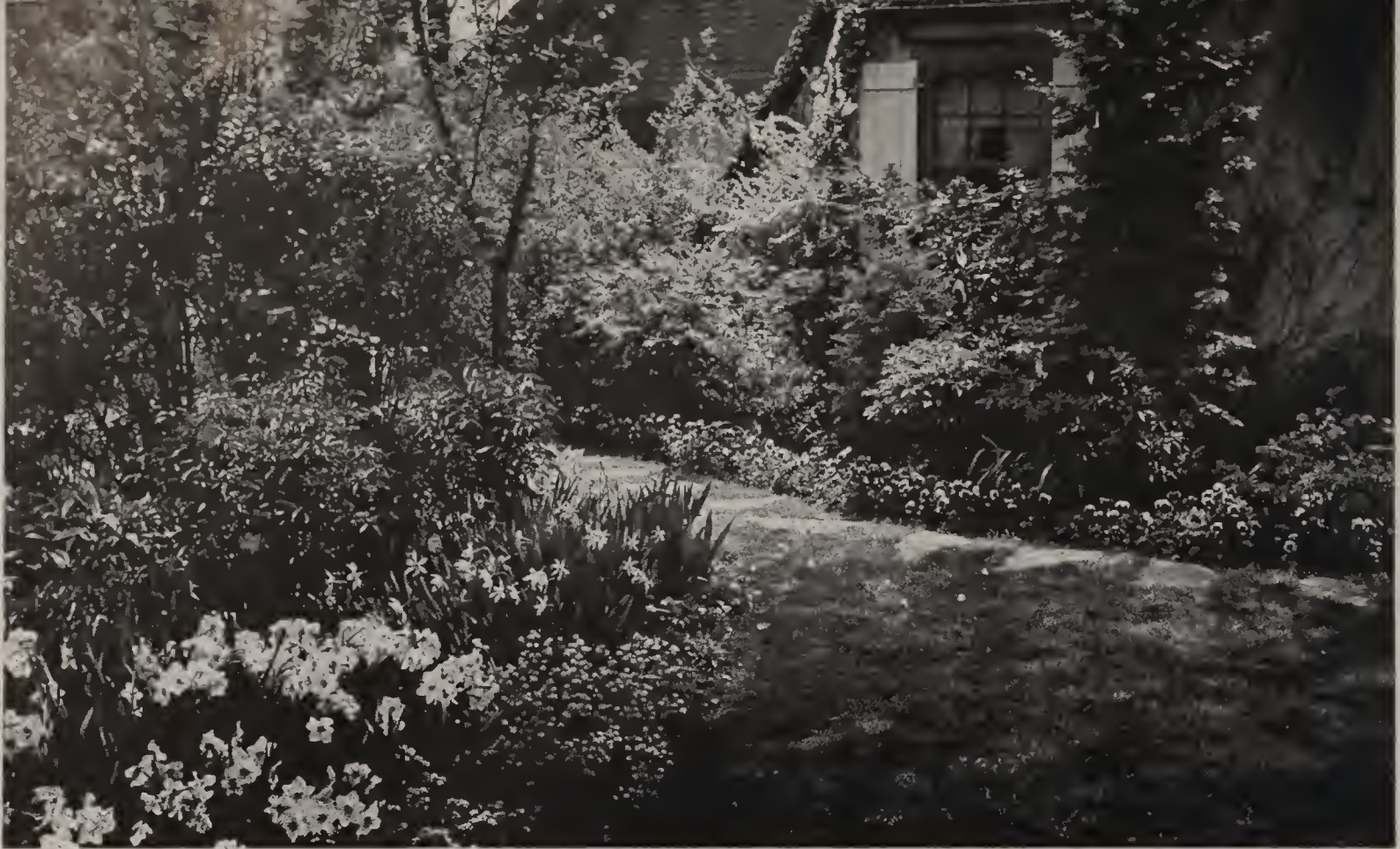
Flowering shrubs in your foundation planting soften the ground lines of your house