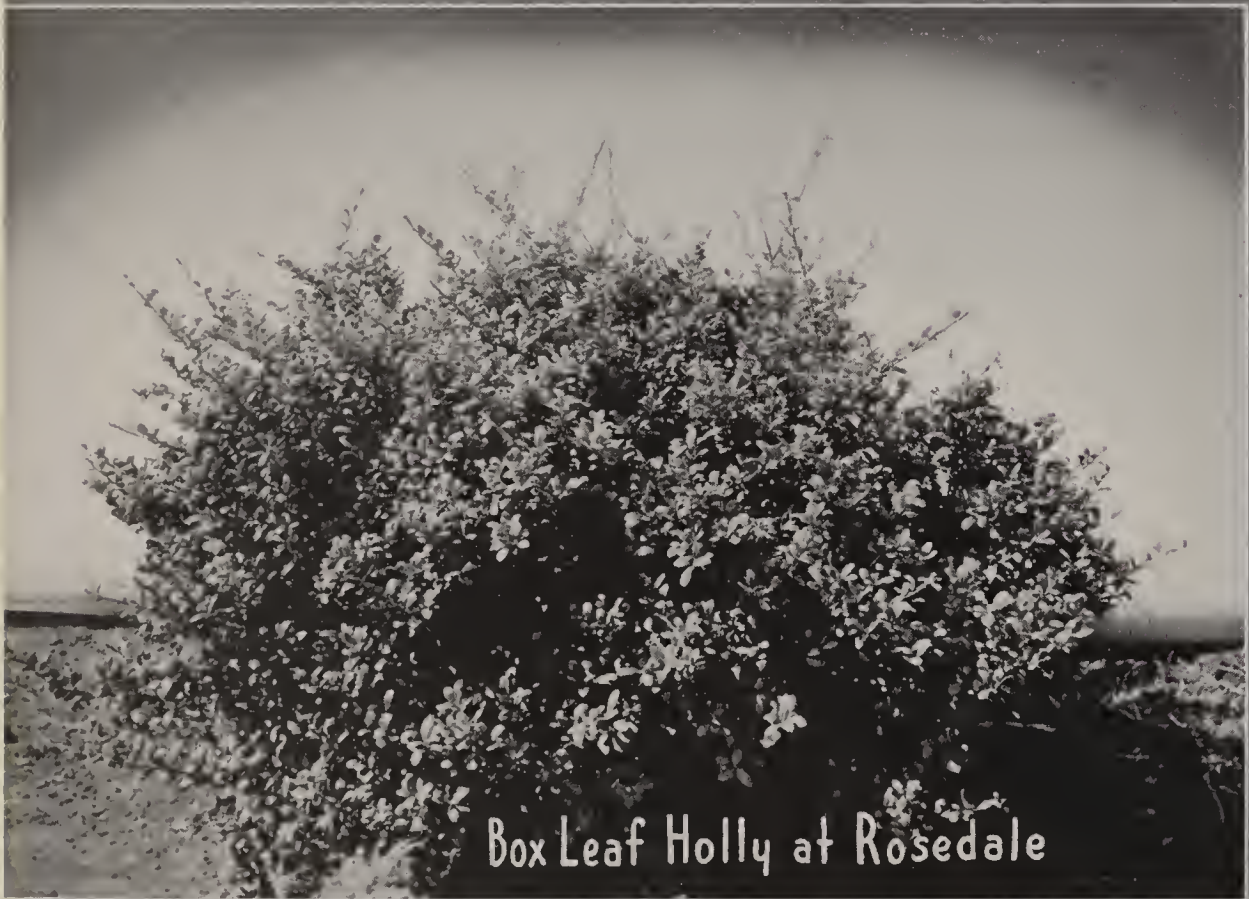
Box Leaf Holly at Rosedale