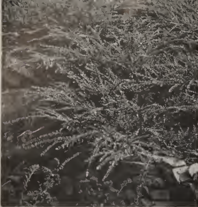
Cotoneaster (See page 3)