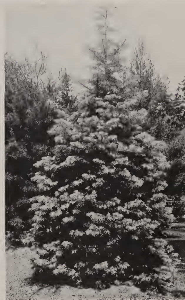
Abies concolor—White Fir