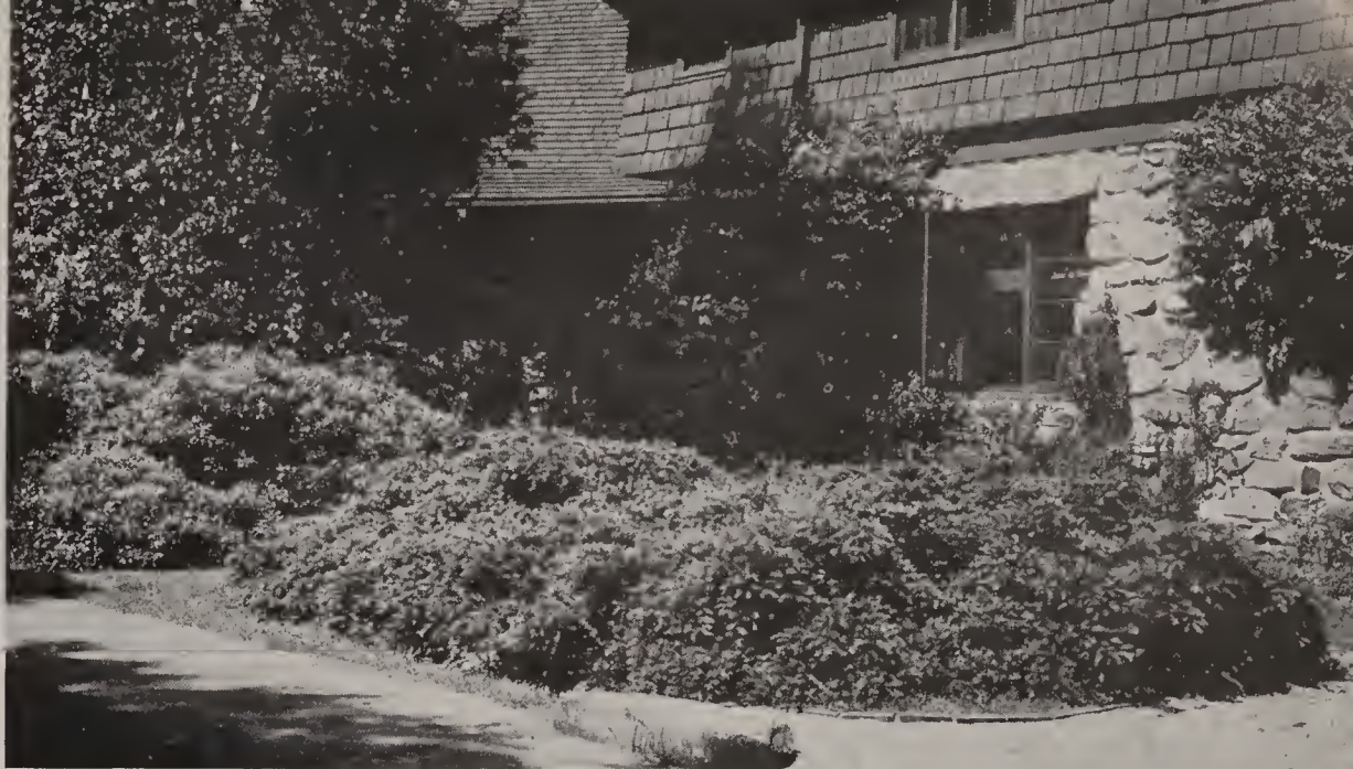
A mass grouping of Taxus