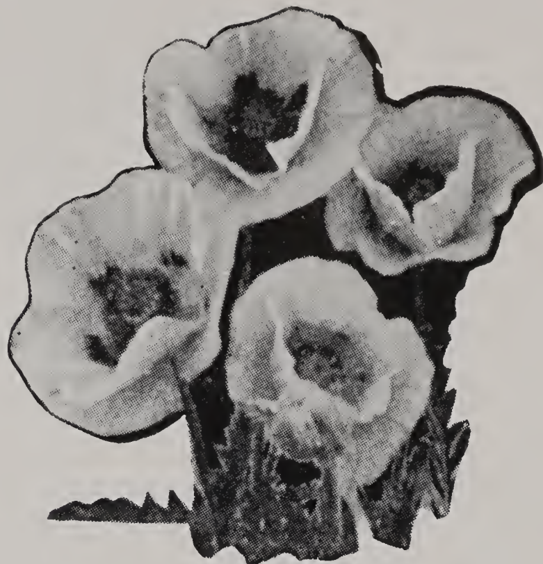
Pink Oriental Poppy

Barbatus Torreyi —2 ft. Spikes of bright scarlet red bell shaped flowers from June to August. An excellent cut flower to arrange with delphinium. Each 25 cents.