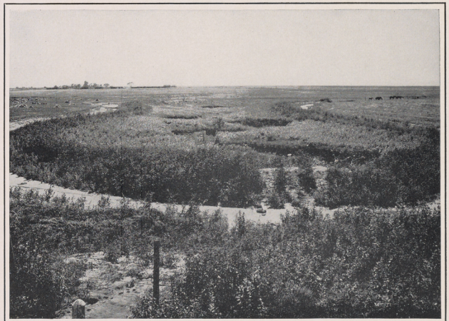
Protected by diversion ditch and a fence, the same gully a year later is controlled and producing a good wildlife food supply.