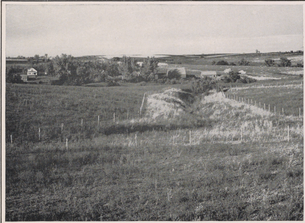
Gully stabilized by natural growth of grasses which provide nesting cover for quail and similar wildlife species.