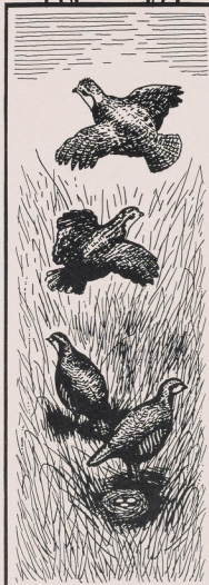
Chart No. 9