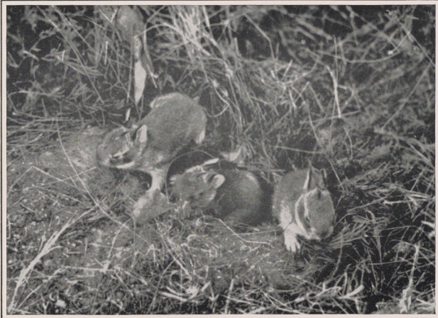
Young cottontail rabbits form a nest in the weeds and grass cover on a field retired from cultivation because of severe erosion.

Wildlife is the one crop which nature everywhere strives to produce. Since the harvesting of surplus wildlife does not remove any of the vegetative cover—as does the harvesting of cultivated, meadow, pasture, or timber crops—areas devoted to this use are permanently stabilized. More valuable adjacent lands thereby are protected.