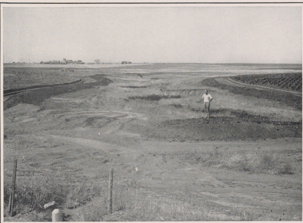
An active gully on a site too unstable to be cultivated or pastured. (See picture opposite.)