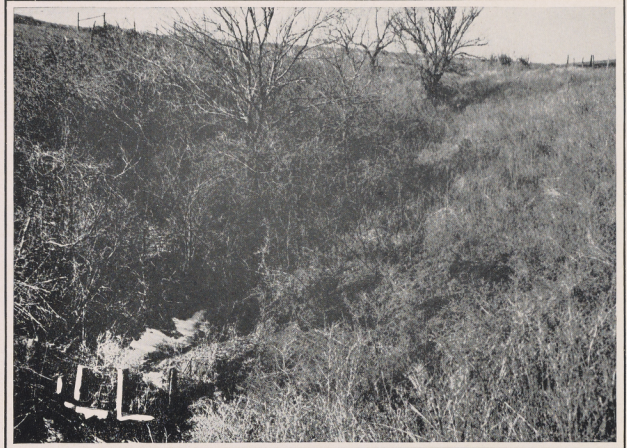
Natural growth of brush and small check dam have stabilized this gully. The vegetation provides good escape cover for a variety of small birds and fur animals.