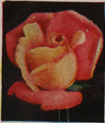
Pres. Herbert Hoover