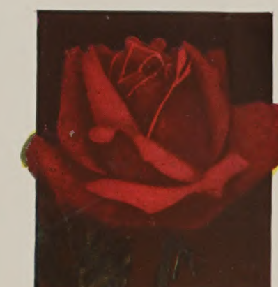
Etoile de Hollande