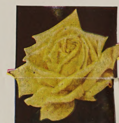
Souv. de Clodius Pernet