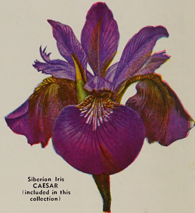
Siberian Iris CAESAR (included in this collection)

For a complete list of all of the Finest Siberian Iris see pages 30 and 31 of my general catalogue.