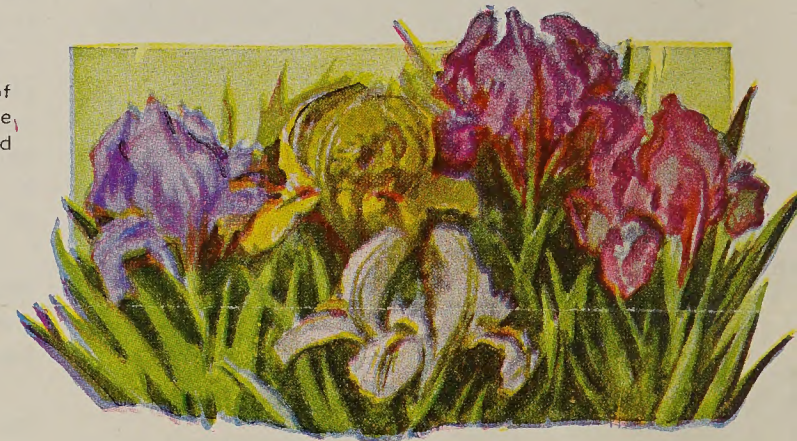
Miniature Bearded Iris

For a complete list of these Miniature Gems see, page 26 of my Iris and Peony Catalogue.