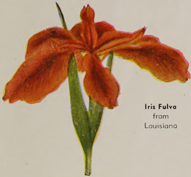
Iris Fulva from Louisiana

Y OUR birthstone: A faceted-gem that has emerged from an earthbound prison to mark your natal month. Precious jewels from the Treasure House of Mother Nature, cut, polished and mounted by the hands of man, to bring romance and sentiment and good-fortune in their sparkling loveliness. A birthstone for every month in the year in the realm of precious stones.