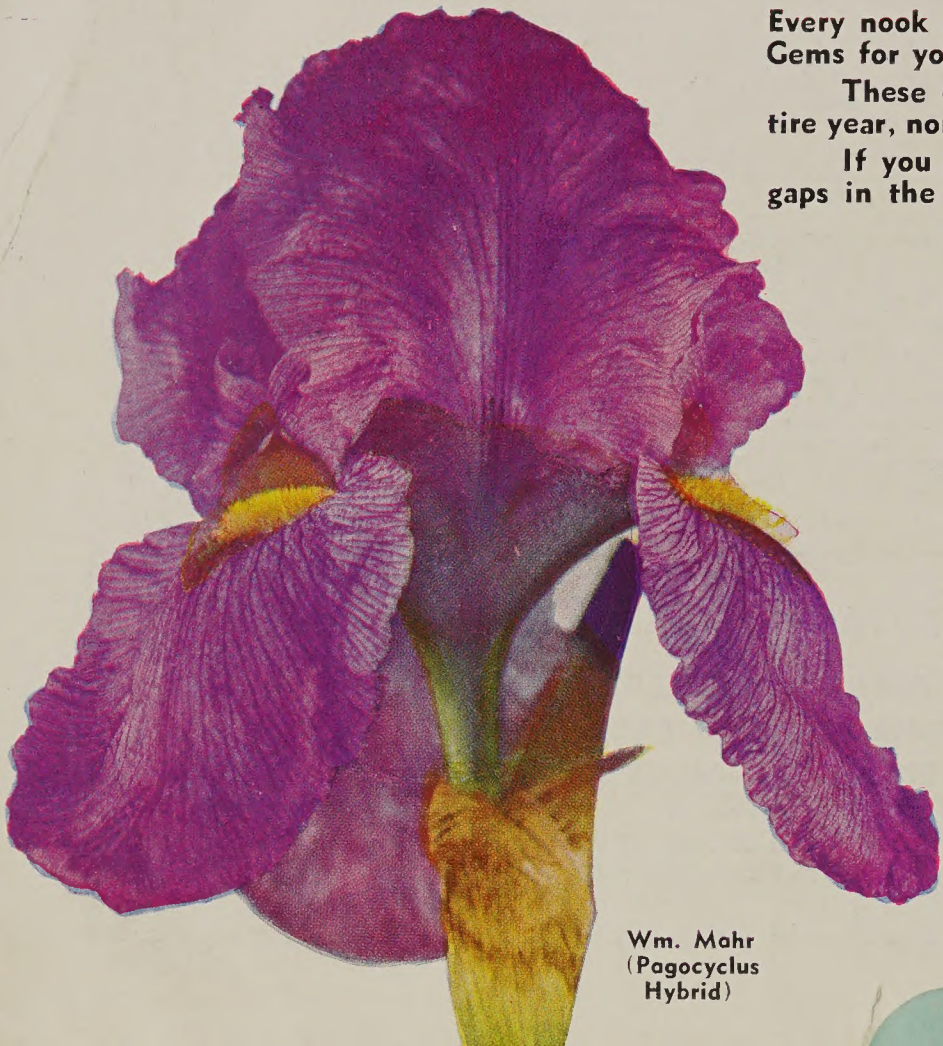
Wm. Mahr (Pagocyclus Hybrid)

If you do not wish all these collections, you may select the groups that will fill in the gaps in the flowering season in your garden.