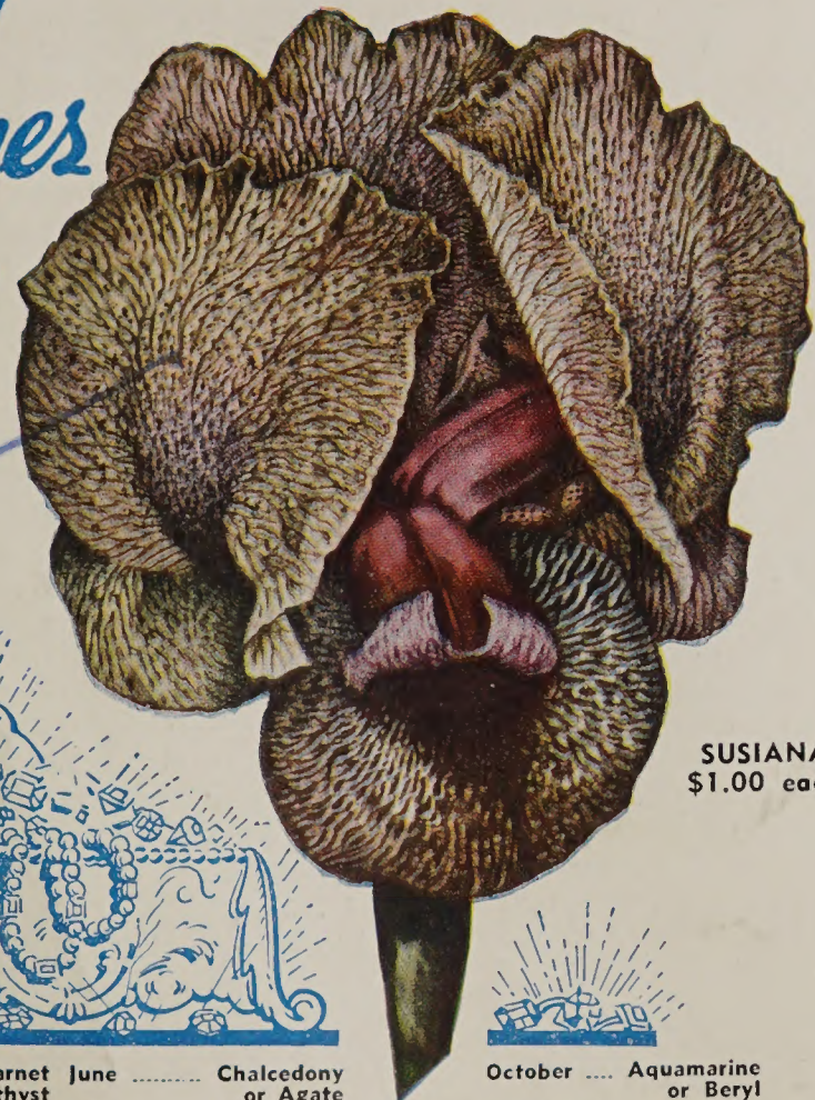
SUSIANA $1.00 each