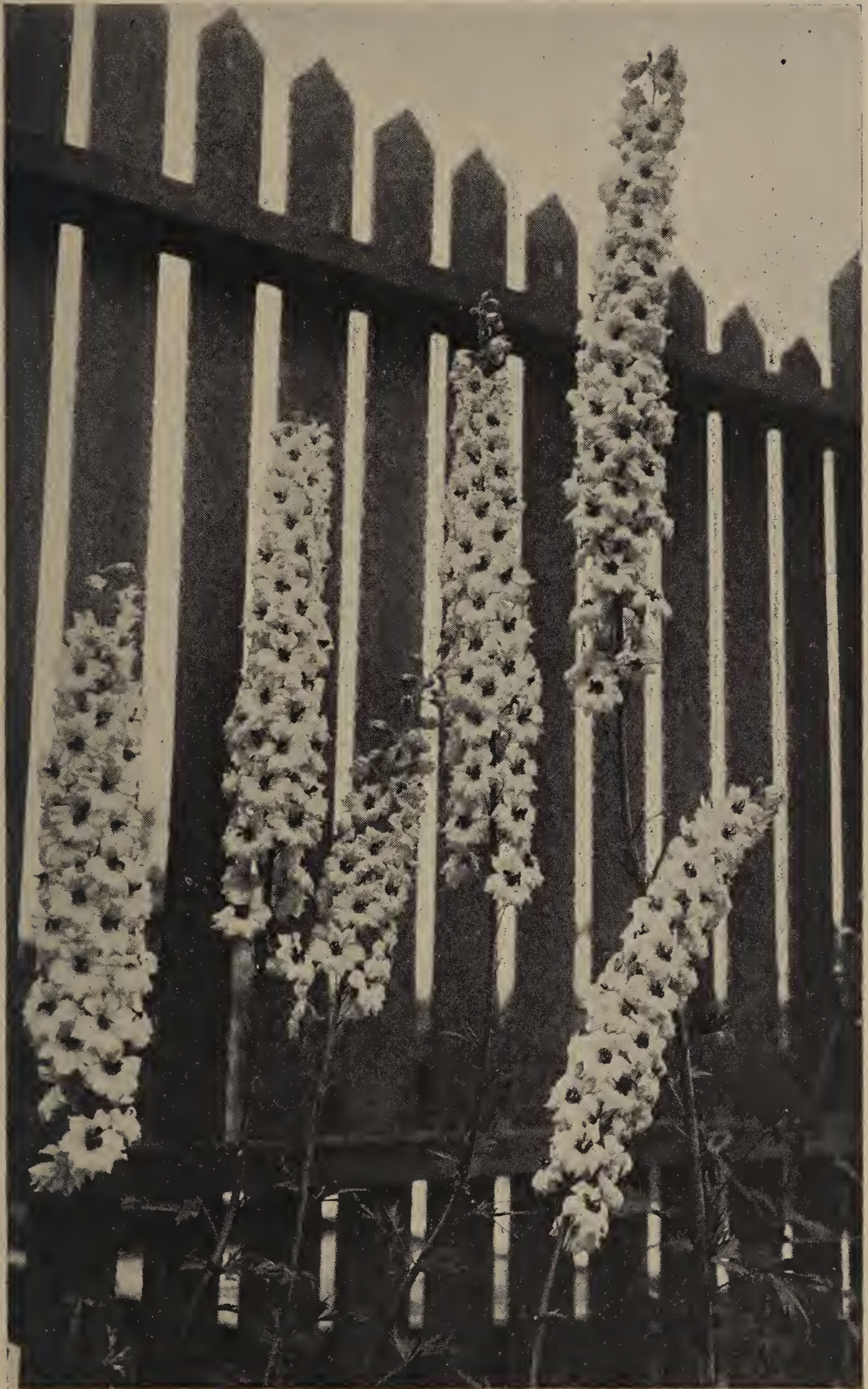
HOODACRES WHITE, VELVABEE Vaulting an Eight-Foot Fence.