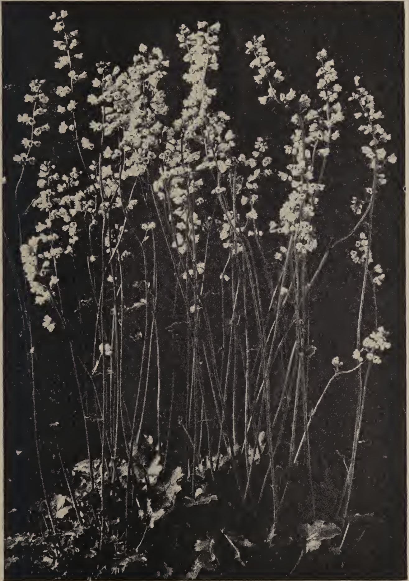
Hoodacres Hybrid Heuchera

HEUCHERA SEEDLINGS: Varying shades, mostly corals, $2.00 per dozen, 6 for $1.25, 100 for $12.50.