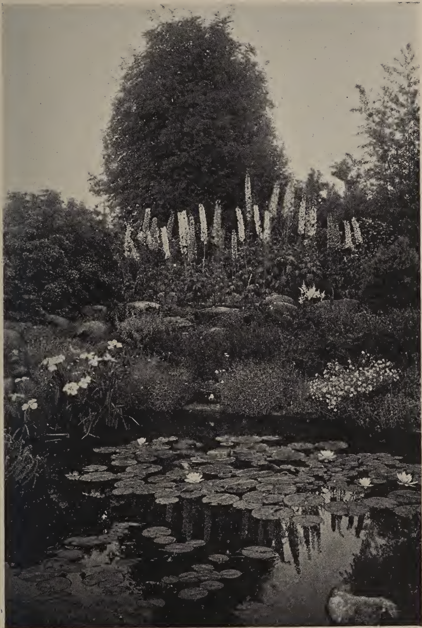
A section of sunken Alpine Garden and Pool at Hoodacres.