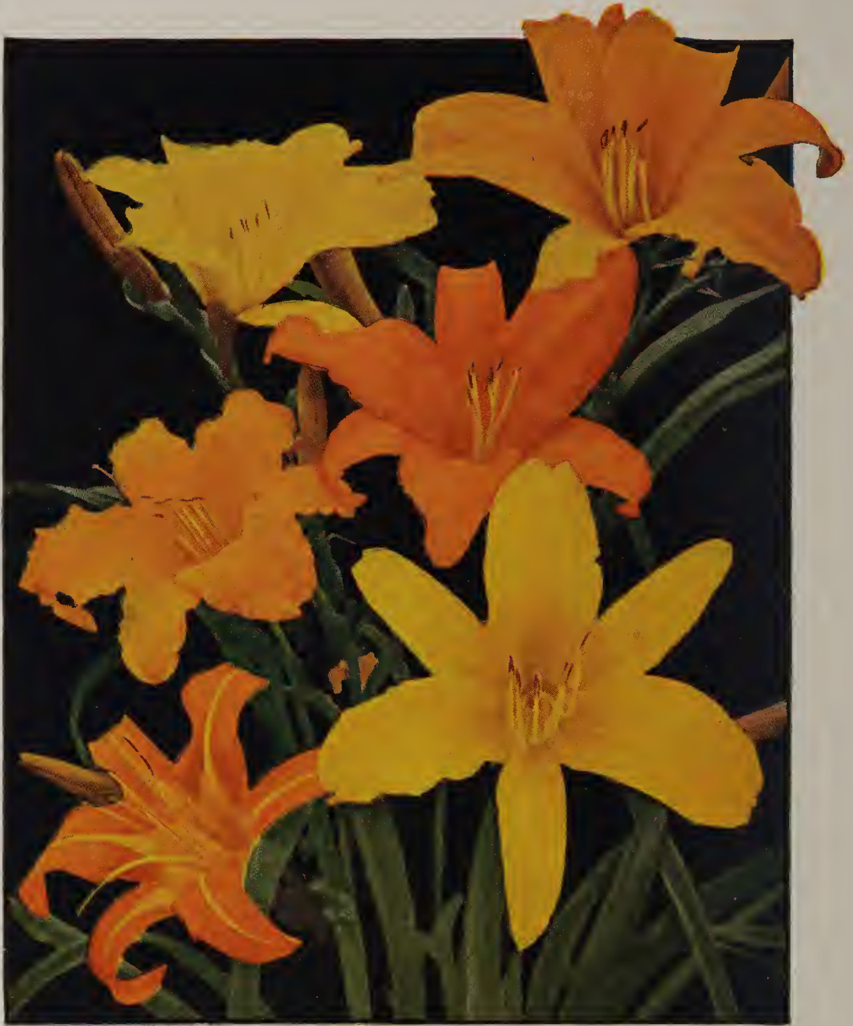
SOME HEMEROCALLIS TYPES