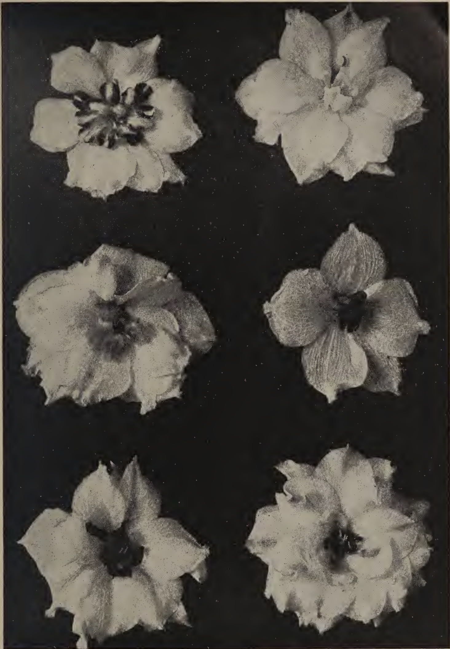
The HOODACRES WHITE varieties represented above are, in order of placement: VIKING, PEARL NECKLACE, ANGEL'S BREATH, VESTA, VELVABEE and a many-petaled specimen.