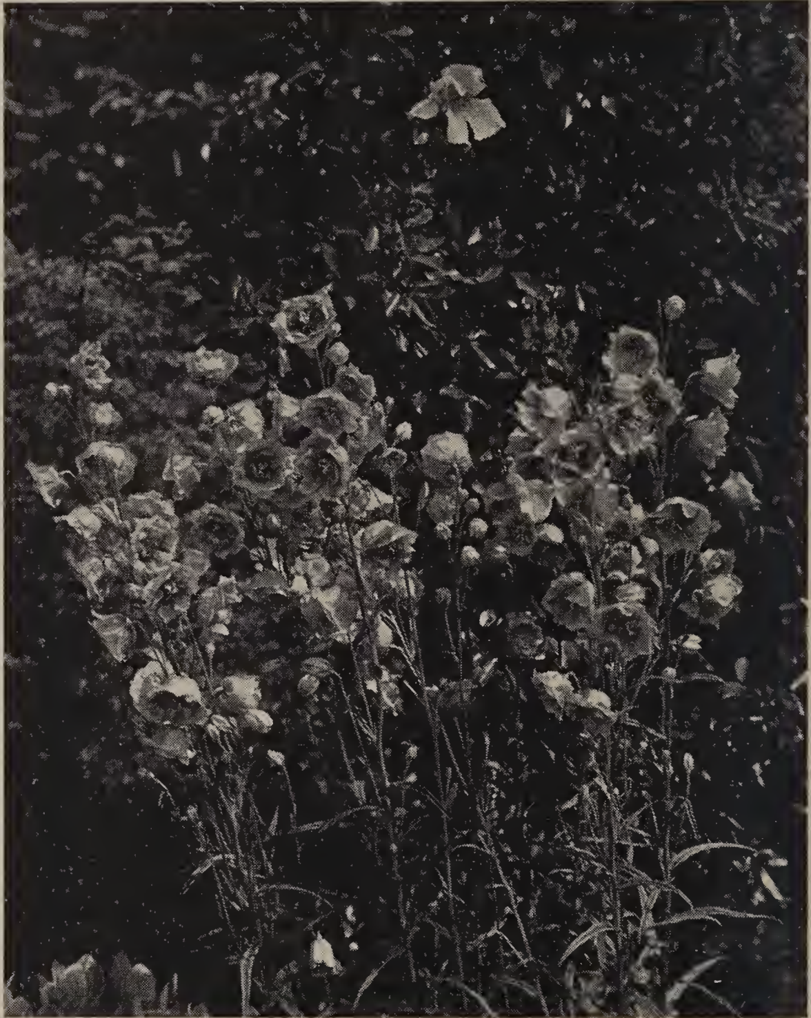
BEAUTY BELLS, the large double peach-bells.