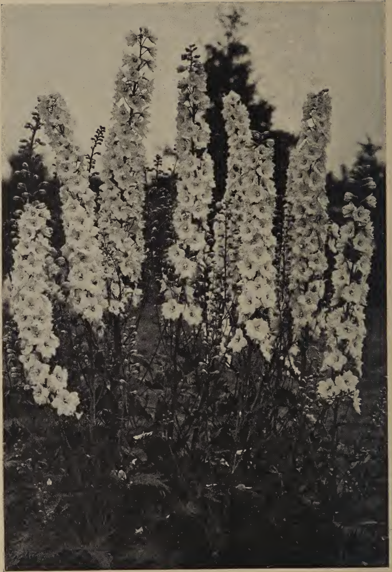
SHIPS MAST, Hoodacres White, one plant.