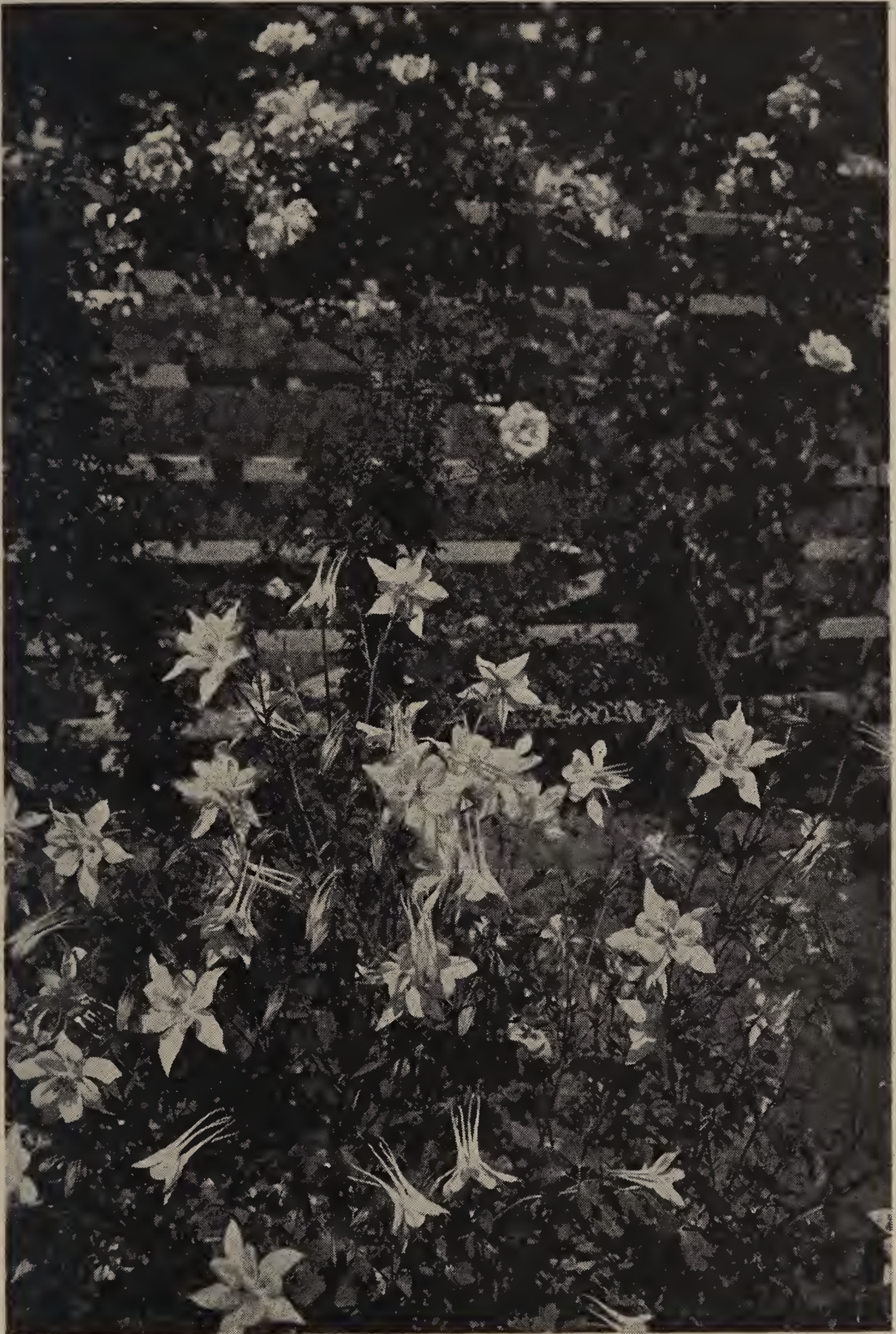
Individual plant of Hoodacres Aquilegia . Typical for size of blossom and length of spur.