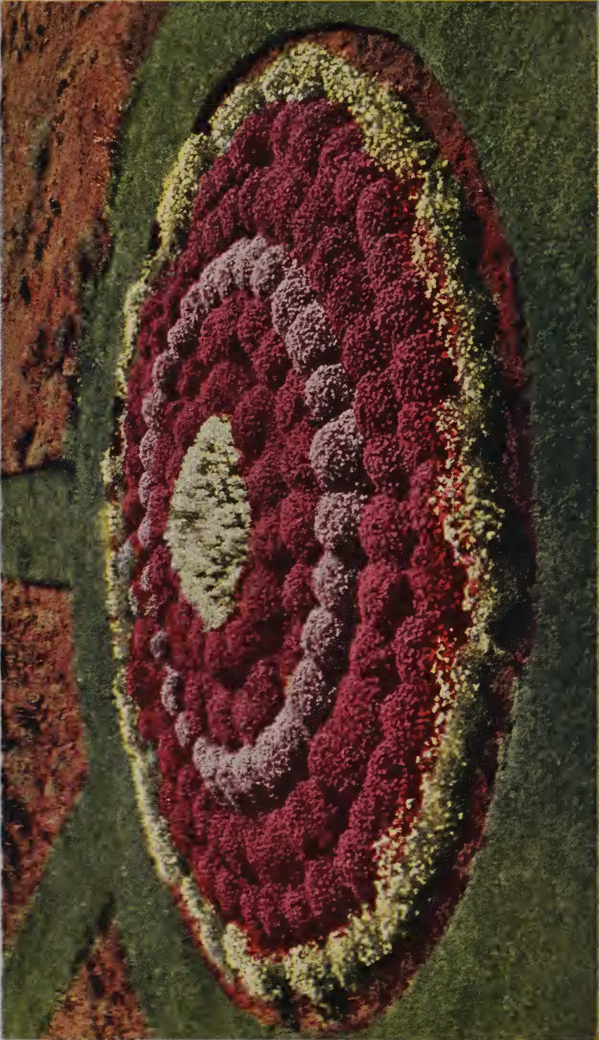
Hoodacres large-flowered Aubrietias. Bloom a long period in spring.