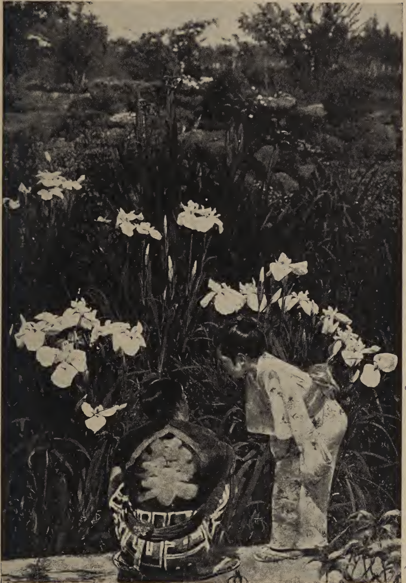
Our Visitors from Japan