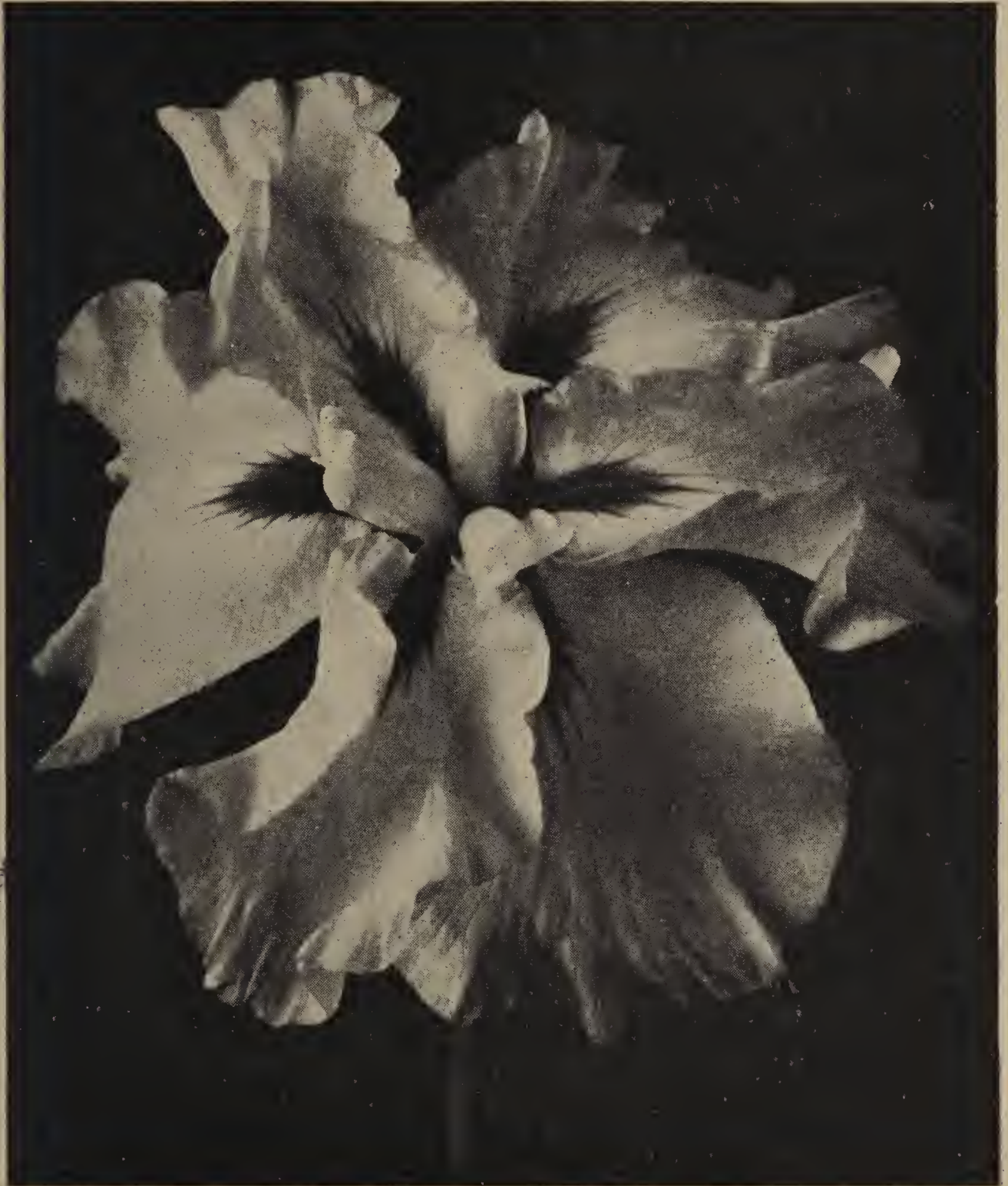
A Hoodacres Achievement: FUJISAN

Bounty Collection: In addition to above we are growing many varieties ranging from 50c to $1.00 each, of which we have insufficient stock to list. These together with surplus of our regular kinds we are including in this collection, well balanced for color. $2.50 for 10. Delivered.