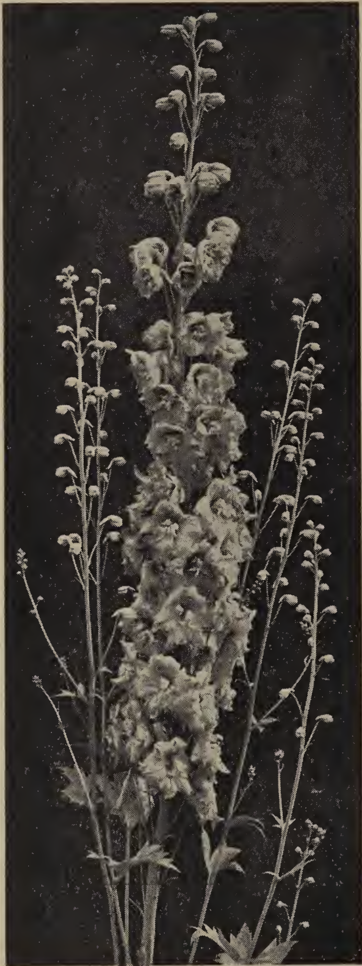
PINK RAPTURE. Seeds only 1939.