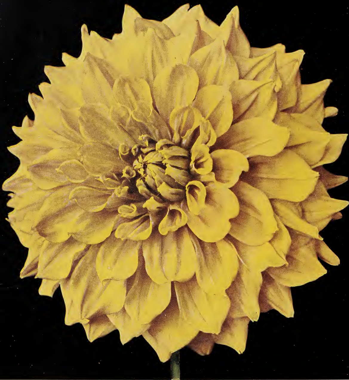
Decorative Dahlia "Champagne"