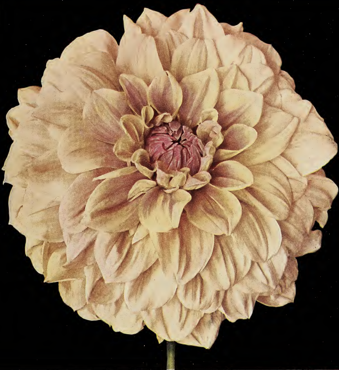
Decorative Dahlia "El Dorado"