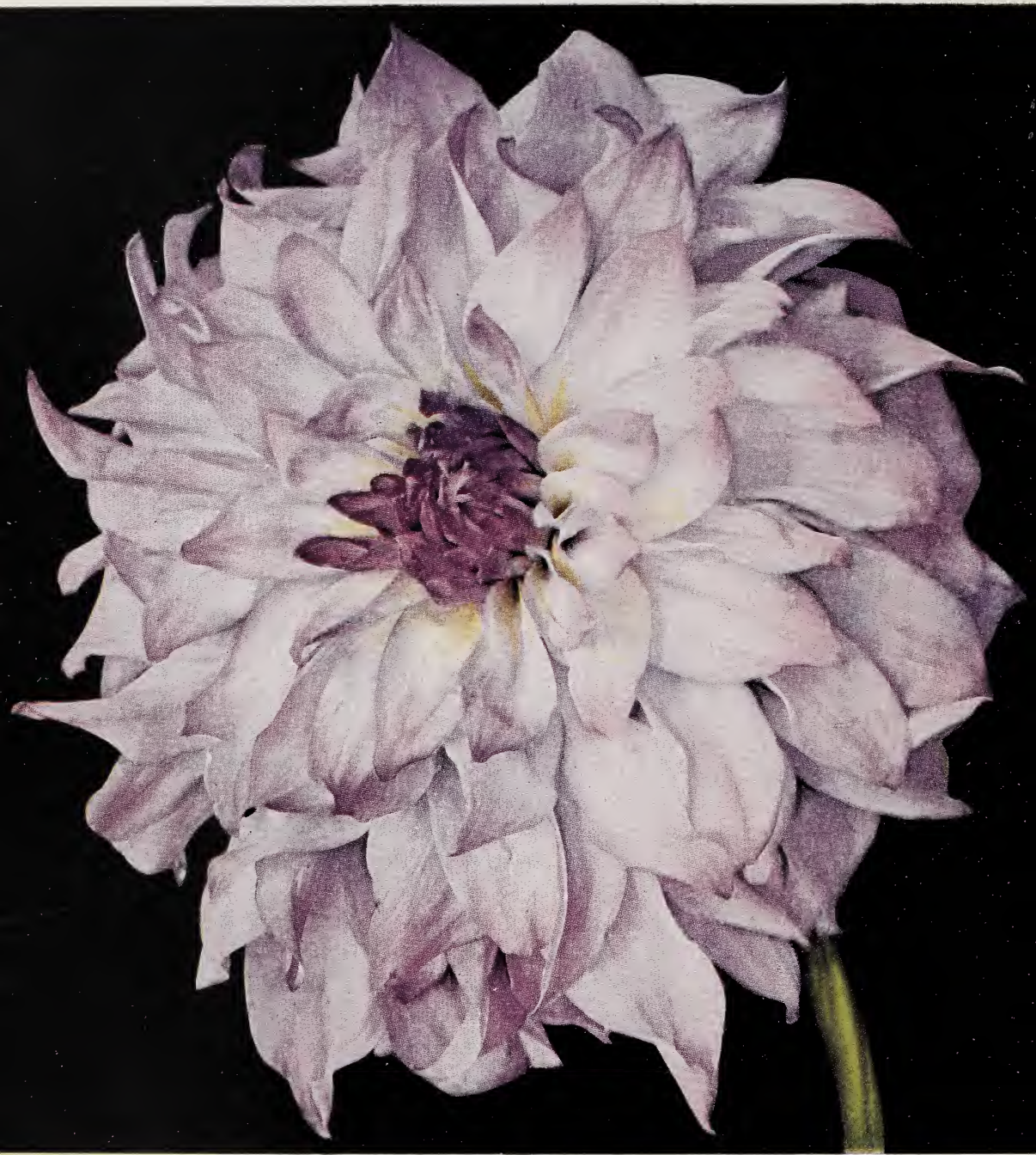
Decorative Dahlia "Shudow's Lavender"