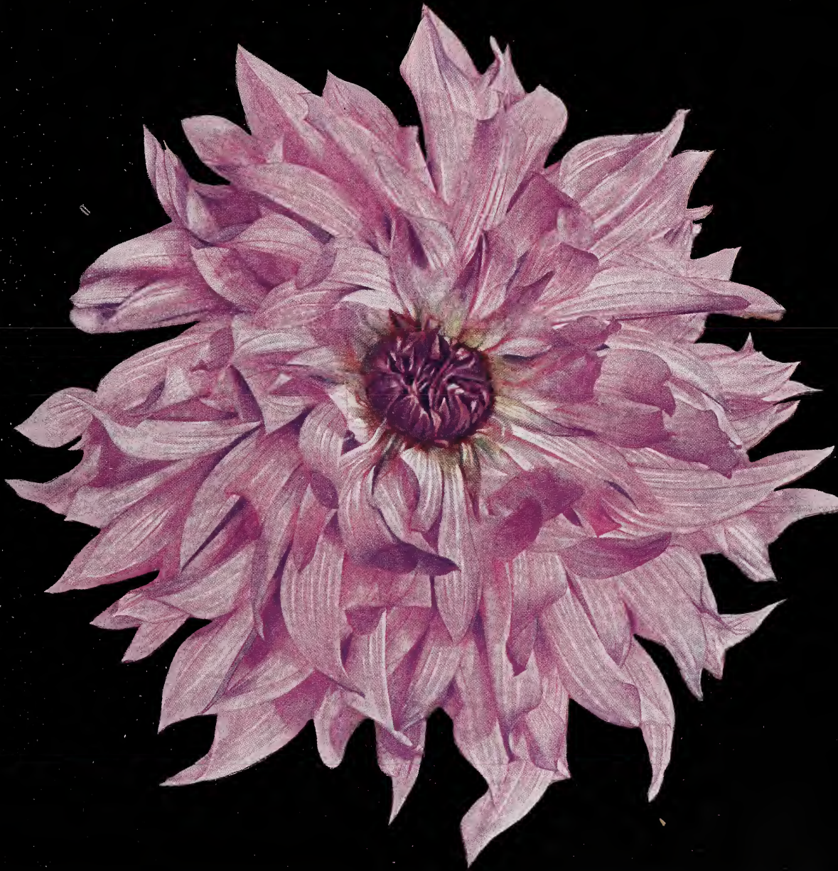
Hybrid Cactus Dahlia "Mariposa"