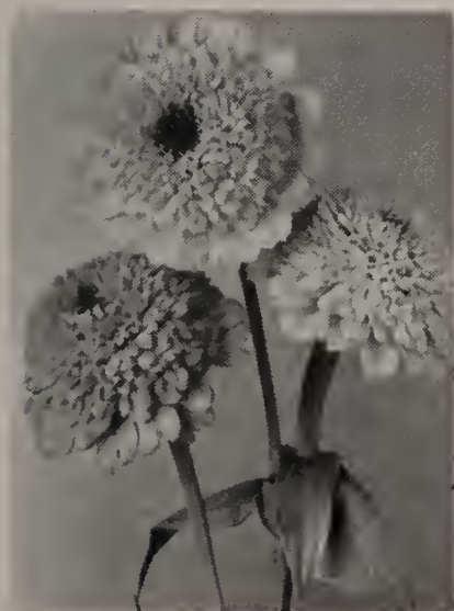
Scabious Flowered Zinnia

Linearis —Single flowers a lovely shade of golden orange with a delicate lemon yellow stripe through each petal, while the center is dark brown in the young flowers turning golden orange as the pollen develops. Pkt. 20c, 1/8 oz. 60c.