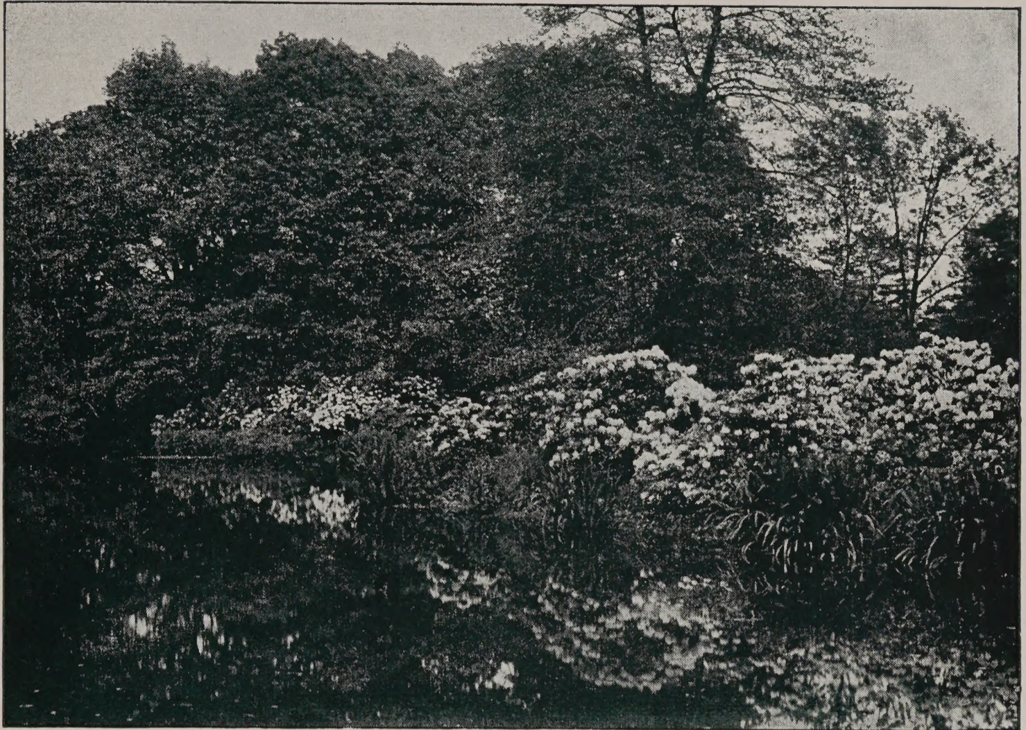
A FINE EXAMPLE OF THE EFFECT THAT CAN BE PRODUCED BY PLANTING RHODODENDRONS AT THE EDGE OF A POOL OR POND.