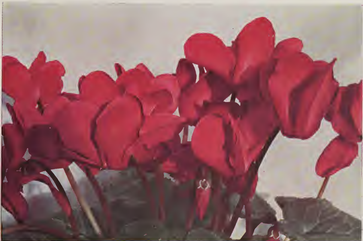
Binnewies' variety Nr. 1, Dark Blood Red.