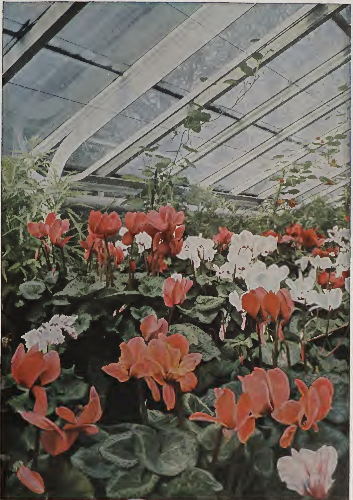
No, this is no Binnewies House. This picture is to show the difference between an average Cyclamen House and the perfectness of the Binnewies Cyclamen Houses on the other pages.