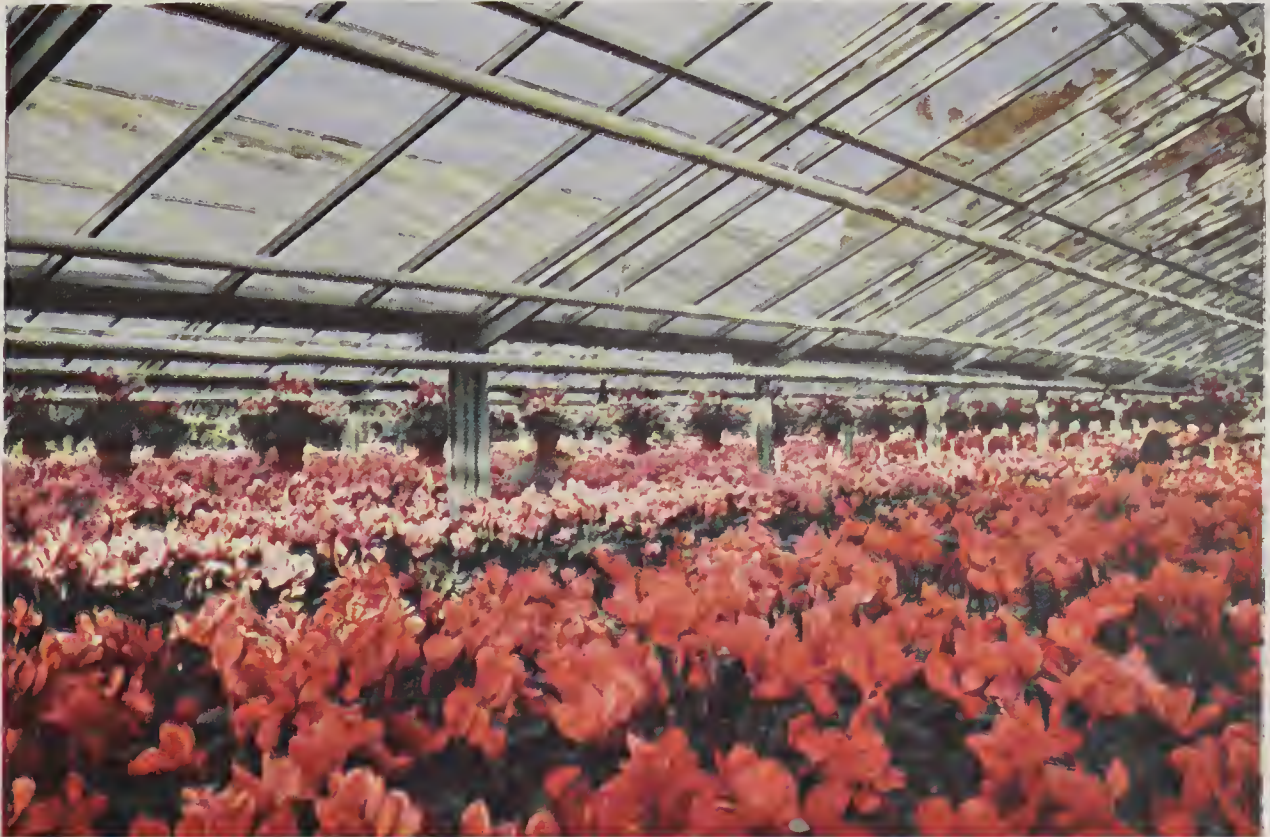
Binnewies' Modern Block-House with Salmon Shades.