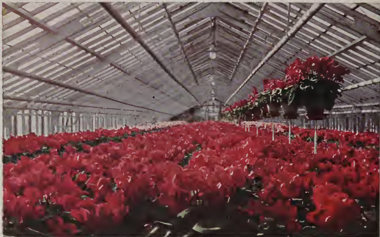
Binnewies' House with the variety Nr. 15, Saffron Red.