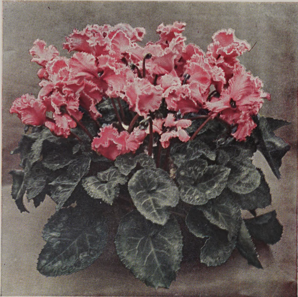
Flowers of the Binnewies' variety Nr. 20, New Ruffled, Carmine-rose.