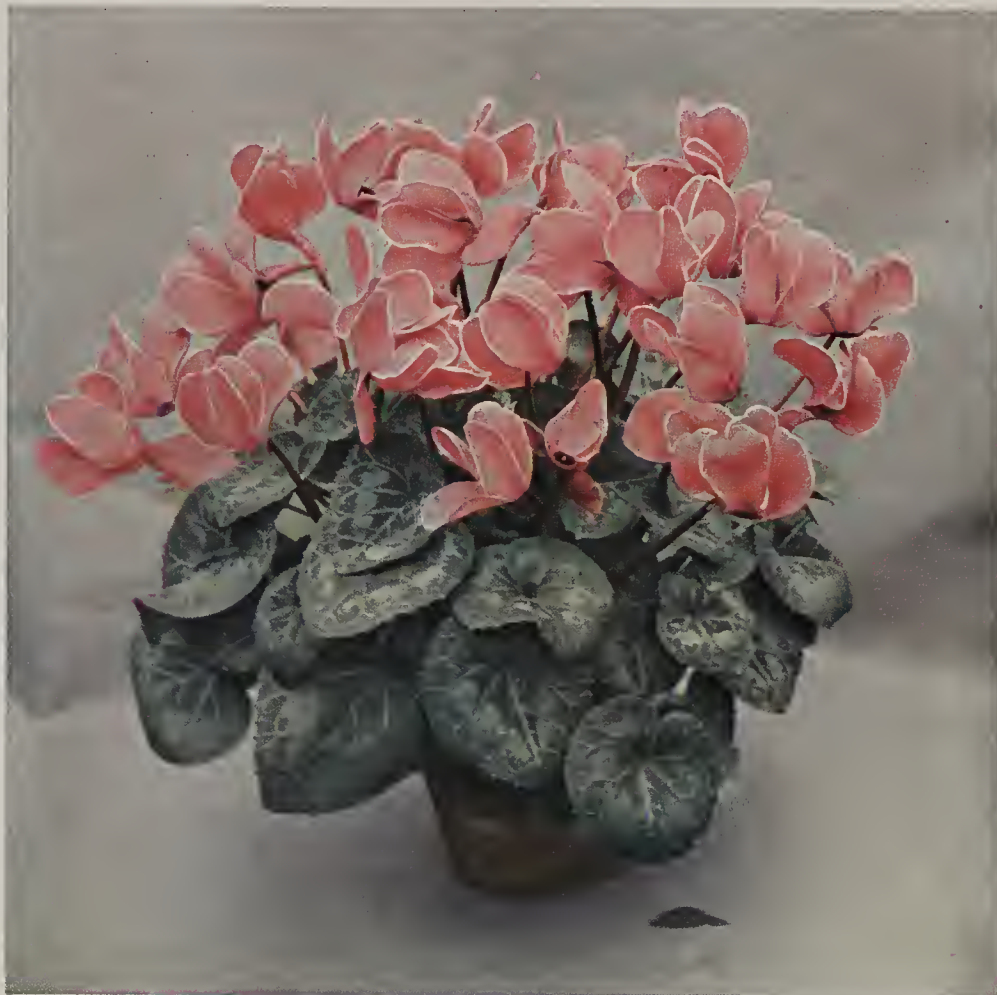
Binnewies' variety Nr. 16, Saffron, Red silver edged.