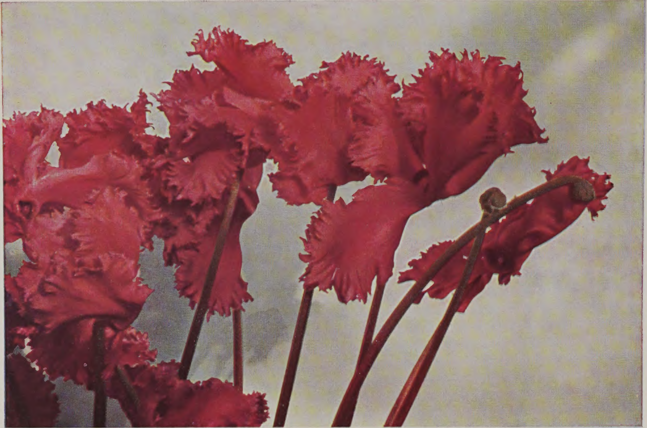
Flowers of the Binnewies' variety Nr. 20, New Ruffled, Dark red.