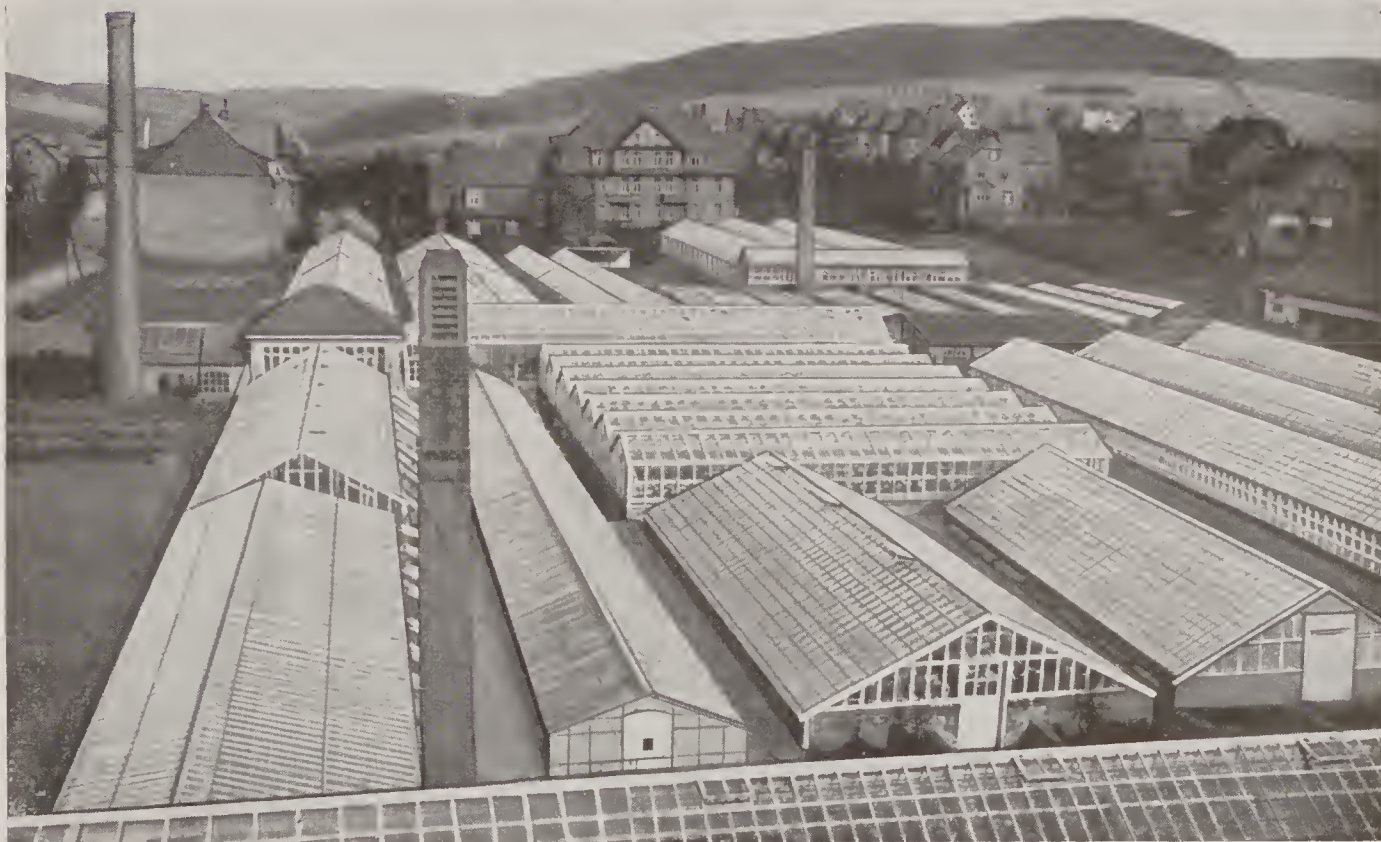
Partial view of Binnewies' place.