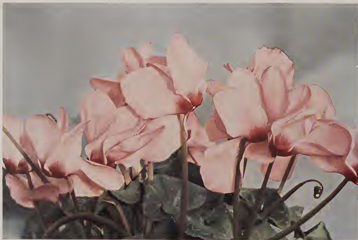
Binnewies' Salmon colour, light, No. 11.