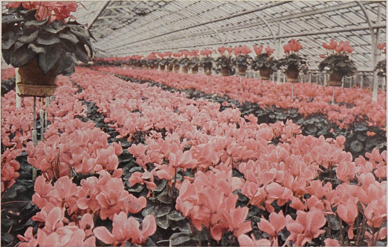
A Binnewies' House — measuring 100 x 15 yards — with the varieties Nr. 10 and 11 (Salmon Light and Salmon Dark)