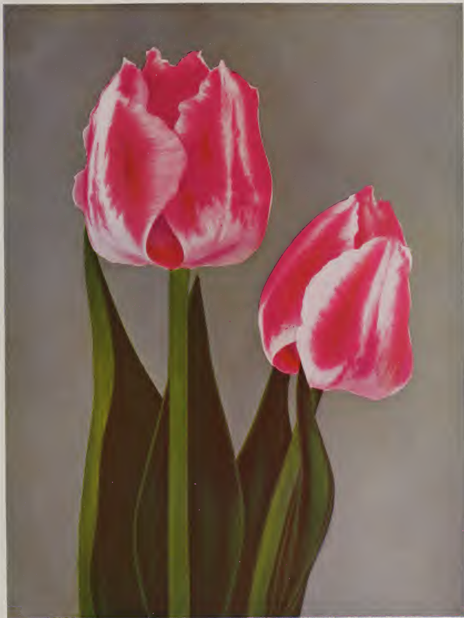
Single early Tulip „Flamingo”