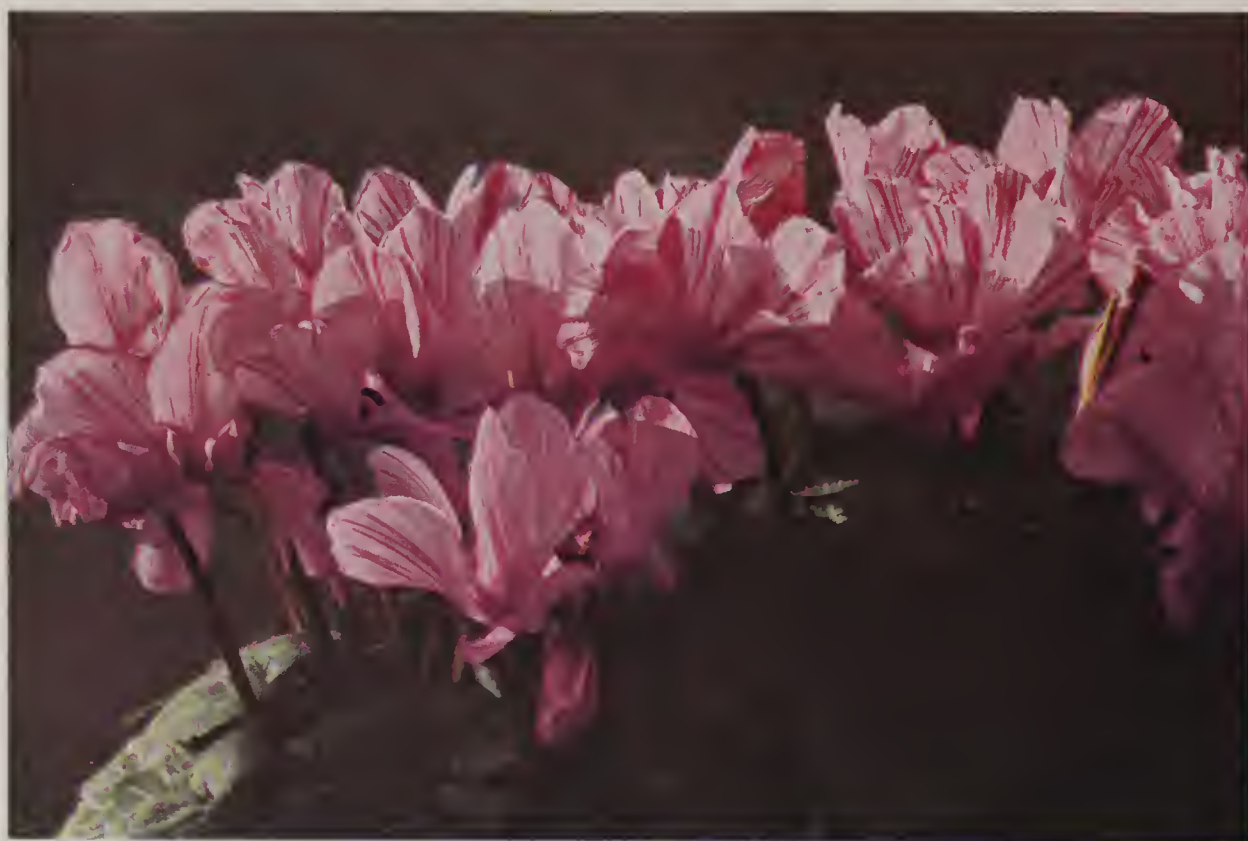
Binnewies' Type of the variety Striata, Nr. 17.