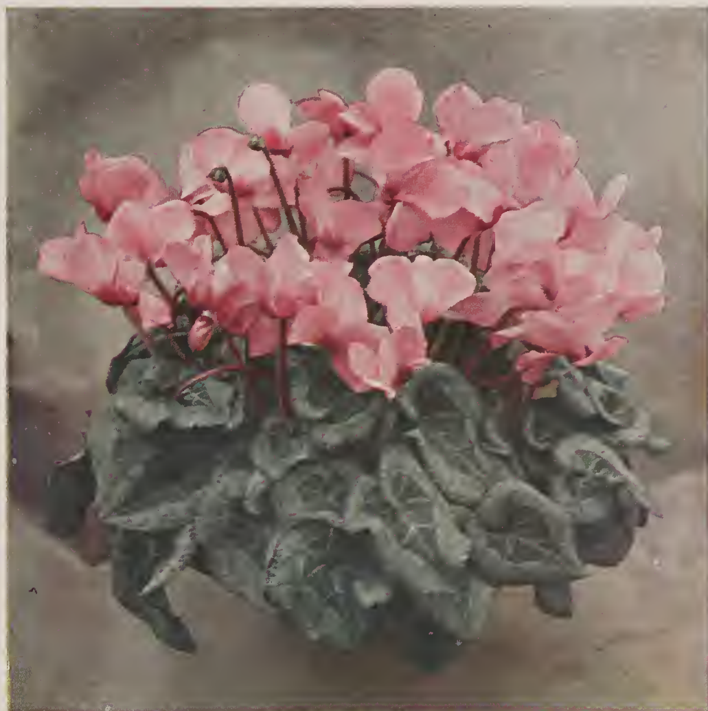
Binnewies' variety Nr. 22, Rose of Alfeld (salmon-red, especially for cutting).