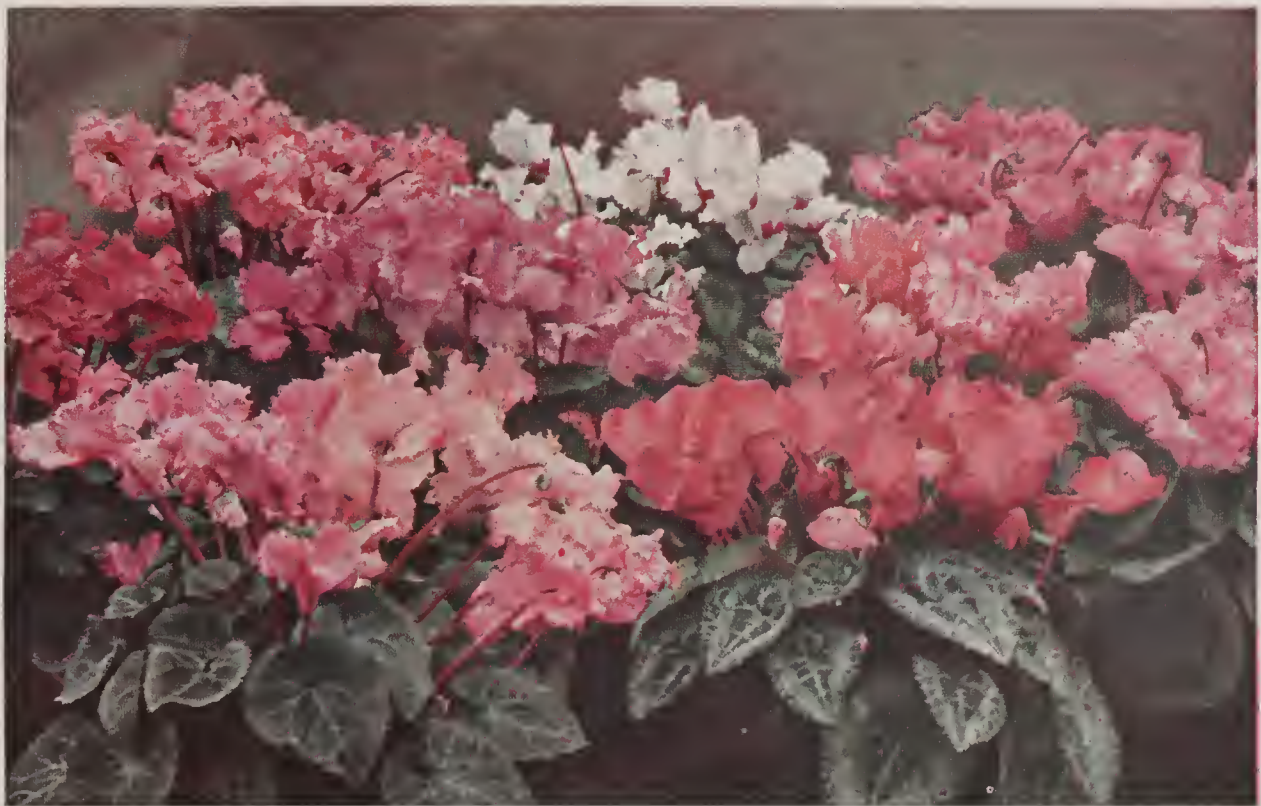
Different Ruffled types of Binnewies' strain.