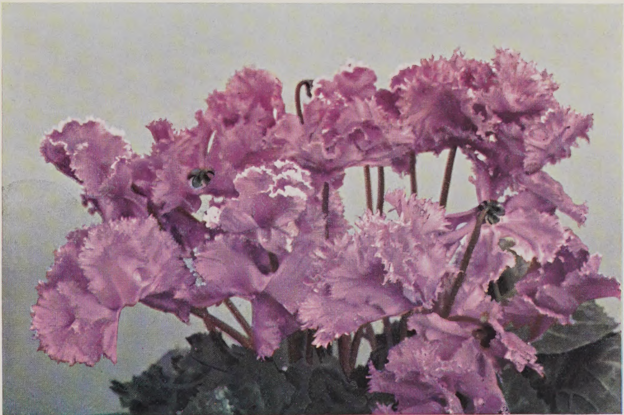
Flowers of the Binnewies' variety Nr. 13, Rokoko erecta.