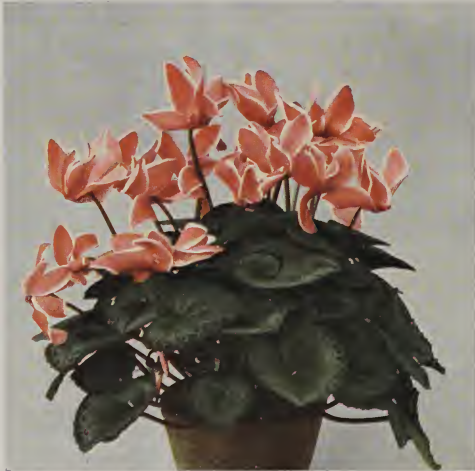
Binnewies' variety Nr. 23, Flamingo (only limited quantity available).