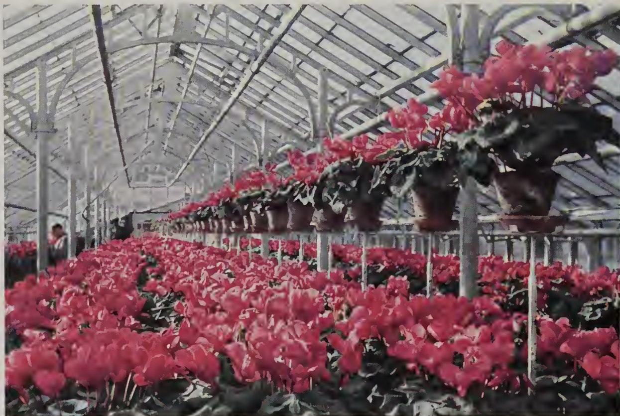
Binnewies' House with Bright Red Nr. 2.