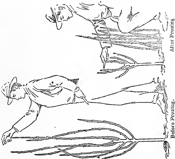
The Proper Way to Prune Two Year Old Fruit Trees

To protect trees from worms or borers, early each spring have the earth raised around the tree twelve or fifteen inches high, and remove same in fall. Trees should be mulched early every fall.