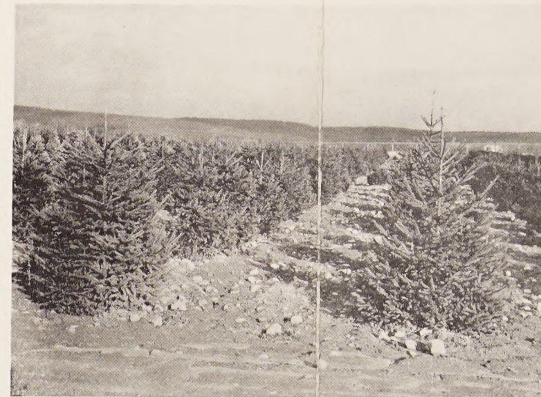
NORWAY SPRUCE PICEA EXCELSA 5-6', 6-7', 7-8', 8-10', 10-12'