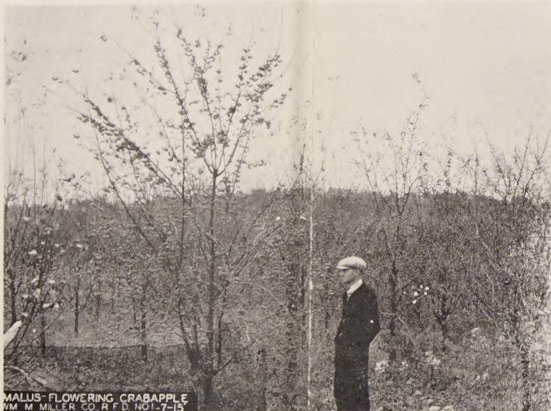
FLOWERING APPLE Malus Baccata, Malus Betel's, Malus Cerasifera Malus Floribunda, Malus Purpurea, Etc. 7-15'