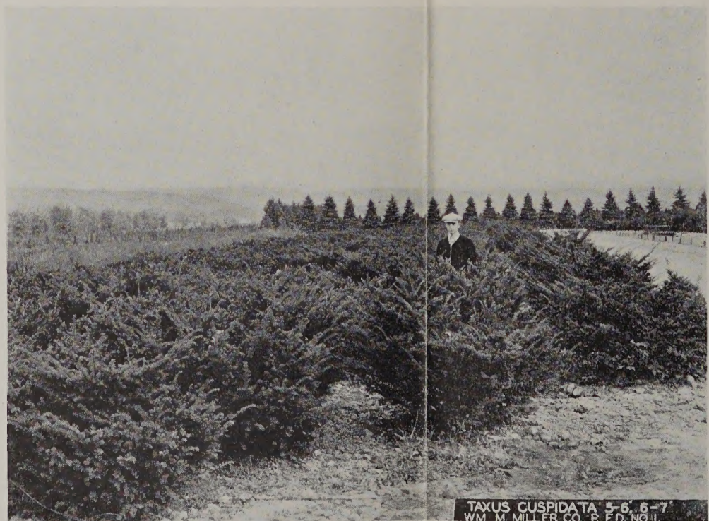
TAXUS CUSPIDATA 5-6', 6-7' WM. M. MILLER CO., R.F.D. NO. 1