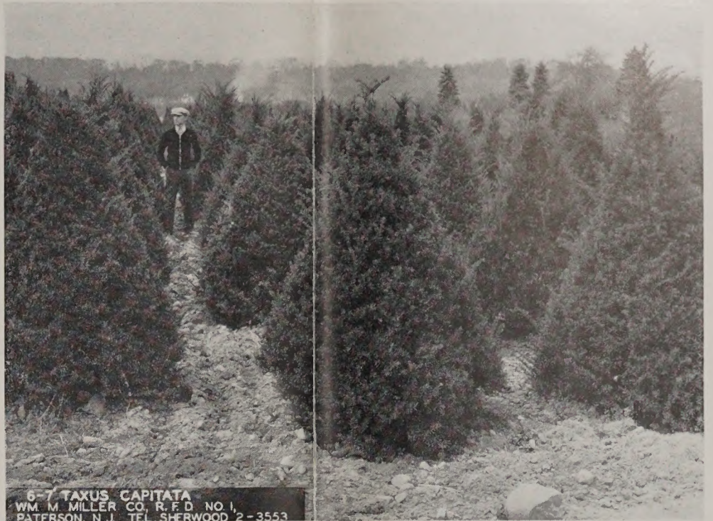
TAXUS CAPITATA 3-4', 4-5', 5-6', 6-7'