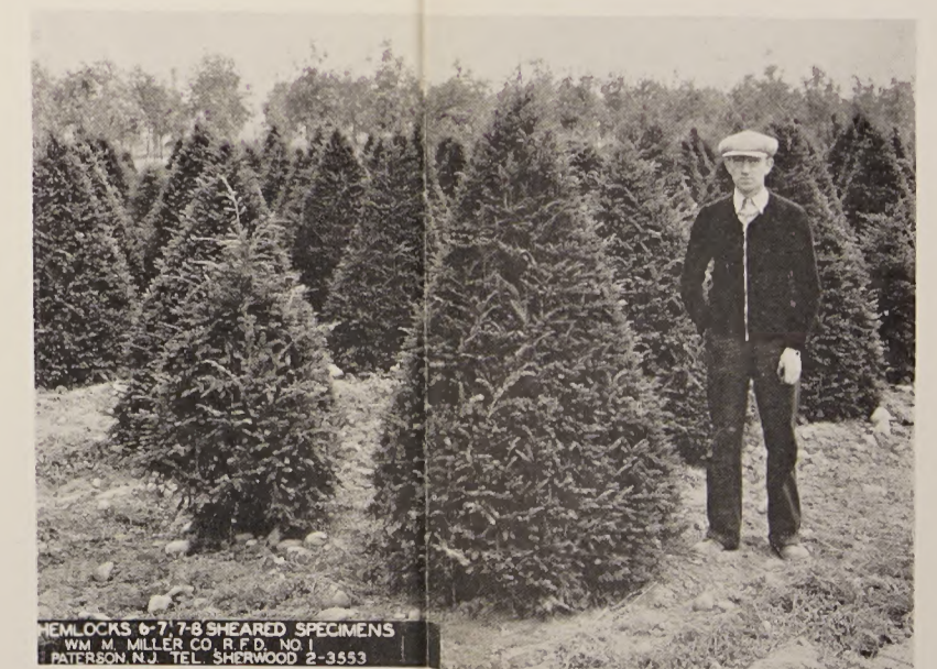
CANADIAN HEMLOCK TSUGA CANADENSIS 6-7', 7-8', 8-10'