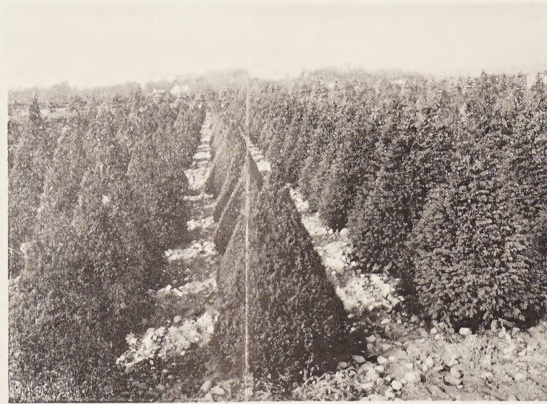
CYPRESS RETINOSPORA — All Varieties 3-4', 4-5', 5-6', 6-7', 7-8', 8-9', 9-10', 10-12'