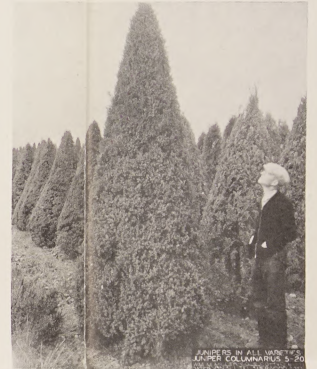
CLUMNAR CHINESE JUNIPER JUNIPER CHINENSIS COLUMNARIS 4-5', 5-6', 6-7', 7-8', 8-9', 9-10', 10-12', 12-14'