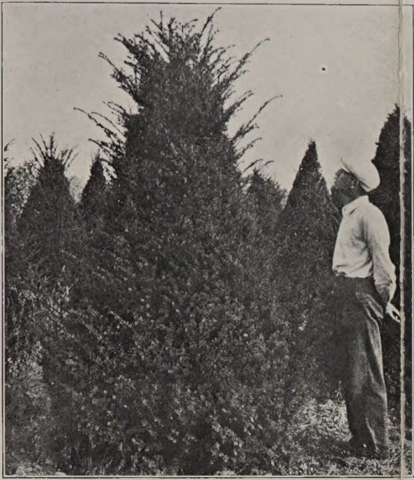
TAXUS CAPITATA 4-5', 5-6', 6-7', 7-8', 8-9'