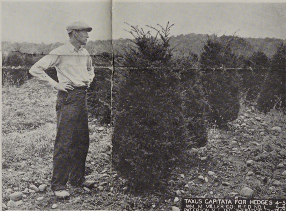
TAXUS CAPITATA For Hedges 4-5', 5-6', 6-7'