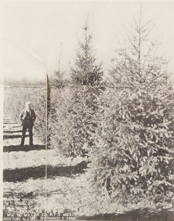
DOUGLAS FIR PSUEDOTSUGA DOUGLASI 6-7', 7-8', 8-10', 10-12', 12-14'