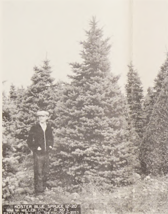
KOSTER BLUE SPRUCE PICEA PUNGENS GLAUCA KOSTERI 12-20'