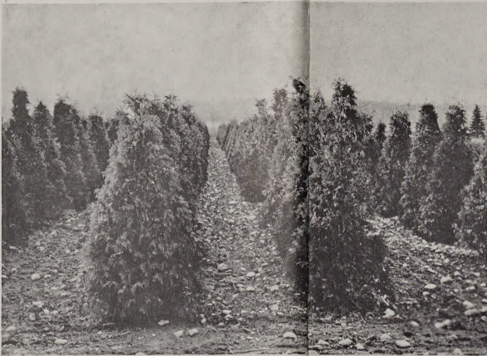
AMERICAN ARBORVITAE THUJA OCCIDENTALIS 3-4', 4-5', 5-6', 6-7', 7-8', 8-9', 9-10'