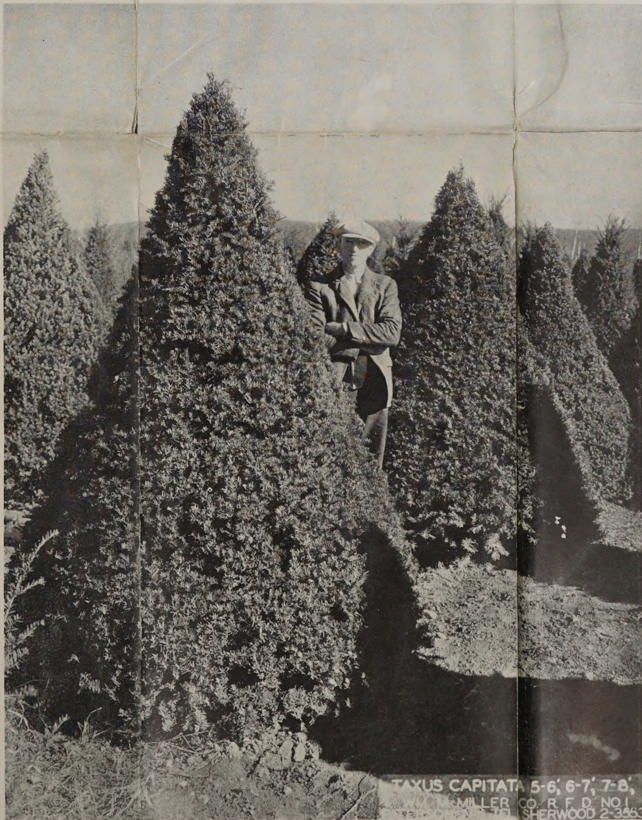
SHEARED COMPACT SPECIMENS