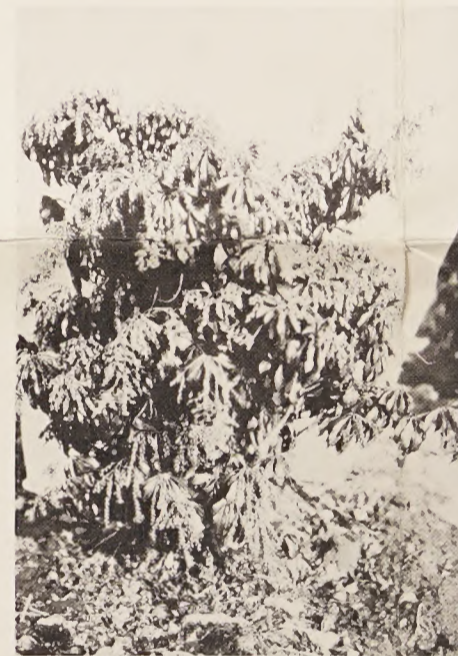
ANDROMEDA JAPONICA PIERIS JAPONICA 3-4'