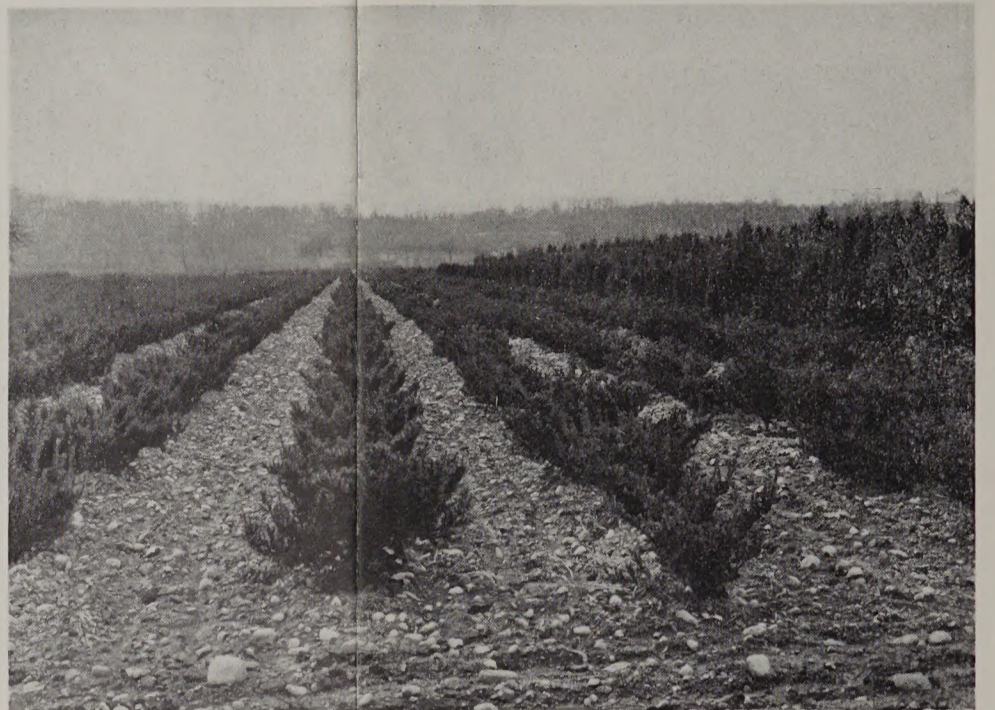
TAXUS CUSPIDATA BREVIFOLIA 3-4', 4-5', 5-6', 6-7'