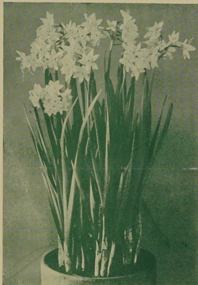
PAPER WHITE NARCISSUS GROW IN SOIL OR WATER LILIES FOR INDOORS

WIZARD BRAND COW MANURE —100 lbs., $2.75; 50 lbs., $1.50; 25 lbs., $1.00; 10 lbs., 50c; 5 lbs., 30c.