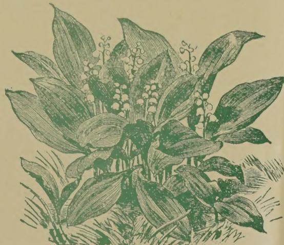
LILY OF THE VALLEY

VIRGINIA BLUEBELLS (Mertensia). An early spring-flowering plant, growing about 1 to 1 1/2 ft. high with blue flowers fading to pink; one of the most interesting of our native spring flowers. 10c each; $1.00 per doz.