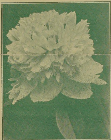
PEONIE FESTIVA MAXIMA PEONIES