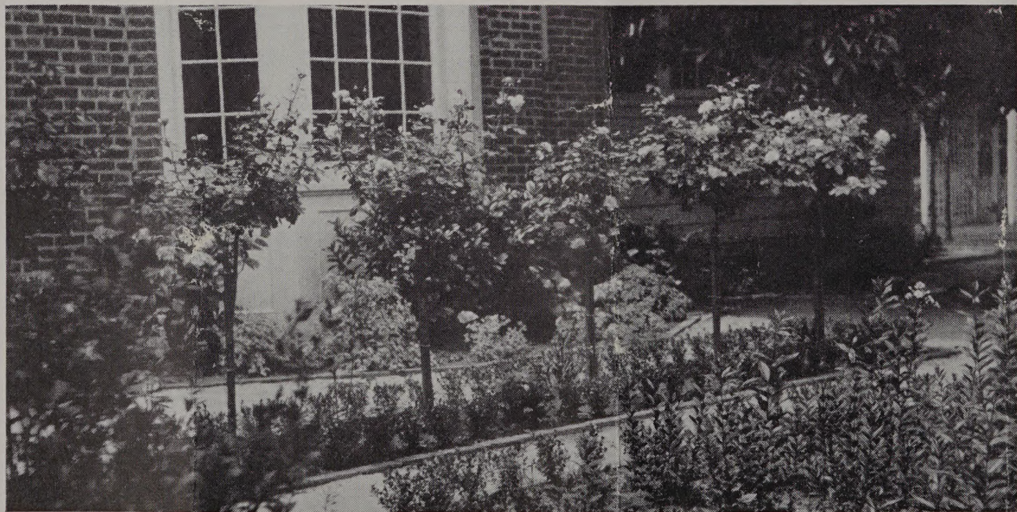
A small home planting of "Snow-field" Tree Roses set out February, 1937. Seventeen months out of the nursery row.