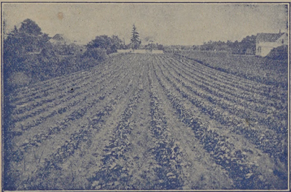
Two Year Old Superior Strain Perennials

(A Common Sense Talk on Quality continued on page 19)