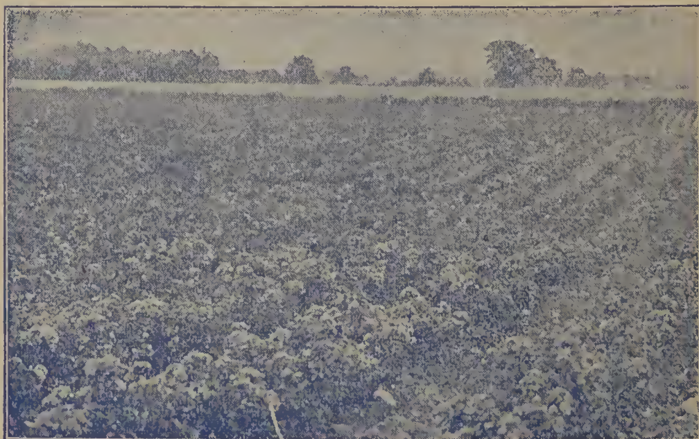
Our Roses Bloom in the Field Before Shipment