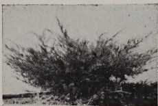
Pfitzers Juniper 24 to 30 in. spread