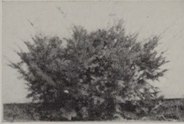
Spreading Japanese Yew 3 ft. spread