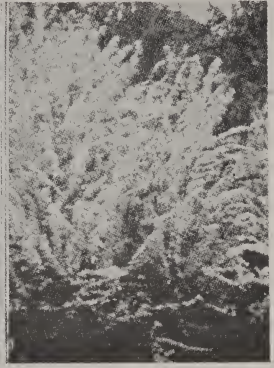
Double Flowering Mock Orange