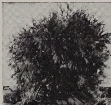
Globe Arborvitae 18 in. spread