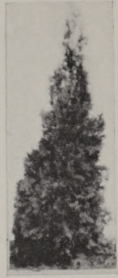
Pyramidal Arborvitae 3½ ft. high