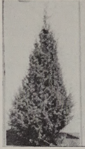
Irish Juniper 3 ft. high