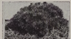
Mugho Pine 24 in. spread