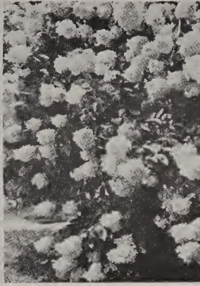
Pee Gee Hydrangea