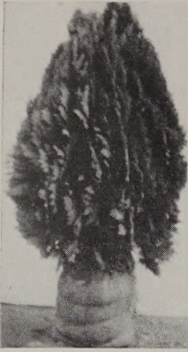
Biota Aurea Nana 30 in. high