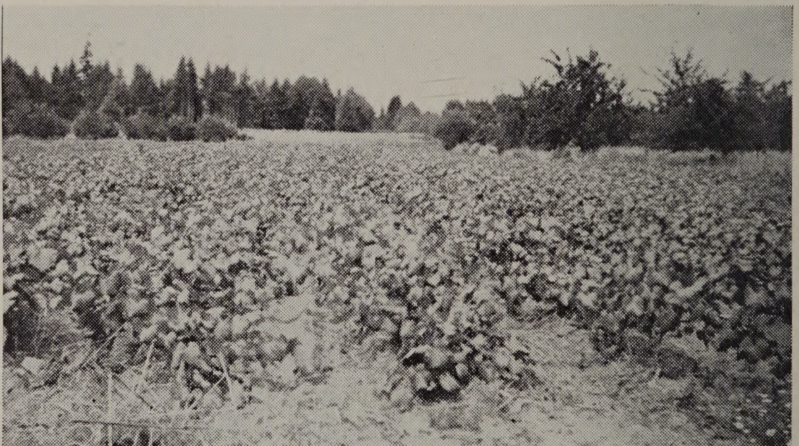
A portion of a block of 50,000 2-year-old grapes taken July 1st, that we have to offer this season.

PRICES:— 10 Plants $1.75 100 Plants $15.00