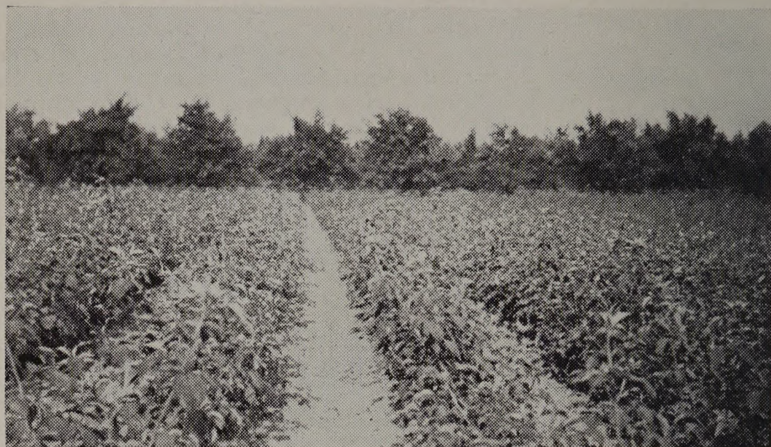
A view of one of our block of 50,000 transplant Washington Raspberries taken the first of July.