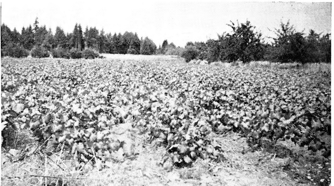
A portion of a block of 50,000 2-year-old grapes taken July 1st, that we have to offer this season.

PRICES:— 10 Plants $1.75 100 Plants $15.00