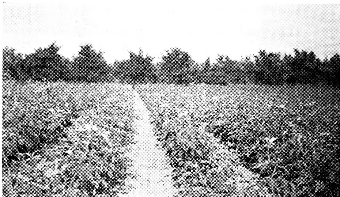
A view of one of our block of 50,000 transplant Washington Raspberries taken the first of July.