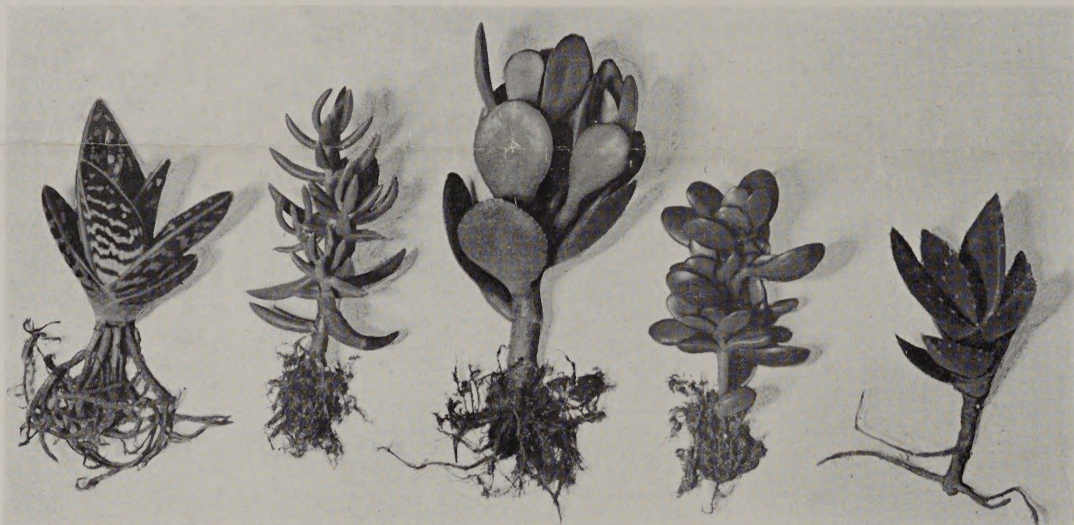
USEFUL SUCCULENTS —Aloe variegata, Crassula tetragona, Crassula arborescens, Crassula No. 1, Aloe nobilis.