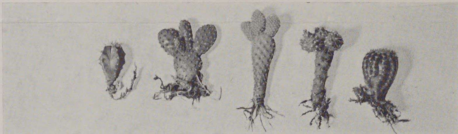
Lemaireocereus pruinosus, Opuntia rufida, Opuntia microdasys, Opuntia vilis, Echinopsis seedling. MINIATURE CACTUS