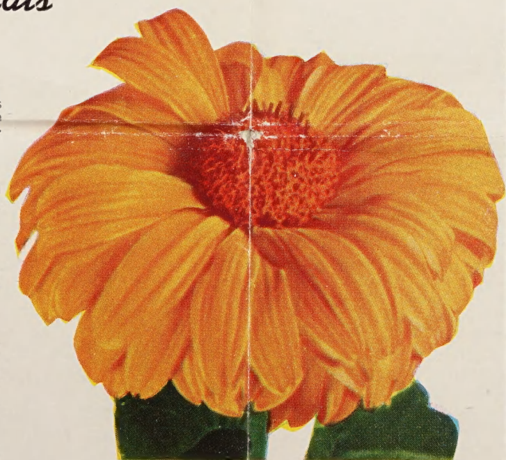
Heliosis, Summer Gold

A new, extra large, single-flowered Shasta Daisy with broad pure white stiff petals and clear small yellow centers. Blooms in spring and again in fall. 18-24 inches. 3 for $1.00.