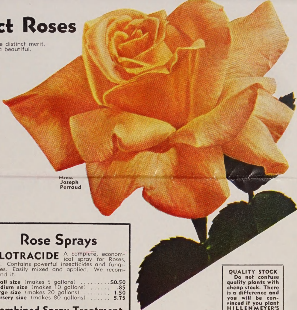
Mme. Joseph Perraud

Phyllis Gold. Beautiful clear yellow with nicely shaped buds, tinged red, opening to large, fragrant, high-pointed flowers of great substance. Strong upright grower with good foliage.