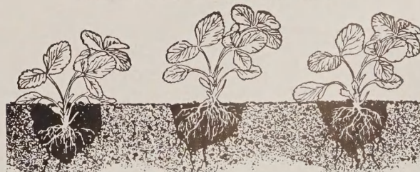
TOO DEEP TOO SHALLOW JUST RIGHT