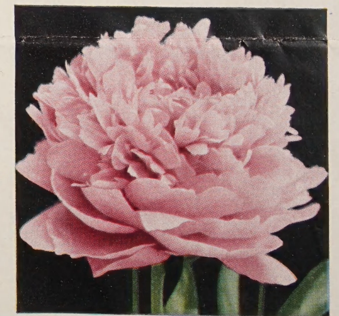
Peony, See Catalog for List