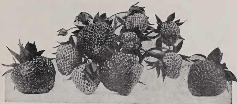
A very good representation of the Gem.

Gem We have been selling the everbearers now for more than a quarter of a century, beginning with the old Progressive, but until recently we have not felt that we could conscientiously recommend any that we have seen. We do, however, feel that we can sincerely give endorsement to the Gem and Mastodon. It has been true that a berry that will give us some good fruit in the off season is very desirable, perhaps the demand for such a berry is even greater now, since there are so many local market sales. To supply this need there has been a persistent effort to find varieties that would combine hardiness and vigor of plant with the production of at least a fair crop of berries. We have met with one disappointment after another. If they bore they would not grow and if they grew they would not bear , so that we have always withheld our hearty approval from any that we have seen up to now.