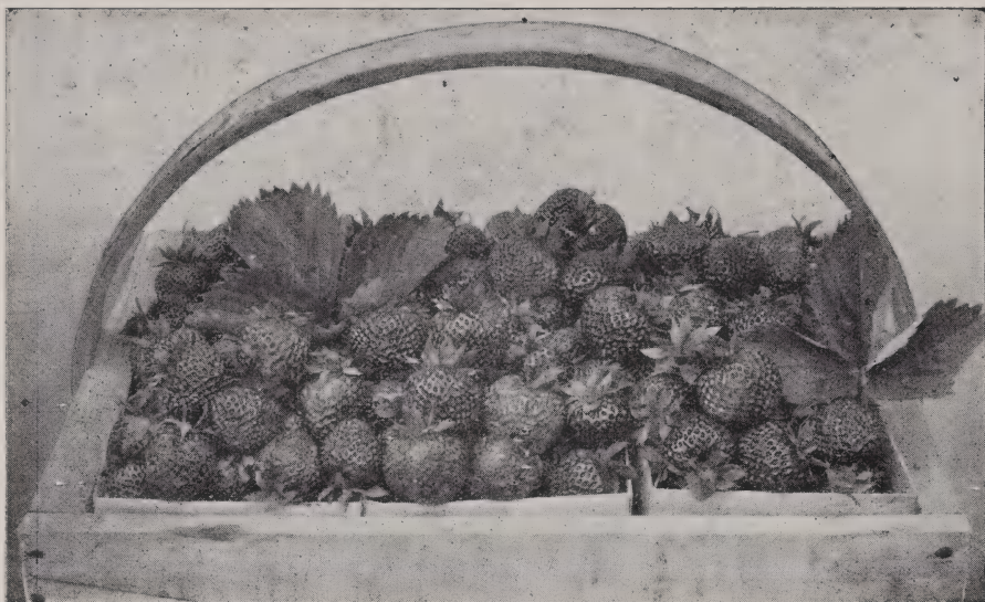
An excellent representation of the Fairfax strawberry.

Fairfax A VERY HANDSOME BERRY OF PROVED MERIT IS ALWAYS IN DEMAND AMONG BERRY GROWERS. THIS PLACE FAIRFAX ADMIRABLY FILLS. WHERE GROWERS HAVE FOUND CHESAPEAKE UNSATISFACTORY WE UNHESITATINGLY RECOMMEND THE FAIRFAX.