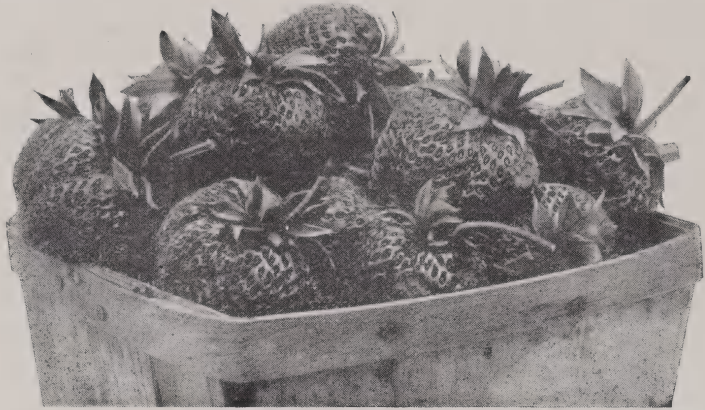
A Basket of Lupton Strawberries.

LUPTON. To the man who wishes to grow really fancy berries we suggest the Lupton. It is a perfect flowering kind and is suitable for pollenization purposes if needed, ripening early midseason. It is not a rampant plant-maker, but has never failed to make a good bed for us and the plants are heavily rooted. We do not advise that it be planted on any but a good, rich soil, and even then that should be amply fertilized for best results. Not nearly so popular as a few years ago. Not recommended for general planting. Does well in a few localities and seems to lose vigor each year.