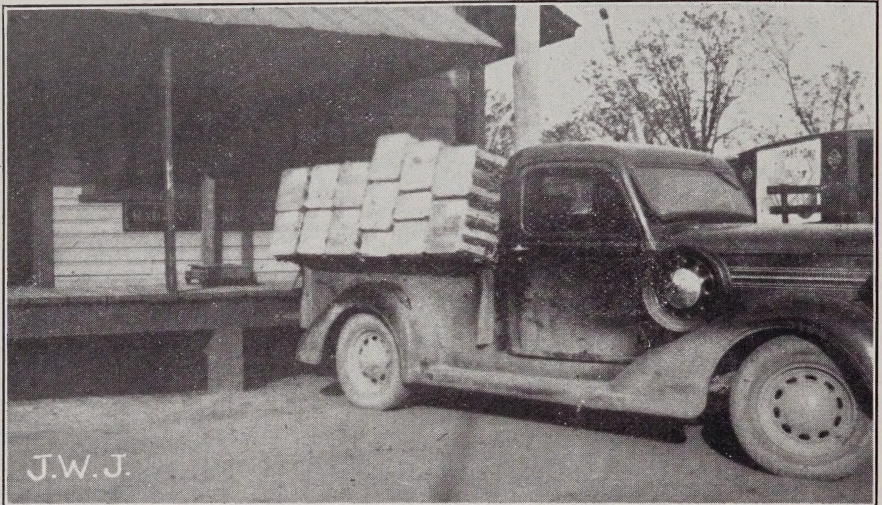
A load of our plants at the Express Office here. Note the slatted crates. Plenty of air for crowns of Plants.

For forty years we have been selling strawberry plants by catalogue only, filling orders with strictly fresh dug, true-to-name, high grade stock of our own growing. We can sometimes ship during January and February, depending on the severity of the winter, but after March first we are able to dig and ship daily until May first. After May first we can ship out a limited number of orders at purchaser's risk.