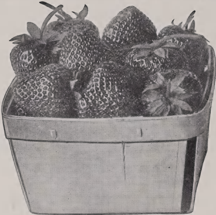
A good representation of Catskill Strawberries.

Catskill Is admirably filling the need for a berry to ripen just after Premier and Dorsett, since the Big Joe seems definitely on the way out as market variety. Wherever there is the wish to plant a mid-season kind we unhesitatingly recommend the Catskill as the best on the list.