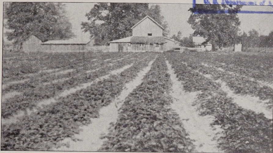
A Fine Block of Fairmore. One of the best Growers in the List. See Page 15.