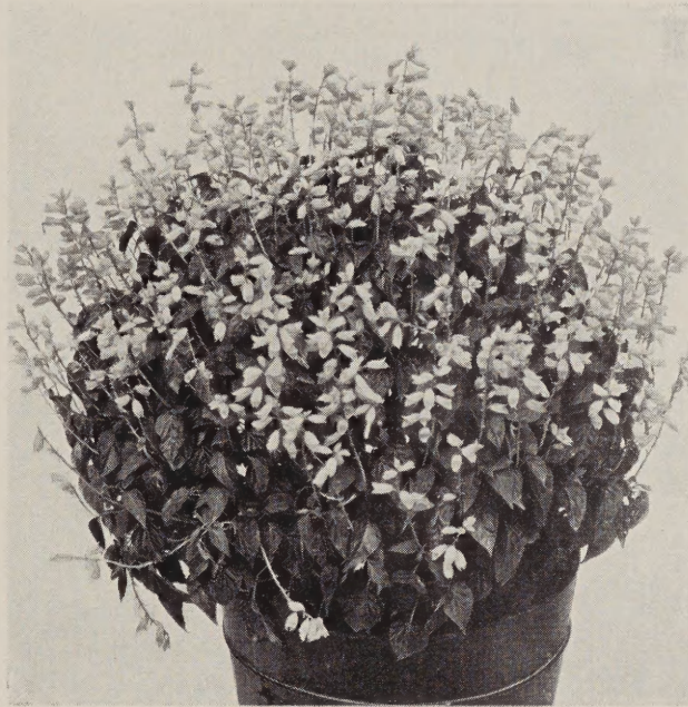
SCARLET GLOBE SALVIA

The seed-bed should never be allowed to dry out, though the watering should be done with a fine spray so that the seeds will not be washed out. Do not cover too deeply, an eight of an inch is sufficient depth. There should be some sand in the soil to provide proper drainage; for while the delphinium likes plenty of water, an excessive supply around the roots will cause them to rot. Bone-meal is a good food. If cow manure is used it must be well rotted.