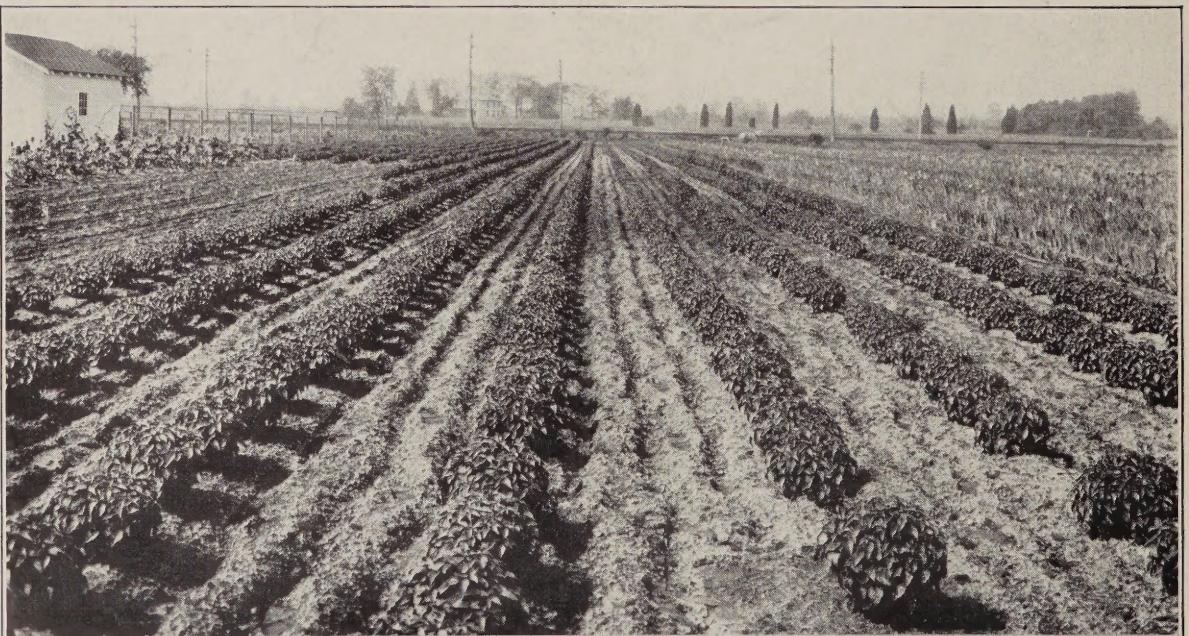
FIELD OF SCARLET GLOBE BEFORE BLOOMING

LOCATION OF NURSERY. We are on the Delsea Drive, 26 miles south of Philadelphia, about 2 miles north of Malaga, where Route 47 and 48 intersect. Visitors heartily welcome. No Sunday trade.