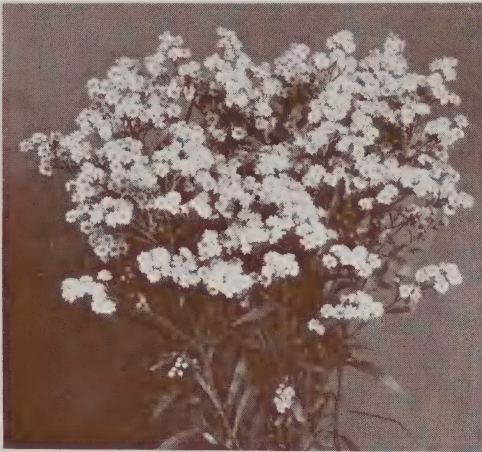
ASTER HYBRIDUS LUTEUS

Gold Flake —Rich deep golden yellow—blooms from Aug. to Oct. 12 in. 25c.