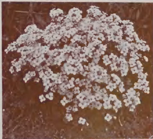
ARABIS ALBIDA ROSA BELLA

ARABIS albida fl. pl. (R)—Cascades of double stock-like flowers in solid masses. An extra fine rockery plant and lasts well when cut. No garden should be without it. 6 to 8 in. Early spring. 25c.