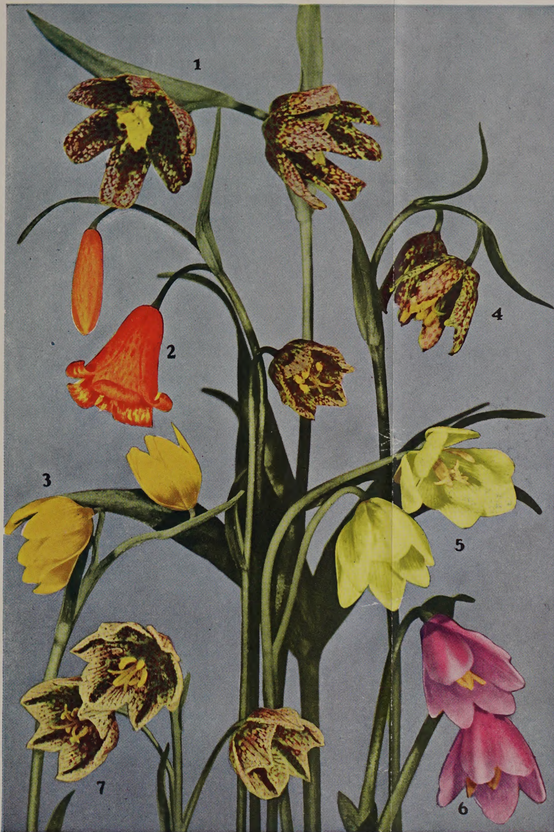
FRITILLARIAS (See Page 9)

1 and 4, Lanccolata . 2, Recurva . 3, Pudica . 5, Liliacea . 6, Pluriflora . 7, Purdyi , varied form.