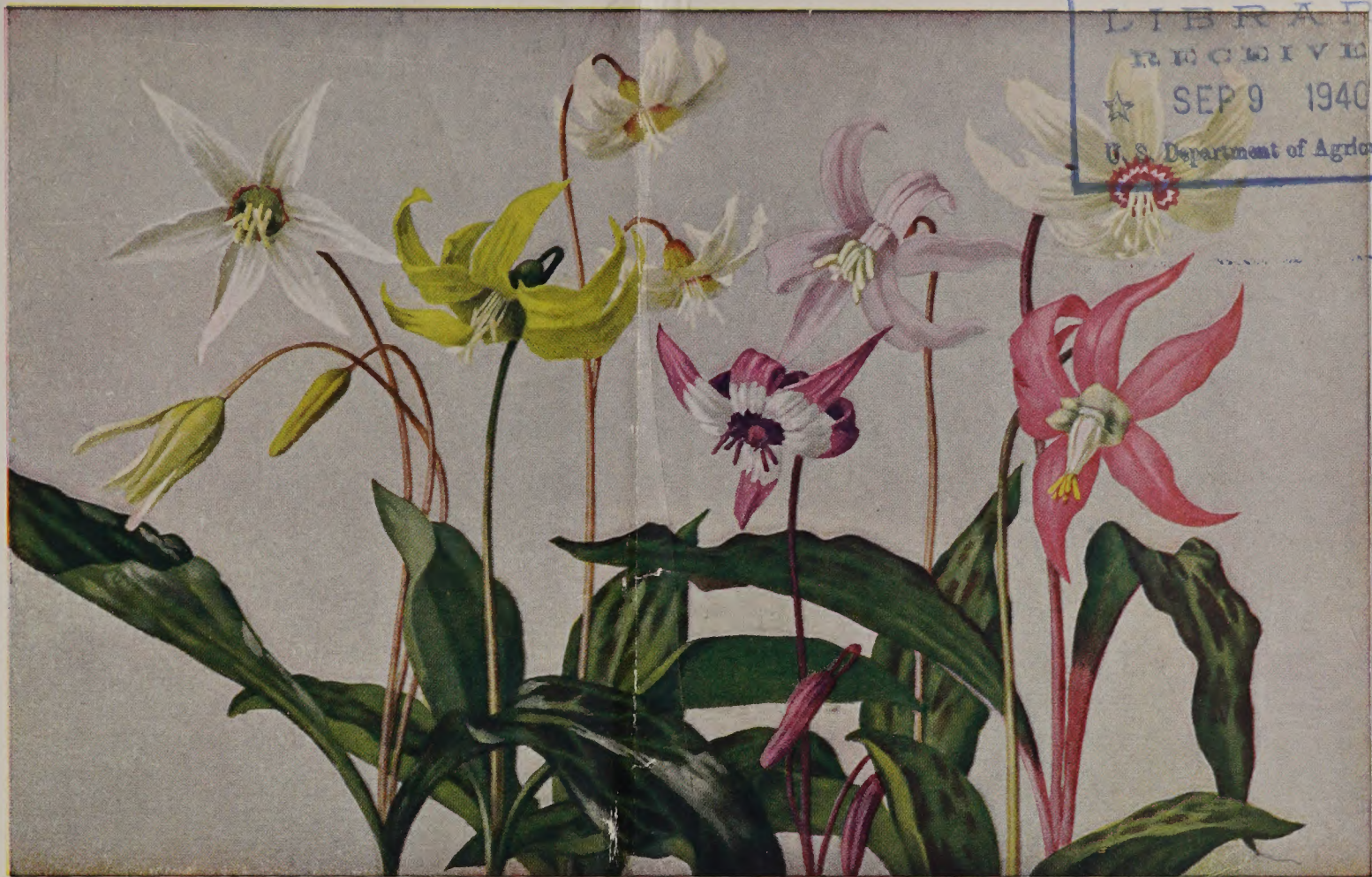
The delicate tints of Erythroniums make them one of the most charming plants in a garden. The varieties here illustrated are: Giganteum, Grandiflorum robustum, Citrinum, Hendersonii, Revolution Pink Beauty, Californicum White Beauty, Johnsonii. (See pages 8 and 9.)