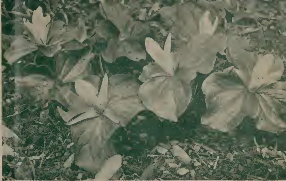
Trillium sessile increases and becomes more valuable year by year.

Situation. My description of the natural habitat will suggest the best location where large and varied grounds give a choice. On the margin of a pond or brook, planted a foot or so above the water-level in moist, meadow-like expanses in sheltered places, or damp openings in wood are ideal locations. In small grounds, a hydrant can be so arranged as to give a constant drip; the fern corner is good, and the rhododendron bed is perfectly adapted.