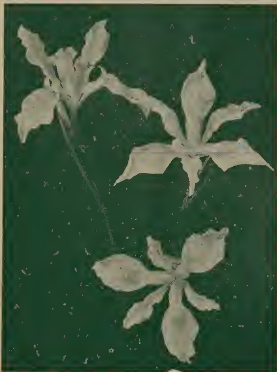
California Native Iris (see p. 22)

* STATICE artica Californica . Sea Peak . 6 in. Neat tufts of grassy foliage and bright pink flowers all summer. Fine for rock garden or edging. Sun. Soil, any. 25 cts. each; 3 for 65 cts.