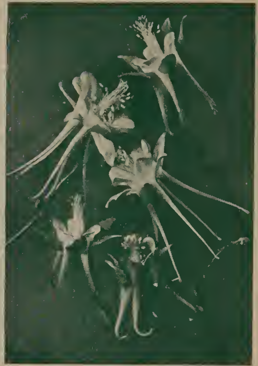
Long Spur Columbines

** Indicates plants suited to the rock garden only.