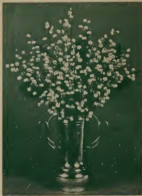
Lilies of the Valley

LILIES. For many beautiful species for border and lily bed see pages 10, 11.