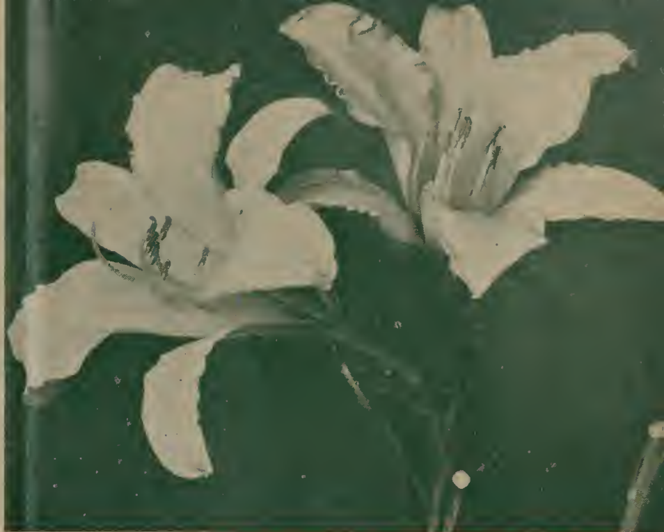
Hemerocallis or Day Lilies

HELLEBORES, Christmas Rose; Lenten Rose. Hardy perennials admired for their attractive early flowers and for their handsome leaves. There are two quite distinct types. H. Orientalis Hybrids, the Lenten rose, have many large palmate leaves, rising from a heavy root to make a bold evergreen clump, 18 inches high and as wide in old plants. Once established they continue for years. The flowers are in many beautiful shades and often 3 inches across. They last fresh for many months, here in California from October to April and in colder regions each milder spell in winter brings out the buds. I imported from Millet of France his finest varieties and these are now ready to sell. My collection of over 25