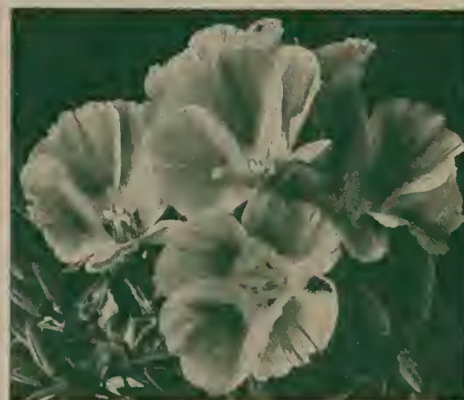
Godetia, Kelvidon Glory. See page 31