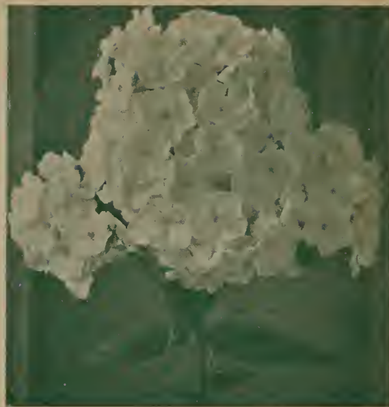
Perennial Phlox (See Page 27)