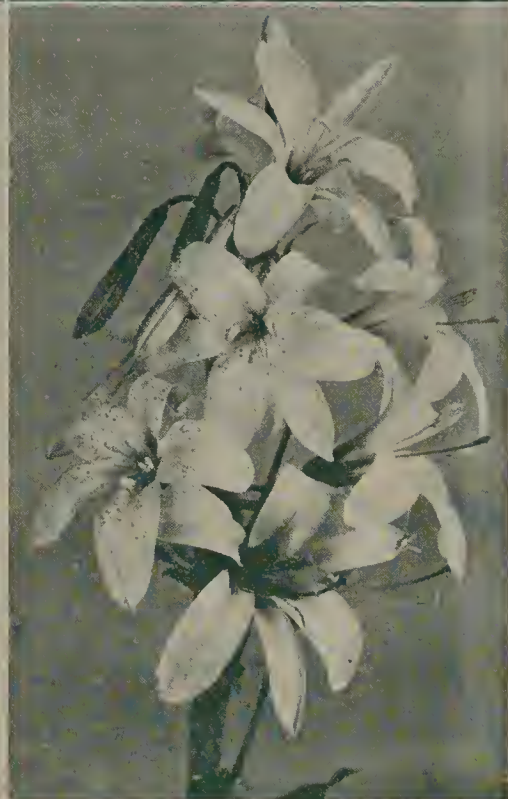
L. Kelloggii. L. Bolanderii. L. Pardalium Giganteum.