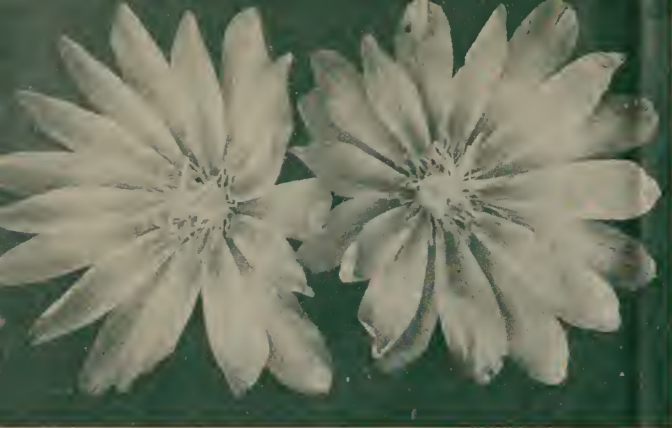
Lewisia Rediviva (see page 23)

VIOLA. In any garden Violas should have a conspicuous position, for the most modest are delights. Cult: Sun or light shade. Soil, a rich loam with constant moisture for finest effects. Pl., fall to spring. Seeds.