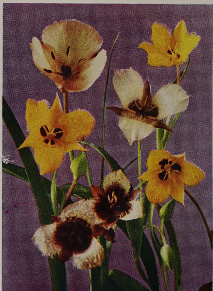
Calochortus Lilacinus, C. Maweanus Major, C. Maweanus Purpuraseens, C. Benthamii