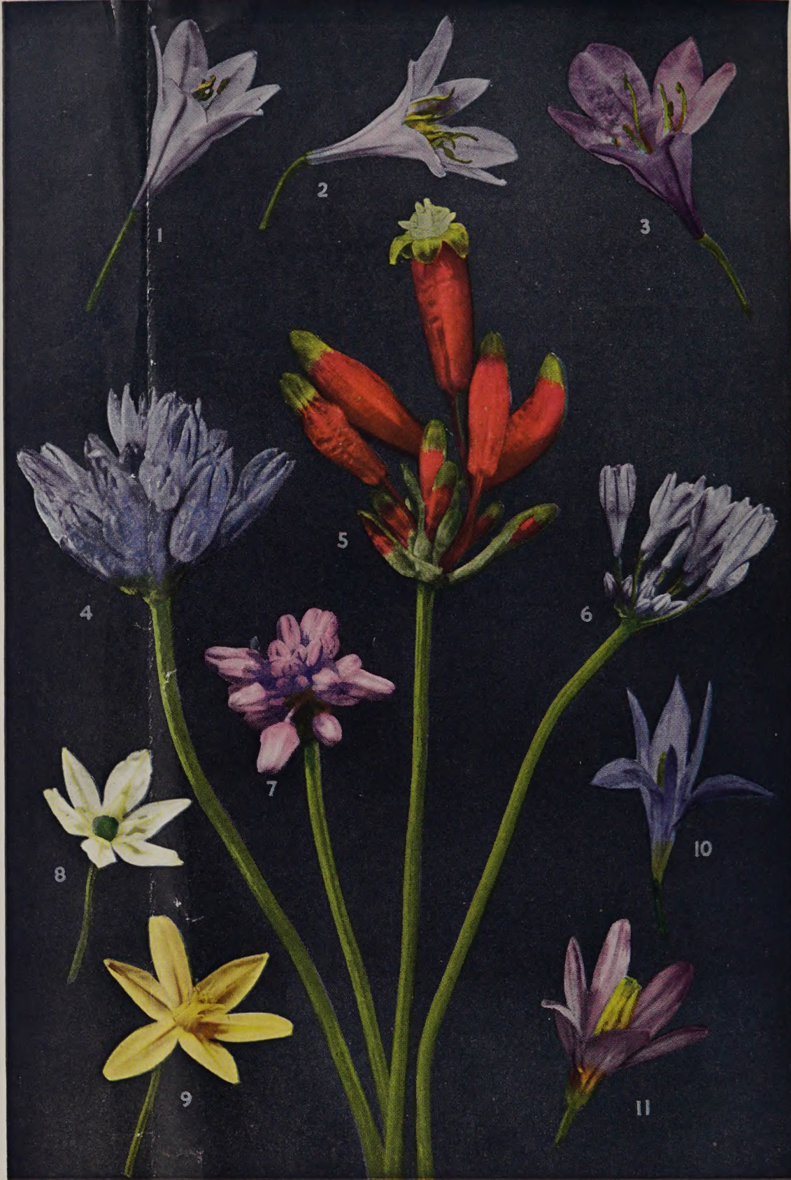
1. Laxa 2. Candida 3. Bridgessii

Errors of any sort are carefully corrected. Do not complain to your friends if something seems wrong, but come straight to me.