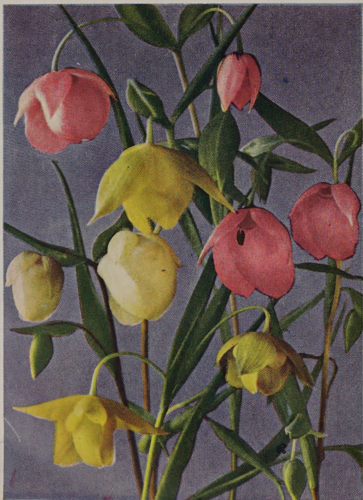
Calochortus Amabilis, C. Amoenus, C. Albus

Your attention is invited to the beauty of Mariposa Tulips and other Californian bulbs and their versatility in filling a variety of situations.