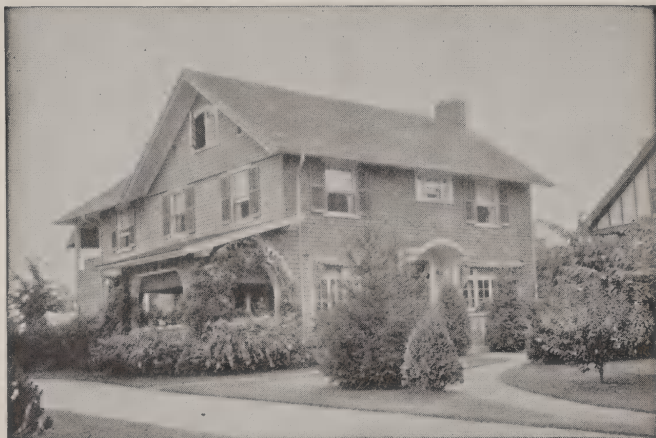
Evergreens add winter beauty to the planting

Our evergreens are grown with plenty of room and are compact, well filled trees of their size and variety. They have been transplanted and root pruned and are well rooted. They are not grown rapidly and soft but are firm and easily transplanted. They are liberally graded. With the exception of the "mail size" they will be dug with a ball of earth wrapped in burlap, termed "balled and burlapped" or B. & B.