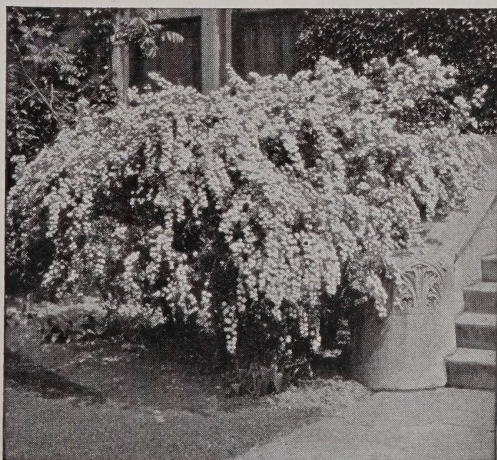
Spirea Van Houttei, a fountain of white in April and May