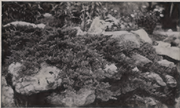
Andorra and Waukegan are trailing Junipers (Pages 13, 14)

A magnificent Chinese lily; white, center flushed yellow, outside of petals tinged purplish; delightful fragrance; easily grown. Bulbs 5 - 6 in. around, 12c each, 3 for 35c, $1.25 per doz. Postpaid, 3 for 45c, $1.45 per doz. Bulbs 6 - 7 in. around, 15c each, 3 for 40c, $1.50 per doz. Postpaid, 3 for 50c, $1.70 per doz.