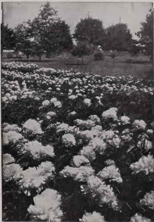
Peonies are easily grown.

Duke of Wellington (Calot, 1859). Broad white guards, center very full, sulphur-white becoming pure white; fragrant; bomb type; late; blooms freely; vigorous; long, strong stems; very large. 25c each, $2.50 per doz.