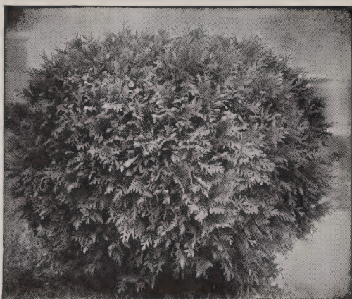
Woodward Globe Arborvitae is naturally globular in form. (Page 12)

Juniper, Savin. Thickly branched, low and spreading; an excellent unusual tree for foundation planting and to border taller evergreens, in a sunny situation.