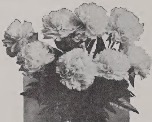
Crown of Gold, famous for its beauty (Page 24)

Judge Berry (Brand, 1907). Very large, flat flowers of a delicate flesh pink; growth strong, blooms freely, very early. 75c each, $7.50 per doz.