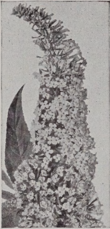
Butterfly Bush (Page 3)