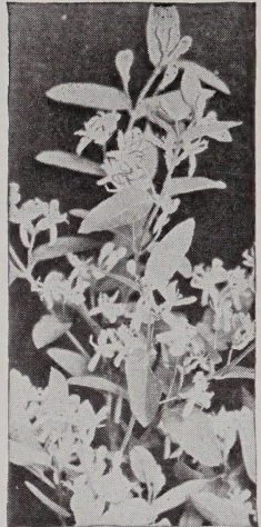
Bush Honeysuckle (Page 4)

Deutzia Lemoine. Beautiful snow-white, starry flowers in cone-shaped clusters in May; upright, reaching 4 ft. 18 to 24 inches ----- .30 each; 2.50 per 10