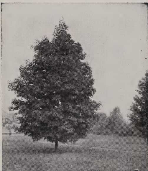
Sugar or Hard Maple (Page 10)

Willow, Pussy, Lemoine. A shrub or small tree, its furry catkins appearing before the leaves; easily grown. 2 to 3 ft. ----- .25 each 3 to 4 ft. ----- .35 each