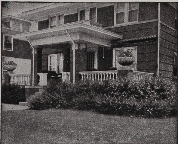
Foundation planting of Barberry and other shrubs

Missouri customers please add two per cent sales tax, which we are required to collect and remit to the State Auditor. Price lists are necessarily issued subject to State or Federal regulations that may be hereafter enacted.