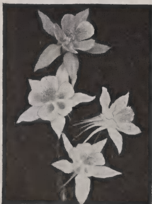
Columbine (Page 18)

Daisy, Early Elder. Flowers 2 to 3 in. across on 20-30 in. stems in early May. 15c each, 3 for 30c, $1.00 per doz.