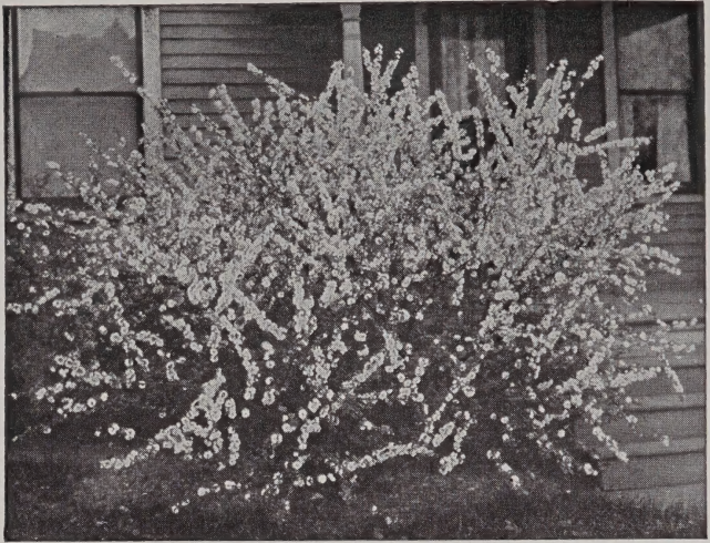
Flowering Almond, very showy in early April