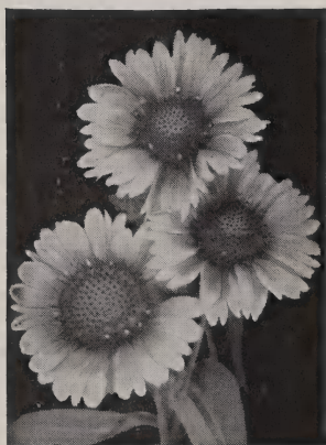
Blanket Flower (Page 18)