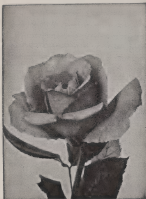
Etoile de Hollande