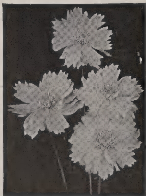
Coreopsis (Page 18)

Buechley's Giant. A very large, brilliant medium blue Iris; tall; early. 20c each, 3 for 50c.