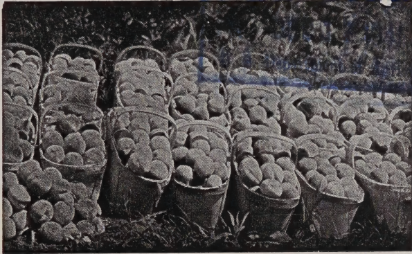
Peaches bear the third year (page 31)