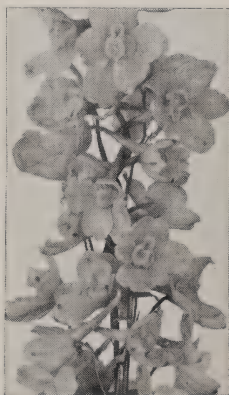
Delphinium (Page 19)