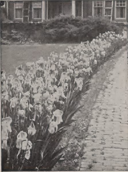
Liberty Irises, perfectly hardy and easy to grow, furnish a wealth of rainbow colors in May

Prices: 15c each, 3 of a kind for 30c, $1.00 per doz., except as noted Six or more of a kind at dozen rates. Postage additional if by parcel post, 2c each, not less than 10c per package, for Missouri and adjoining states.