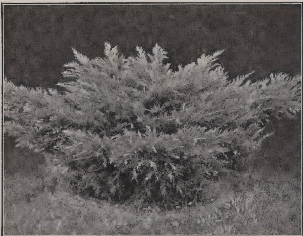
Pfitzer Juniper thrives in almost every location

Mail size, postpaid .40 each 12 - 15 in., B. & B. 1.00 each 15 - 18 in., B. & B. 1.35 each 18 - 24 in., B. & B. 2.00 each 24 - 30 in., B. & B. 2.50 each 30 - 36 in., B. & B. 3.25 each 3 - 3½ ft., B. & B. 5.00 each 3½ - 4 ft., B. & B. 6.00 each