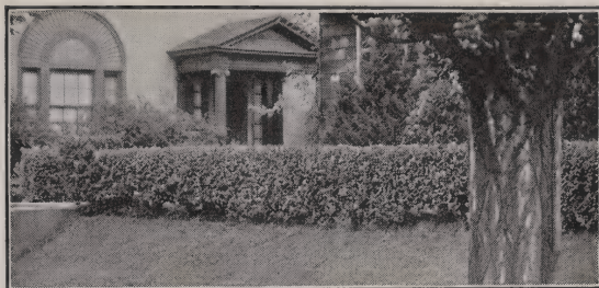
Privet, the living fence