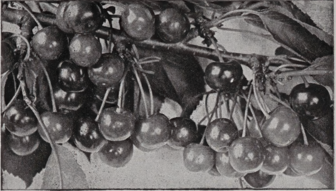
Cherries give quick results