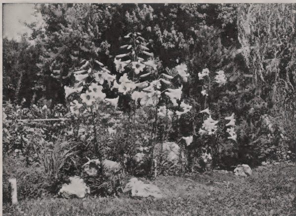
Regal Lilies at Sarcoxie Nurseries