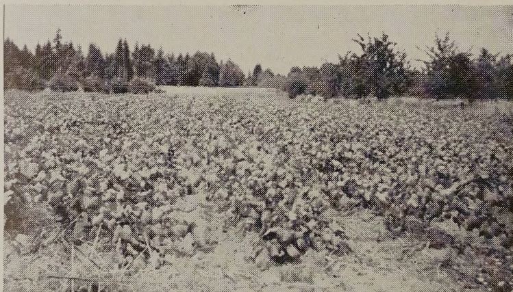
A Portion of a Block of 50,000 2-Year-Old Grapes

Prices:— 10 Plants $1.75 100 Plants $15.00