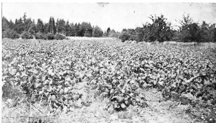
A Portion of a Block of 50,000 2-Year-Old Grapes

Prices:— 10 Plants $1.75 100 Plants $15.00