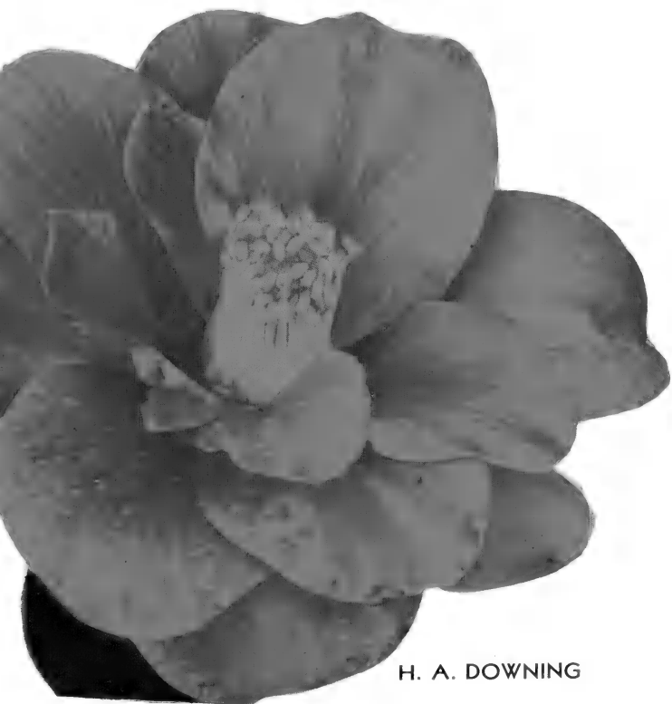
H. A. DOWNING

GIGANTEA. Semi-double to peony form; red marked with white. Flower usually 5 to 6 in. in diameter. 10-15 in. to 24-30 in.