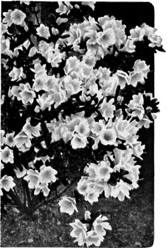
AZALEA, CORAL BELLS

PINK PEARL. Light pink flowers produced in dense clusters. Tall; midseason.