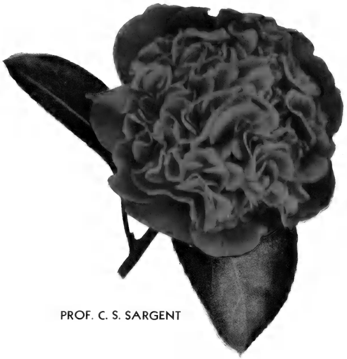
PROF. C. S. SARGENT