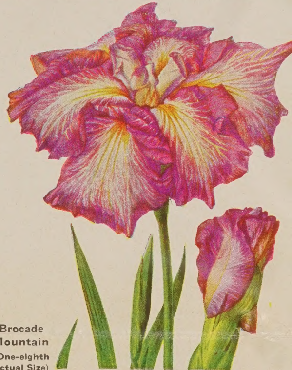
Brocade Mountain (One-eighth Actual Size)