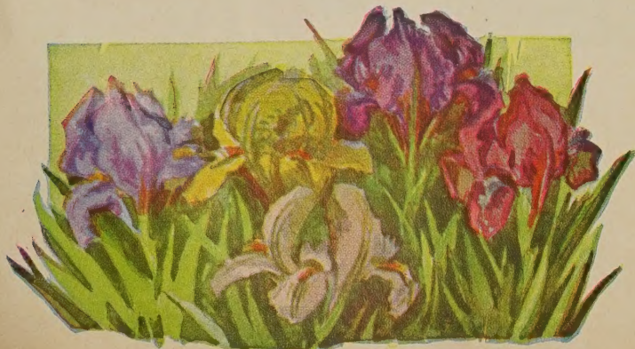
Miniature Bearded Iris

For a Complete Listing of 60 Varieties of Miniature Gems See Page 34 of My Iris Catalogue