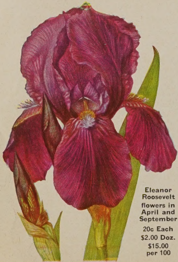
Eleanor Roosevelt flowers in April and September