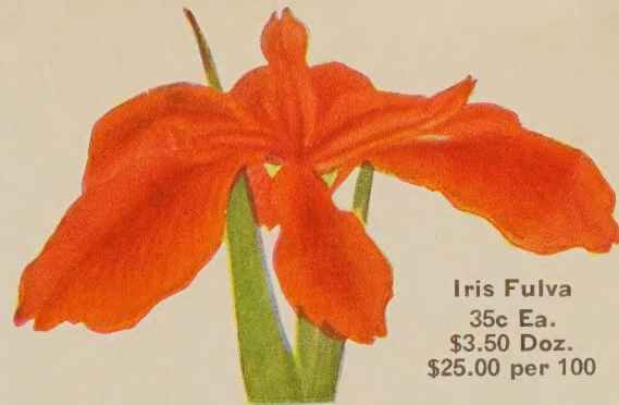
Iris Fulva 35c Ea. $3.50 Doz. $25.00 per 100

The Beardless Iris is well-known to be the hardiest of all the Iris family, readily adaptable to any climate and any situation. It is the ideal Iris for cutting, and a general favorite for flower arrangements and all ornamental purposes. The following is a very choice selection: