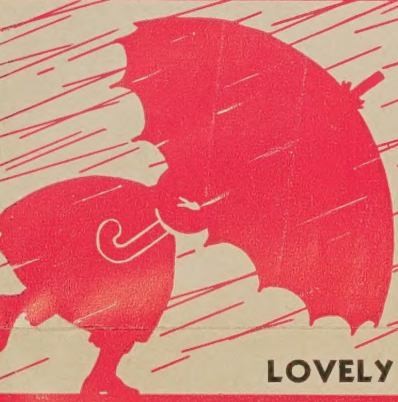
The First Flowers of Springtime