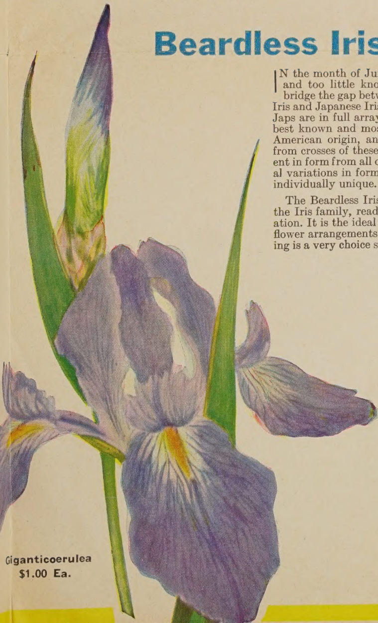
Giganticoerulea $1.00 Ea.