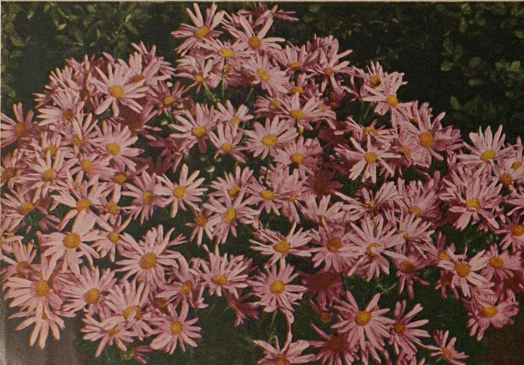
PINK SHASTA DAISY "CLARA CURTIS"

The illustration below is just one plant. This illustration is greatly reduced, as the plant is nearly 2 feet across and the flowers are as much larger in proportion, being about 3 inches in diameter. The flowers are always produced in the greatest profusion during August, September and October, just as shown in the illustration. It is the hardiest of all Shasta Daisies and one of the hardiest of all plants grown. It has grown outdoors unprotected without injury at my nursery in the highlands of New Jersey, near one of the highest points in the state, where winter temperatures reach 20 below zero. It is a gorgeous sight in the garden and superb as cut flowers. 50c each; 3 for $1.25; 6 for $2.00; 12 for $3.50; 25 for $6.00; 100 for $22.50.