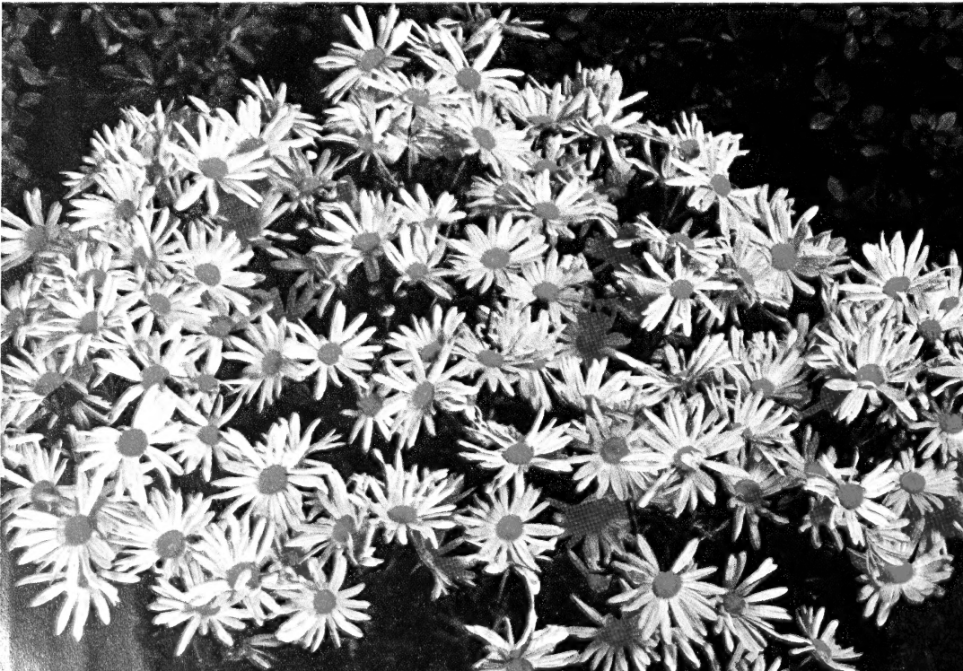
PINK SHASTA DAISY "CLARA CURTIS"

The illustration below is just one plant. This illustration is greatly reduced, as the plant is nearly 2 feet across and the flowers are as much larger in proportion, being about 3 inches in diameter. The flowers are always produced in the greatest profusion during August, September and October, just as shown in the illustration. It is the hardiest of all Shasta Daisies and one of the hardiest of all plants grown. It has grown outdoors unprotected without injury at my nursery in the highlands of New Jersey, near one of the highest points in the state, where winter temperatures reach 20 below zero. It is a gorgeous sight in the garden and superb as cut flowers. 50c each; 3 for $1.25; 6 for $2.00; 12 for $3.50; 25 for $6.00; 100 for $22.50.