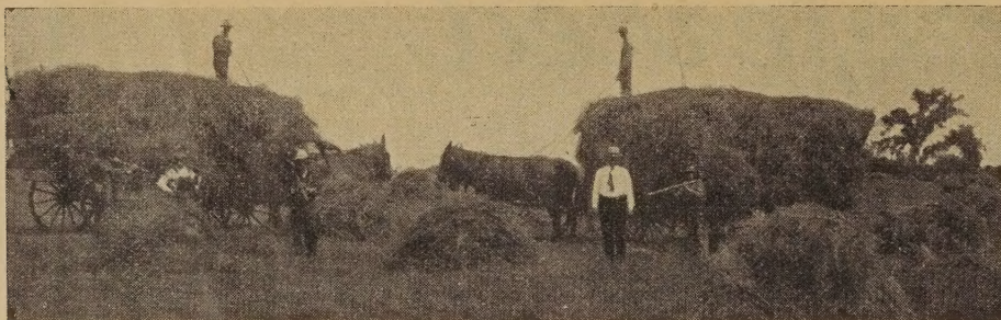
Wood's Special Grass and Clover Mixtures—most dependable for long lasting crops