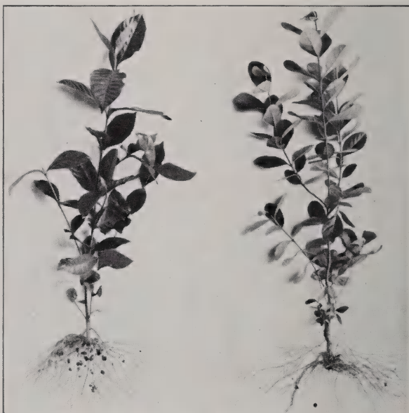
8-12 inch liners, Gardenia, Mystery and Feijoa sellowiana

FEIJOA sellowiana. Pineapple Guava. A very compact shrub with light green leaves, underside silvery. Small purple flowers in late spring followed by edible fruit in the milder climates.