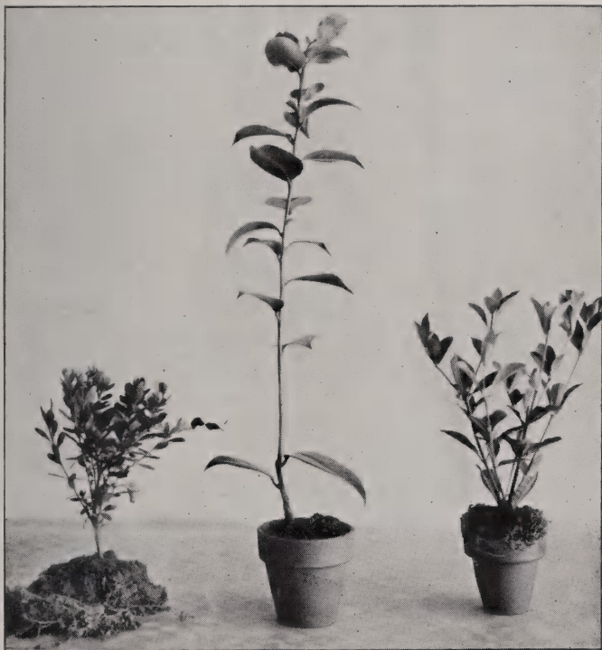
Azalea, Coral Bells, liner. Camellia, 8 to 12 inch, in 3-inch pot; and Gardenia veitchi in 2½-inch pot

We know that we can please you with our plants; all orders will be given our very best attention. Many customers who started buying from us the first year we were in business are still buying every year. We do not have the largest nursery in this section, and for that matter are not trying to outdo anyone in that respect, but we do try to produce the best plant for the money, and will continue to do so. A trial shipment will convince you, but if you are not entirely satisfied, we are ready and willing to make any reasonable adjustments.