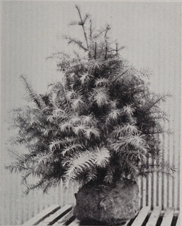
Cunninghamia lanceolata , 18 to 24-inch

CUNNINGHAMIA lanceolata. Chinese Fir. Well-known plant that will make quite a tree if left alone.