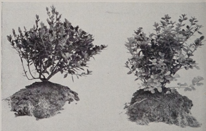
8 to 10-inch Azaleas, Coral Bells and Hinodegiri

*These are our bed-grown plants for growing on, and do not have flower buds. Spring shipment is better, as you will not have the expense of carrying them through the winter months. We have given these plants plenty of room to develop good root systems, also have kept them pinched back many times to make them bushy. None better are to be found anywhere.