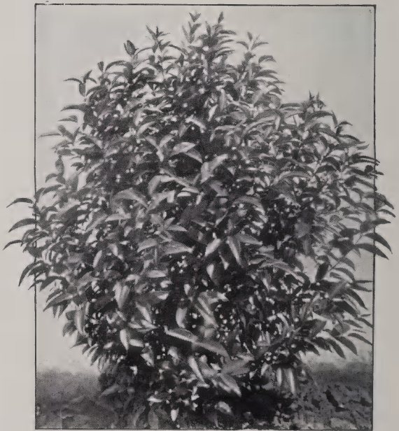
Ligustrum japonicum. See page 27