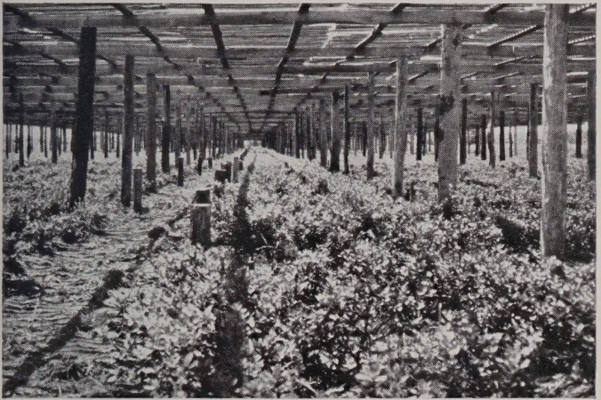
Lathhouse scene showing 80,000 Azaleas, mostly Kurume.