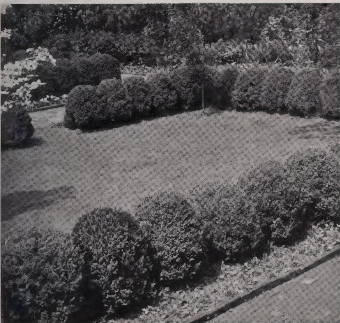
Buxus sempervirens (Boxwood)