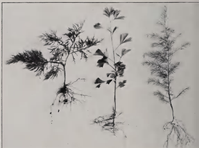
8 to 12-inch liners: Juniperus chinensis pfitzeriana , Ginkgo biloba and Cedrus deodara

GINKGO biloba. Maidenhair Tree. A very popular shade tree in almost all sections of this country.