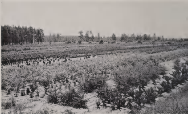
Field scene showing one of our fields