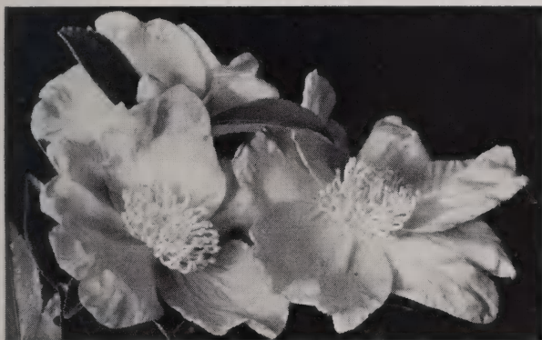
Camellia sasanqua rosea