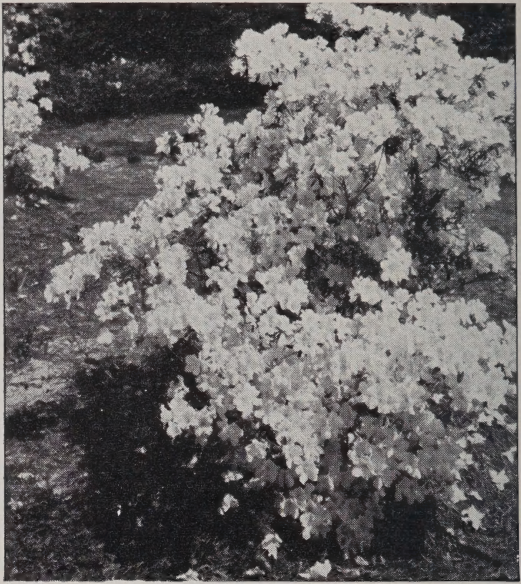
Azalea, Pride of Mobile