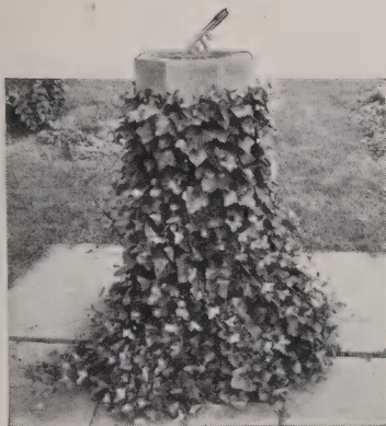
Hedera helix (English Ivy)