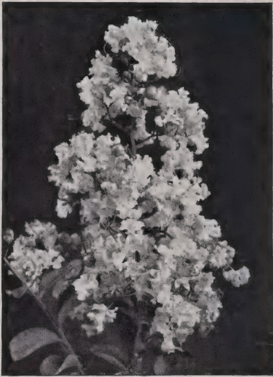
Crape Myrtle ( Lagerstræmia indica )

LAGERSTROEMIA indica. Crape Myrtle. We have the bright crimson-red only—no other color to offer. All of our plants were cut back heavy and are very bushy this season.