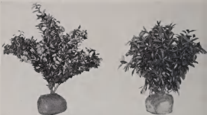
18 to 24-inch Balled and Burlapped plants of Ligustrum lucidum compactum and Gardenia, Mystery

GARDENIA, Mystery. Very fast grower with large flowers, larger than Gardenia florida .