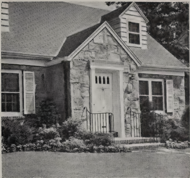
A combination of Yews and Broad-Leaf Evergreens is the ideal planting for the small home