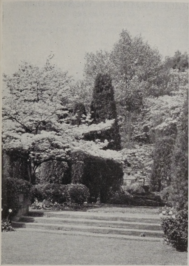
Flowering Dogwoods form the best of natural backgrounds