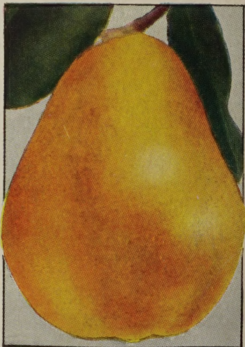
CLAPP'S FAVORITE PEAR