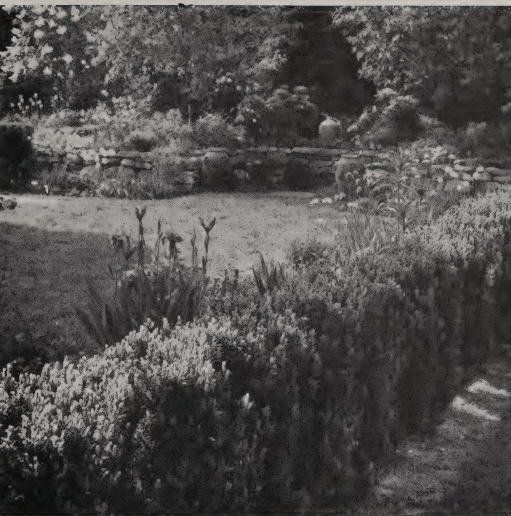
Hicks' Yew Hedge