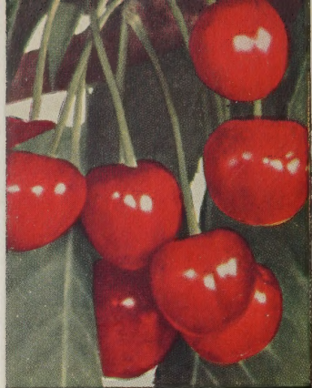
EARLY RICHMOND CHERRIES