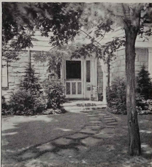
A pleasant home-like entrance approach