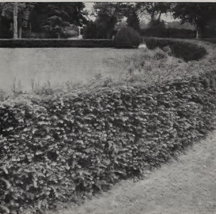
Upright Japanese Yew Hedge