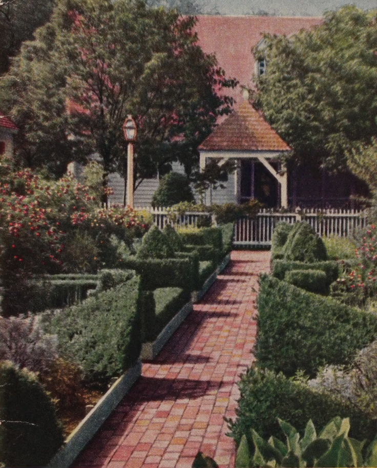
A charming eighteenth-century garden in Williamsburg, Va., as it appears today