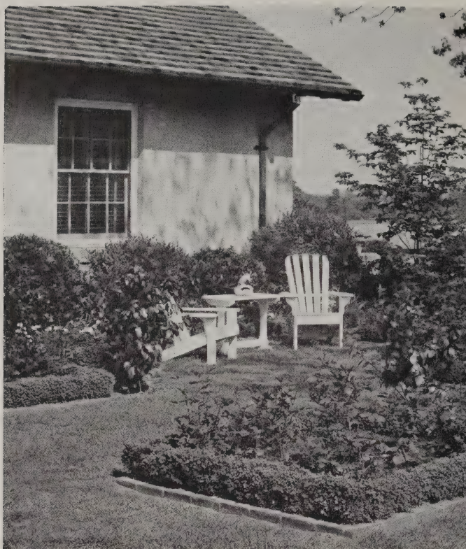
A Garden Nook offering