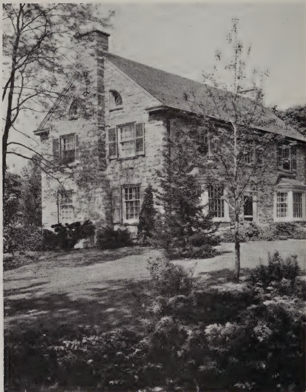
A few well-placed trees create a natural setting