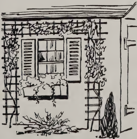
Your garage need not be an eyesore. A simple trellis, a few vines, a window-box and some dwarf evergreens will completely transform it