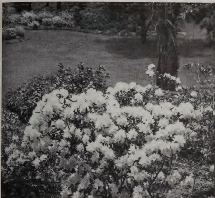
in a pleasing border planting

Azalea, Hinamoyo. Japanese Azalea. Very much like the Hinodegiri in habit, the flowers being a beautiful shade of soft pink, produced in great profusion in May.