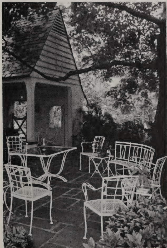
An Outdoor Terrace makes staying home a pleasure