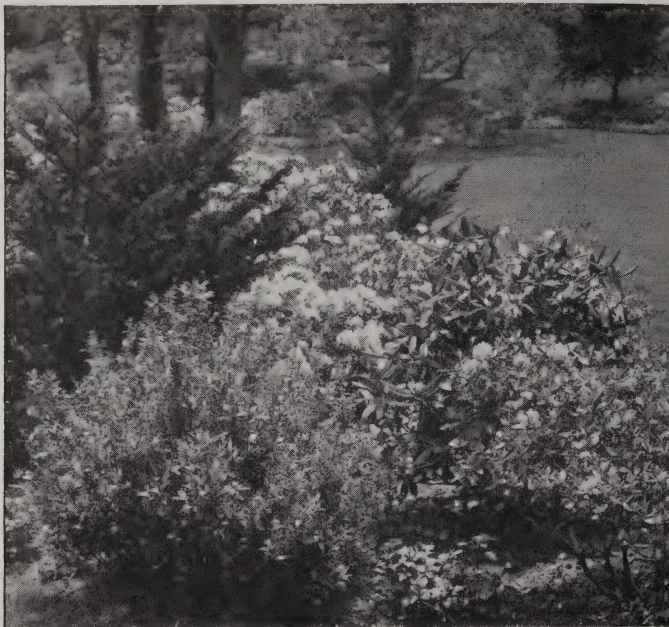
Yews, Deutzia gracilis and Rhododendrons combined