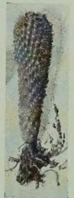
O. Boxing Glove