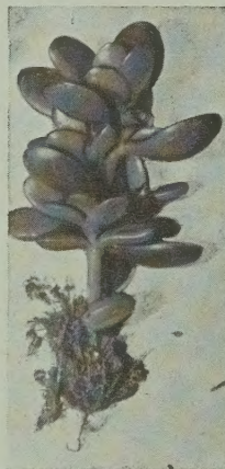
C. Hybrid #1