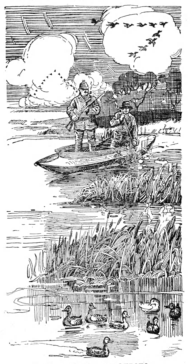
GAME FOOD NURSERIES P. O. Box 371 OSHKOSH, WISCONSIN, U. S. A.