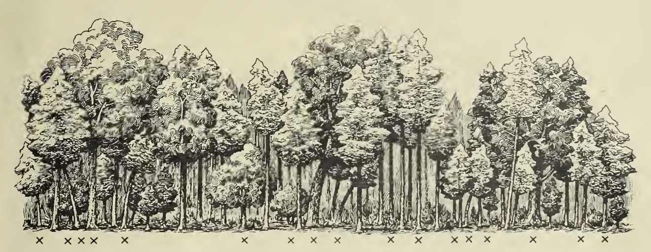
BEFORE CUTTING - CUT TREES MARKED (X) - KEEP OTHERS FOR FUTURE USE