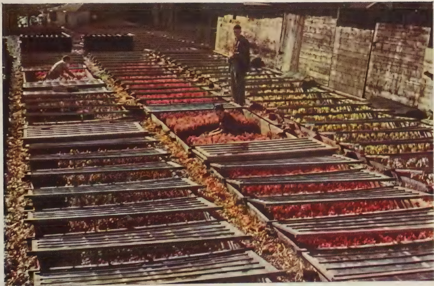
MESKERSBROS quality Hyacinths forced at Long Island N.Y. in cold frames without any heat for Easter March 28th 1948