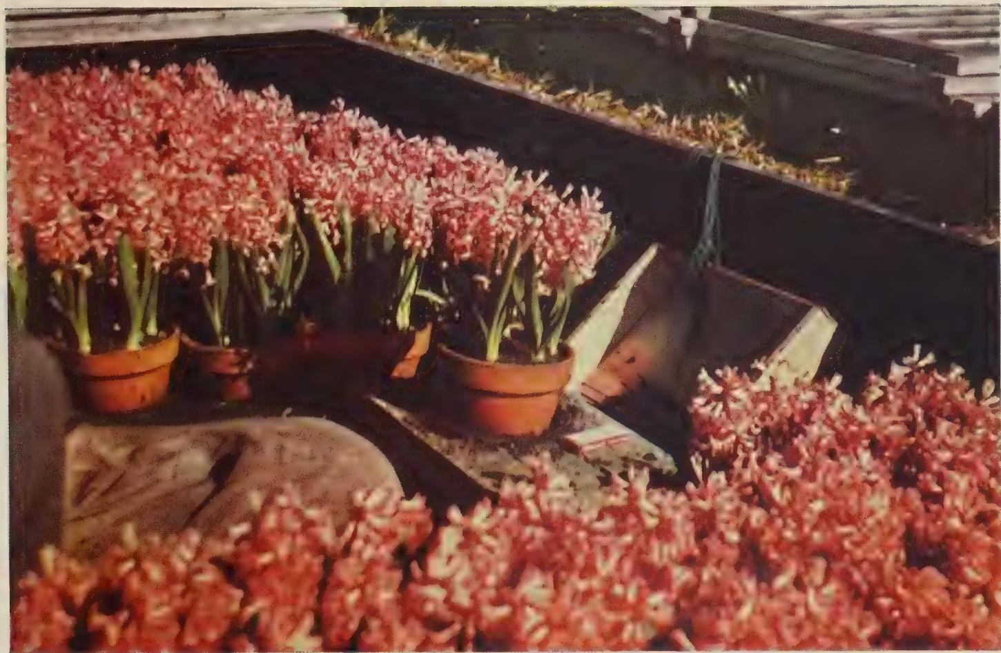
MESKERS BROS quality Hyacinths forced at Long Island N.Y. in cold frames without any heat for Easter March 28th 1948