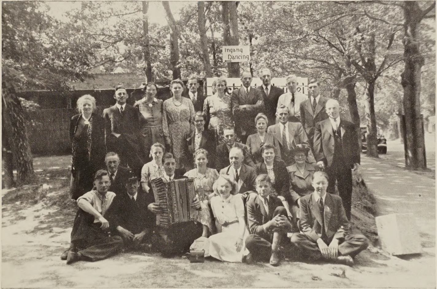
Excursion of MESKERS BROS staff. June 1948