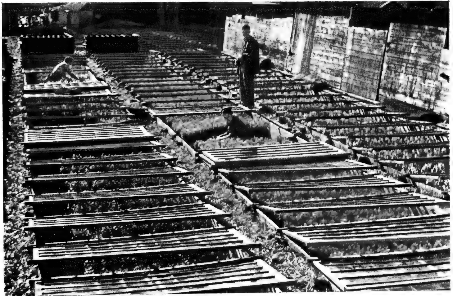
MESKERSBROS quality Hyacinths forced at Long Island N.Y. in cold frames without any heat for Easter March 28th 1948