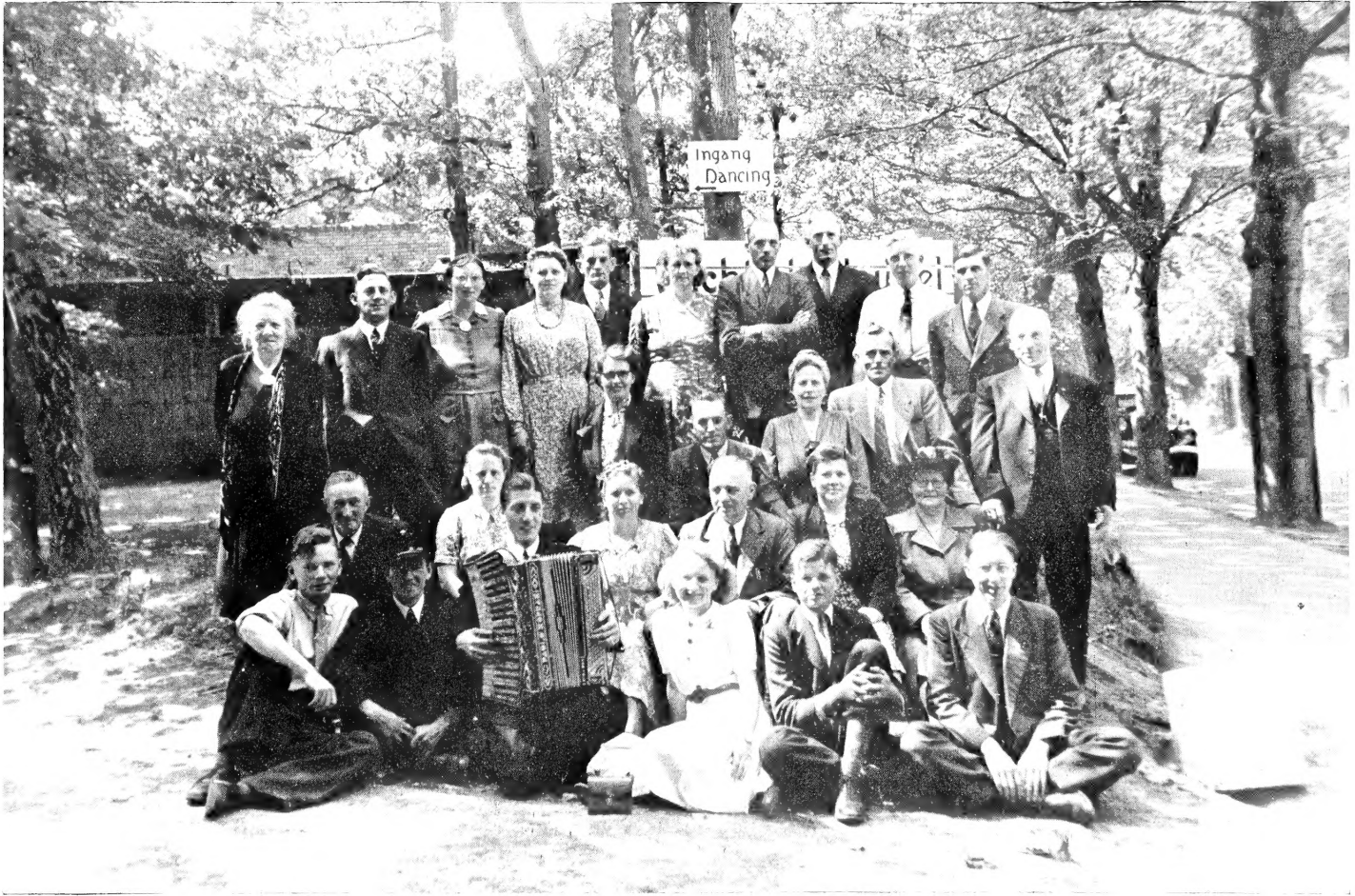
Excursion of MESKERS BROS staff. June 1948