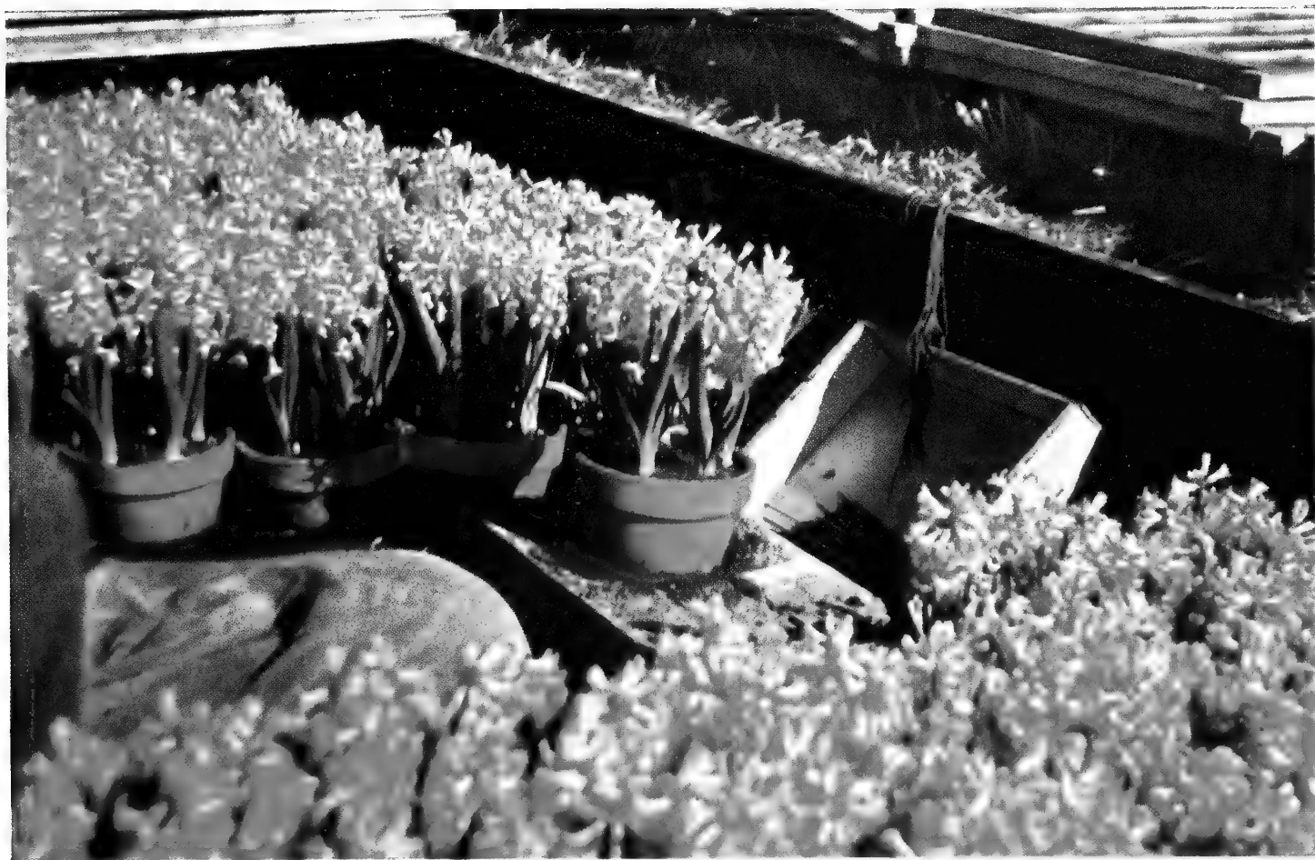
MESKERS BROS quality Hyacinths forced at Long Island N.Y. in cold frames without any heat for Easter March 28th 1948