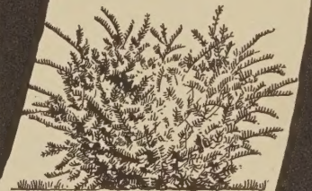
Spreading Yew 12-15 inches spread