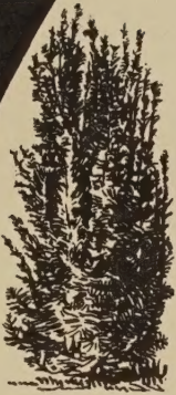
Hicks Yew 12-15 inches high