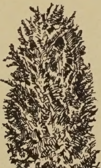
Hatfield Yew 8-12 inches high