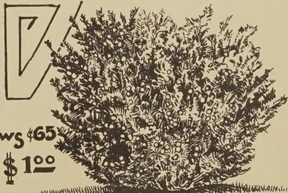
Kelsey Berry Yew 2 x transplanted. 12 inches high