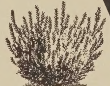
Intermedia Yew 10-12 inches high