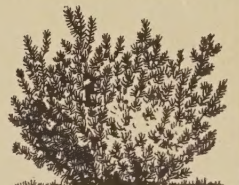
Dwarf Yew 8-10 inches high