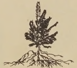
Col. Blue Spruce