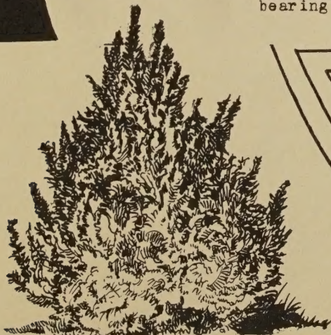
Vermeulen Yew 2 x transplanted. 12 inches high