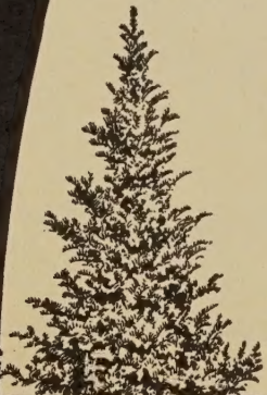
Upright Yew 12-15 inches high