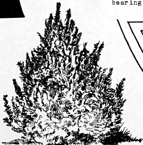
Vermeulen Yew 2 x transplanted. 12 inches high