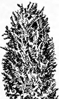
Hatfield Yew 8-12 inches high