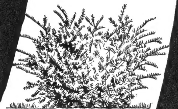
Spreading Yew 12-15 inches spread