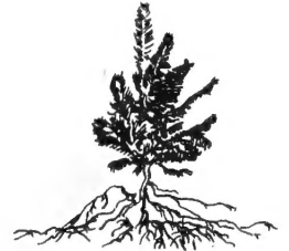
Col. Blue Spruce