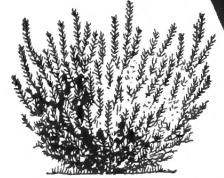
Intermedia Yew 10-12 inches high