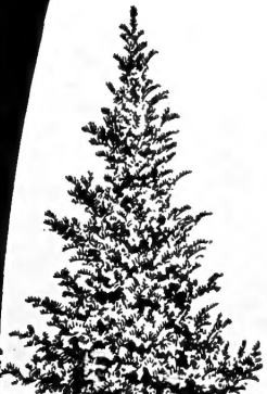
Upright Yew 12-15 inches high