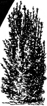
Hicks Yew 12-15 inches high