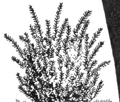
Brown's Yew 8-10 inches high