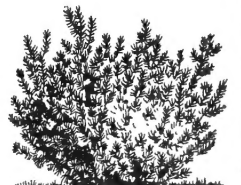
Dwarf Yew 8-10 inches high