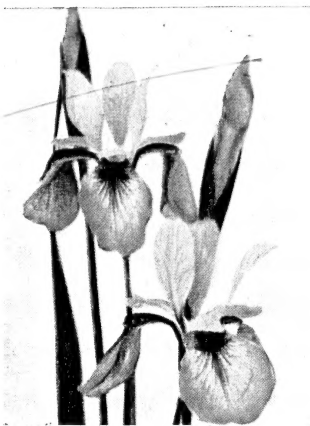
Yellow Water Iris

Harebell (Campanula carpatica). Flowers light blue. Summer. 12 inches.