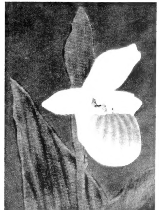
Showy Lady's Slipper

It is not hard to grow Native Orchids but one must keep in mind the likes and dislikes of each variety. The orchids, as a rule, prefer an acid soil, so be sure to paint all cement work in your bog garden as cement contains lime. The soil should be composed mostly of peat, leaf-mold or No. 20 "Wild Life" Humus. The bog loving varieties must have plenty of moisture at all times.