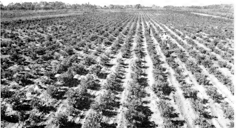
Azaleas, most Mollis.