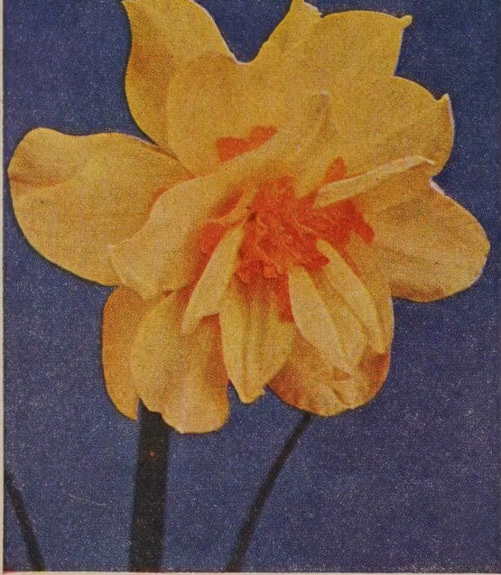
TWINK (See Page 6 for Description)