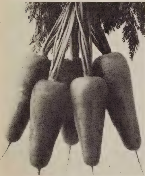
CARROTS, RED CORED CHANTENAY

SOUTHERN GIANT CURLED. (Pkt. 10) (oz. 25c) (¼ lb. 75c)