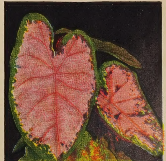
CALADIUM (ELEPHANT'S EAR) (See Page 9 for Description and Prices)