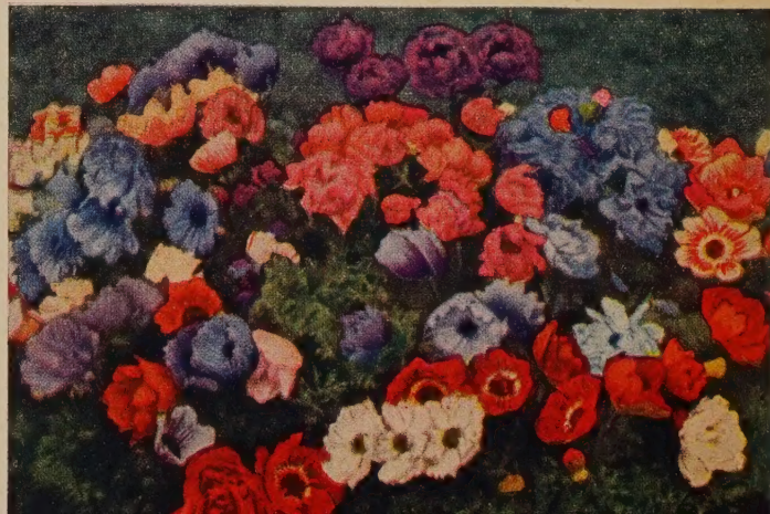
ANEMONES, ST. BRIGID'S