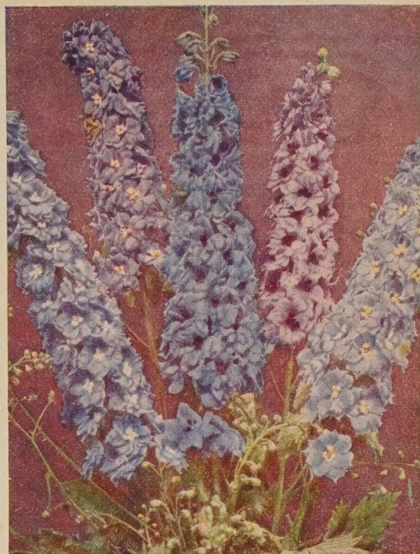
DELPHINIUM. HALLAWELL'S PACIFIC GIANTS

EXCELSIOR MIXED. (Pkt. 15c) (1/4 oz. 45c) FAIRY BOUQUET. (Pkt. 15c) (1/8 oz. 45c)