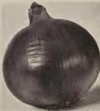
ONION, UTAH, SWEET SPANISH

ALASKA. Quick maturing, winter variety. AMERICAN WONDER. Quick maturing, 15 inches. LAXTON'S PROGRESS. Very large pods, 24 inches. THOMAS LAXTON. Large pods, 3 feet. DWARF TELEPHONE. 18 inches. MELTING SUGAR or EDIBLE POD. 4 feet. TELEPHONE or ALDERMAN. Tall, must be staked.