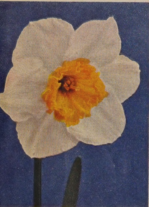
JOHN EVELYN (See Page 6 for Description)