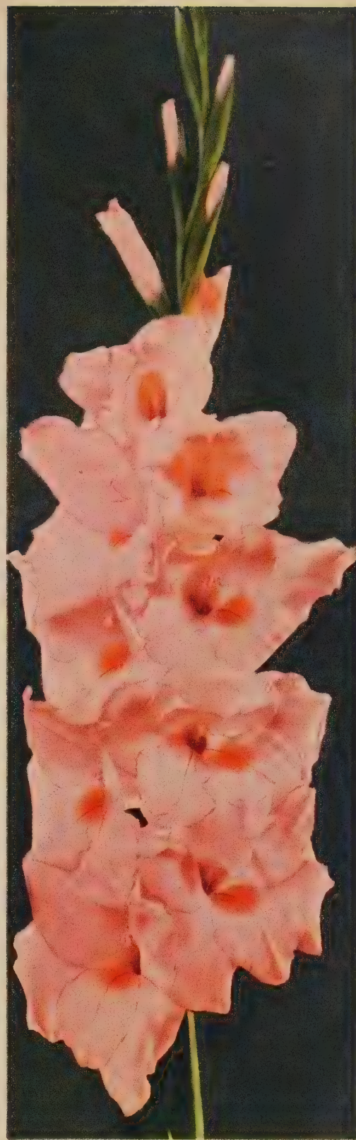
HELEN OF TROY

SPITFIRE. Excellent red. Flowers slightly larger than other varieties.