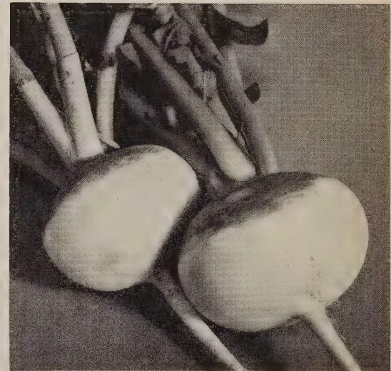
TURNIP, PURPLE TOP WHITE GLOBE

CHINESE CABBAGE. Crisp and tender leaves.