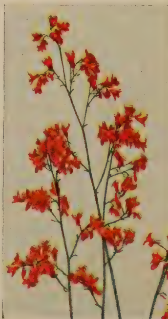
HEUCHERA (Coral Bells)