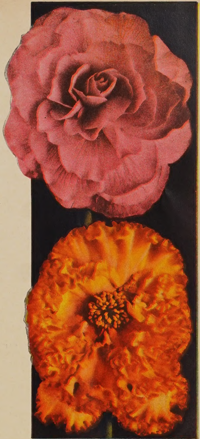
(Upper) CAMELIA FLOWERED (Lower) CRISPA

CAMPERNELLE. These are fragrant, rich yellow flowers borne in clusters of 3 to 6 and on stems 12 to 15 inches tall. They are graceful and charming in the garden and are very desirable for cutting. (1.50 for 12) ($11.00 per 100)