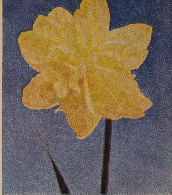
THE PEARL (See Page 6 for Description)