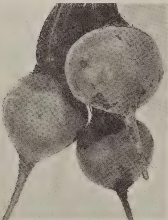
BEETS, DETROIT, DARK RED