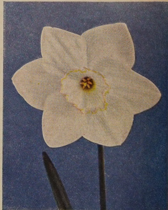
HERA (See Page 6 for Description)

256 MARKET STREET SAN FRANCISCO 11, CALIFORNIA