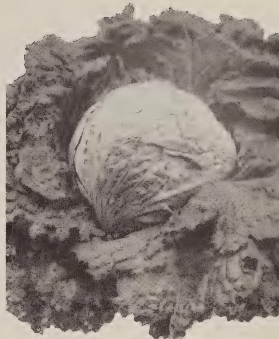
LETTUCE, HALLAWELL'S No. 847