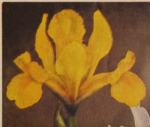
DUTCH IRIS, YELLOW QUEEN