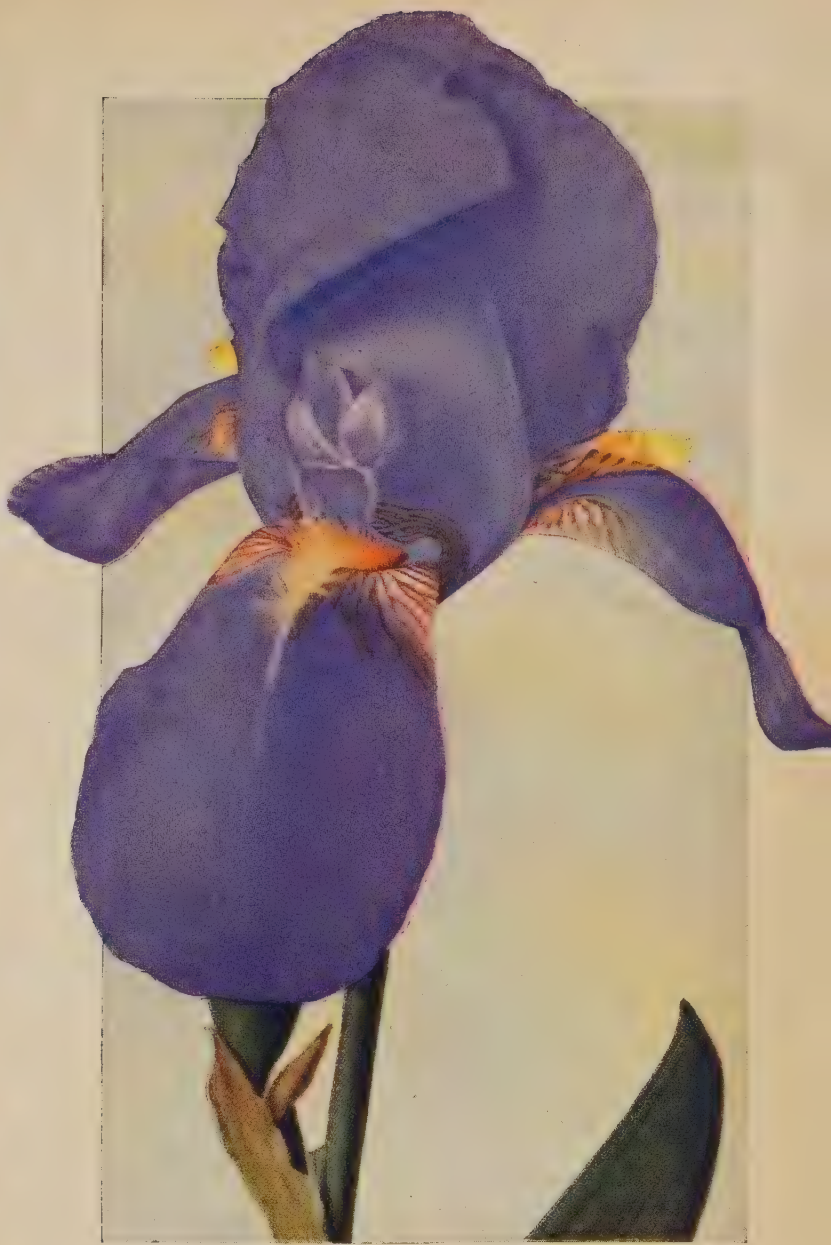
IRIS, SIERRA BLUE