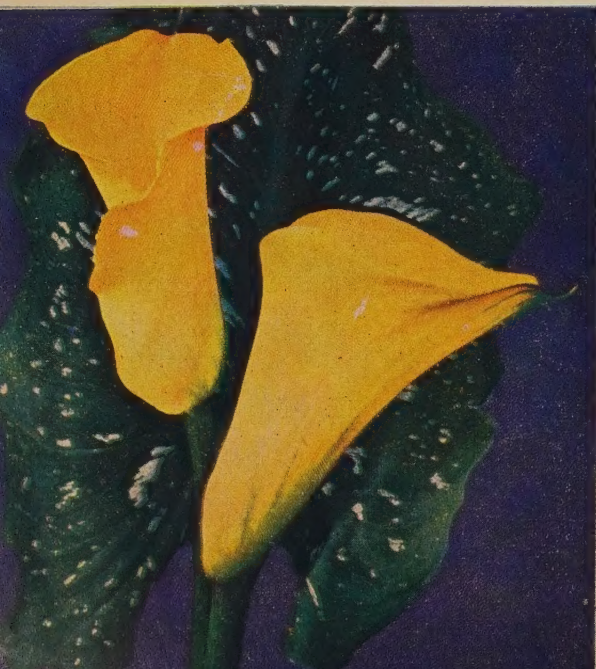
YELLOW CALLA ( Elliottiana )