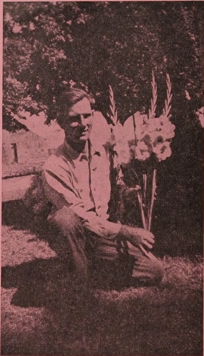
Yours Truly and 3 Spikes of PINK RADIANCE Grown From No. 5 Bulbs