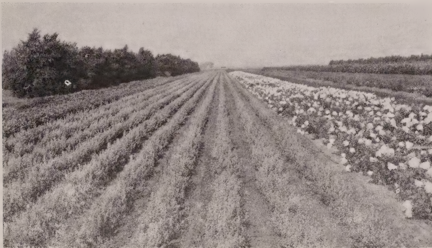
RUSSIAN OLIVE SEEDLINGS and HYDRANGEA PEEGEE