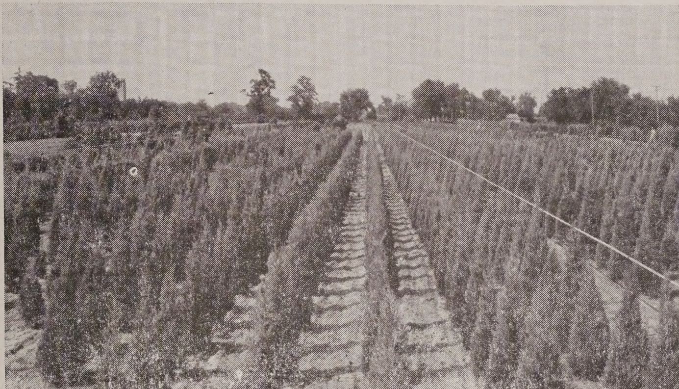
BLOCK OF GRAFTED JUNIPER

In order to get uniform habit of growth and color of foliage, we have selected some outstanding types of various forms and have reproduced by grafting. See following varieties for further description.