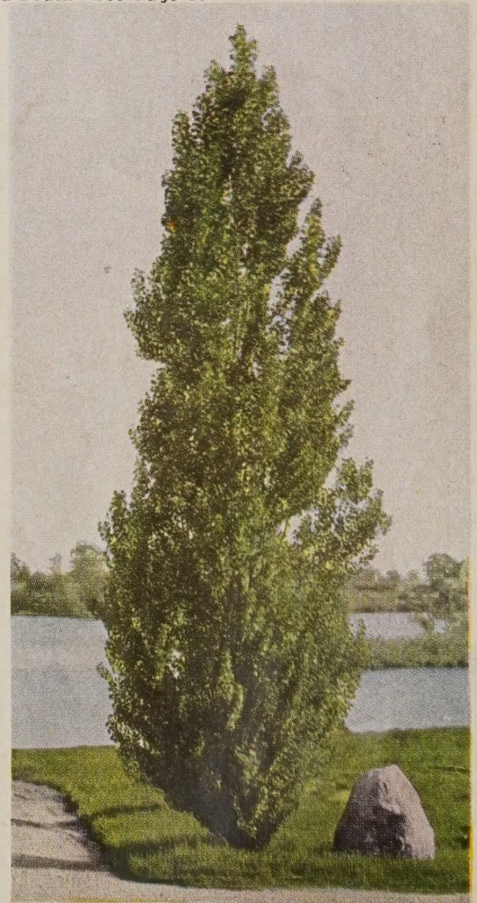
Bolleana Poplar—See Page 12