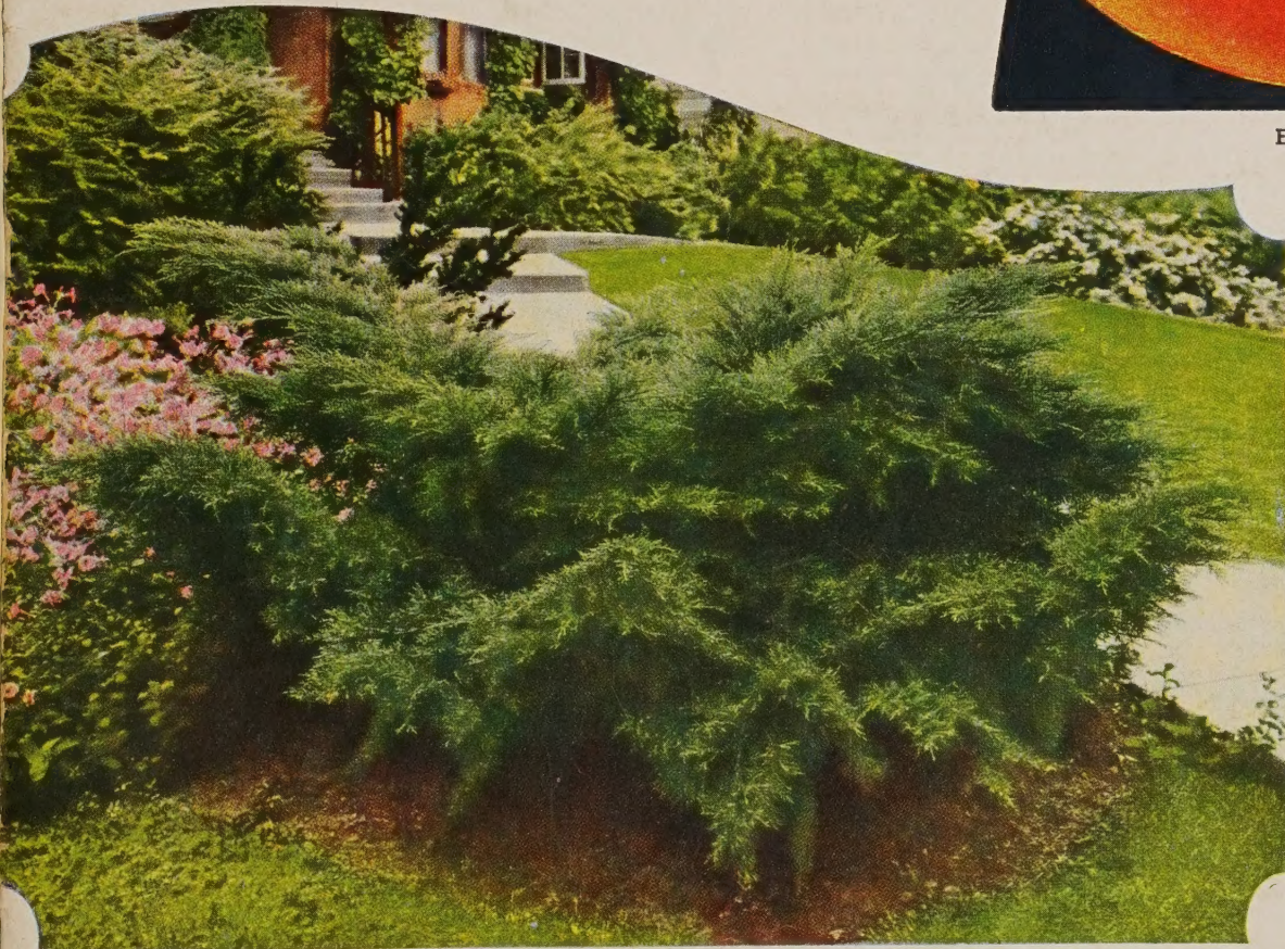
Pfitzer Juniper—See Page 7.