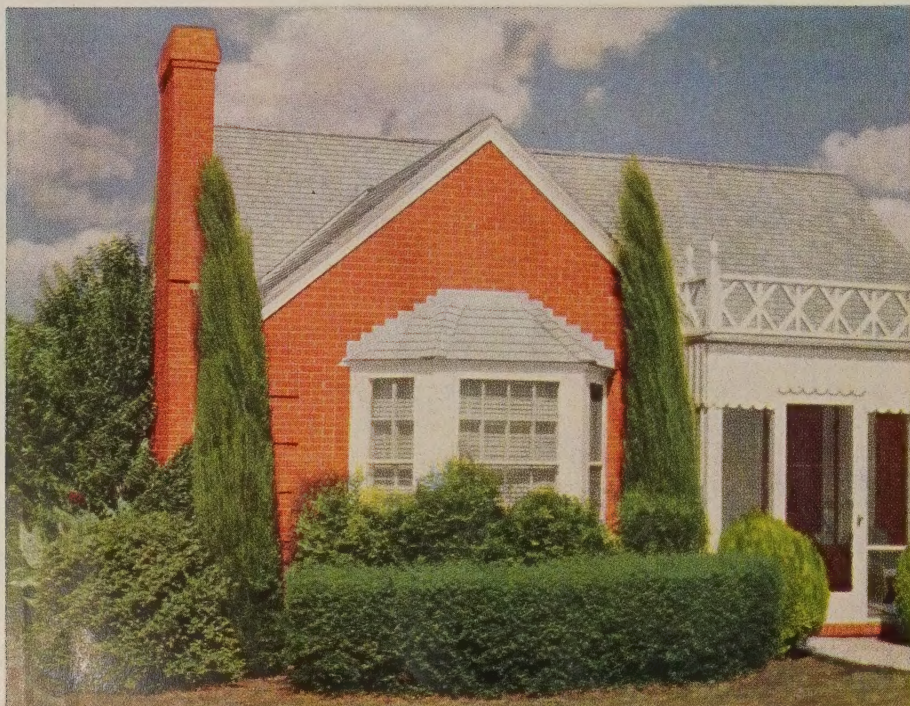
Worthiana Italian Cypress