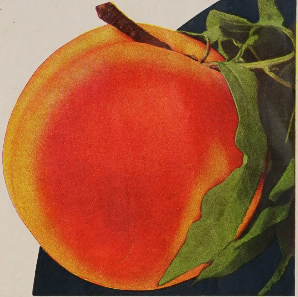
Elberta Peach—See Page 15