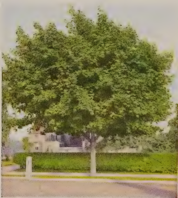
Western Green Ash