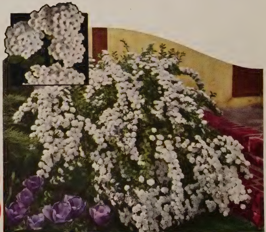
Spirea Van Houttei