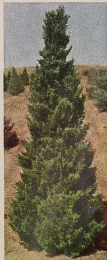
Cannarti Red Cedar