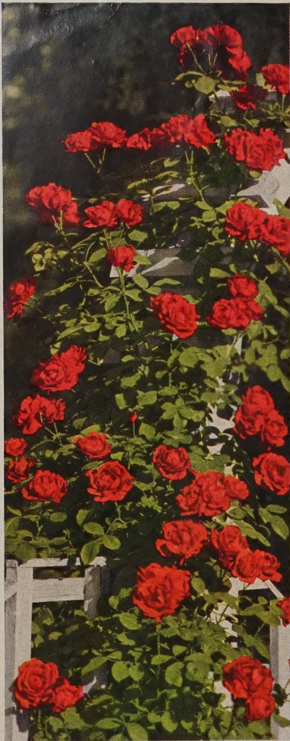
Paul's Scarlet Climber

A COMPLETE LISTING OF HYBRID TEA ROSES WILL BE FOUND ON PAGES 8 AND 9.