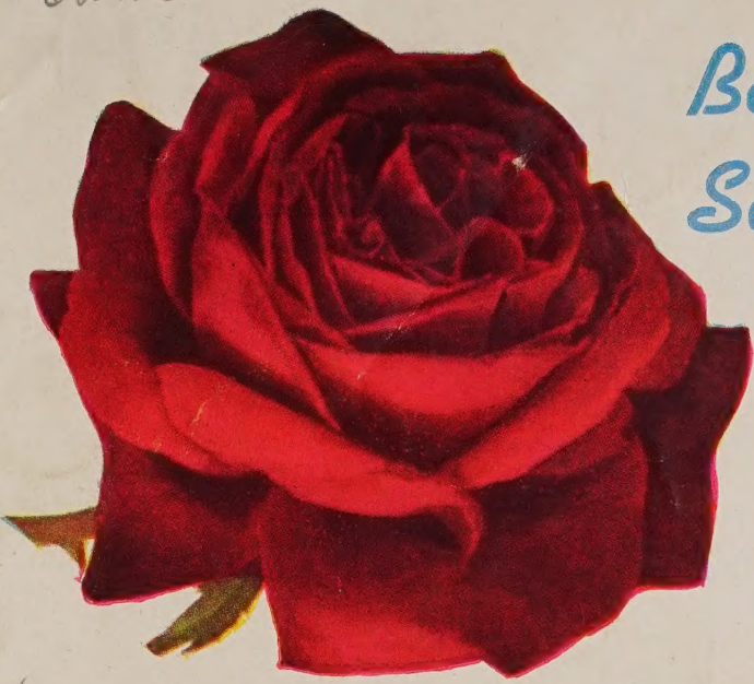
Will Rogers Rose—See Page 9

Beautifying the Homes of the Southwest Since 1884 . .