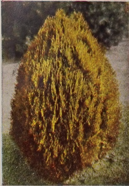
Berckman's Golden Arbor-Vitae