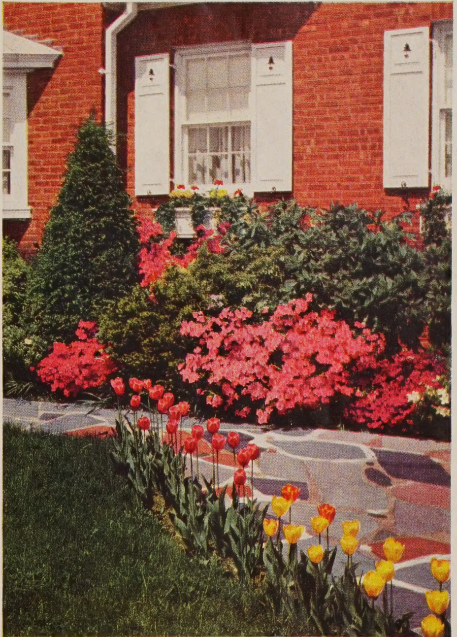
Azaleas with Sheared Youpon in Background