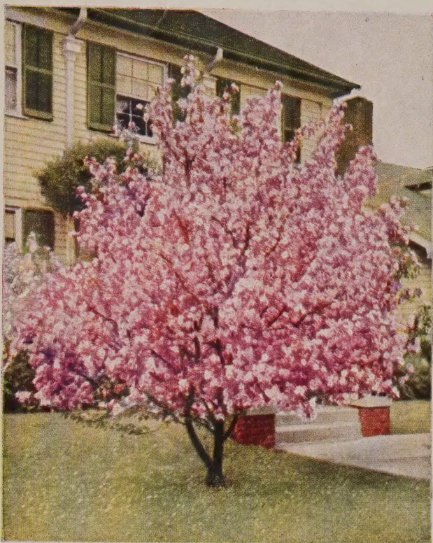
Bechtel's Double Flowering Crab