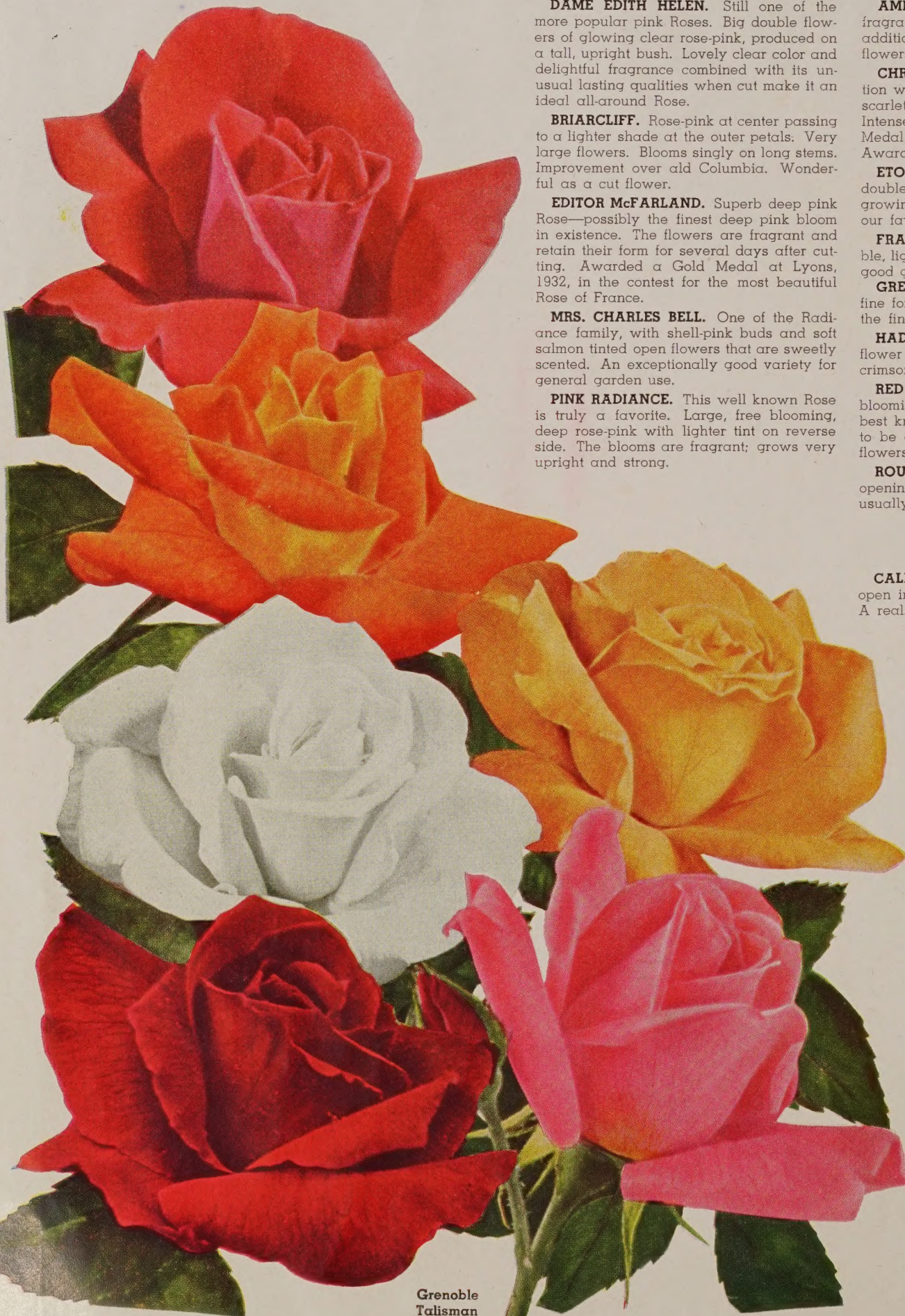
Grenoble Talisman Caledonia Rouge Mallerin

SOEUR THERESE. A favorite yellow Rose. Large plants with quantities of shapely golden yellow blooms; fragrant and lasting.