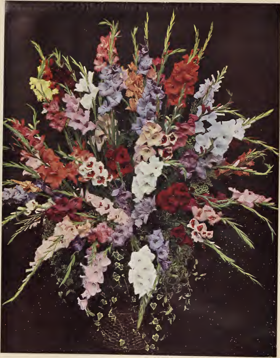
ARTISTIC BASKET WITH GLADIOLUS, PFITZER'S ORIGINATIONS ONLY, SHOWN BY US AT HAARLEM JULY 28th. 1930. NOTE THE FACT THAT NEARLY ALL COLORS ARE REPRESENTED.